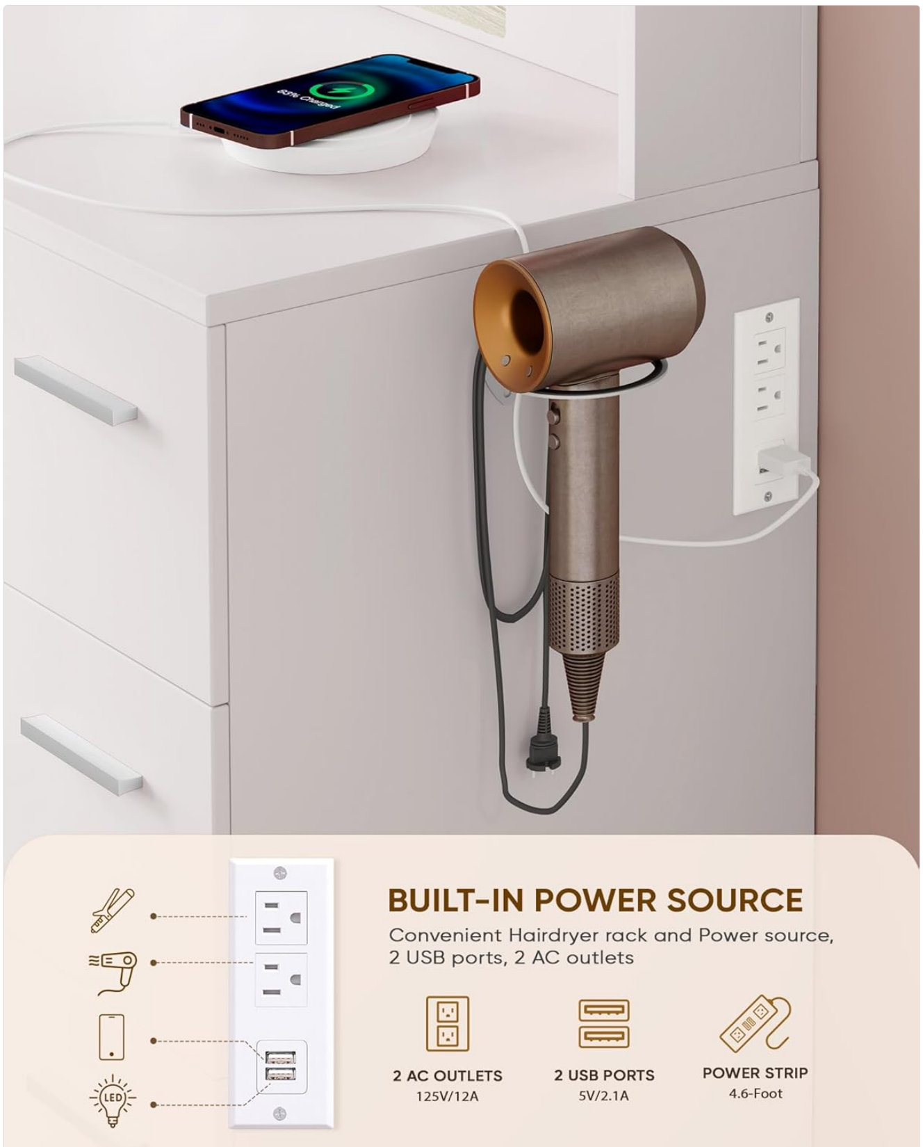
Figure 3: Built-in Power Source and Hairdryer Rack.