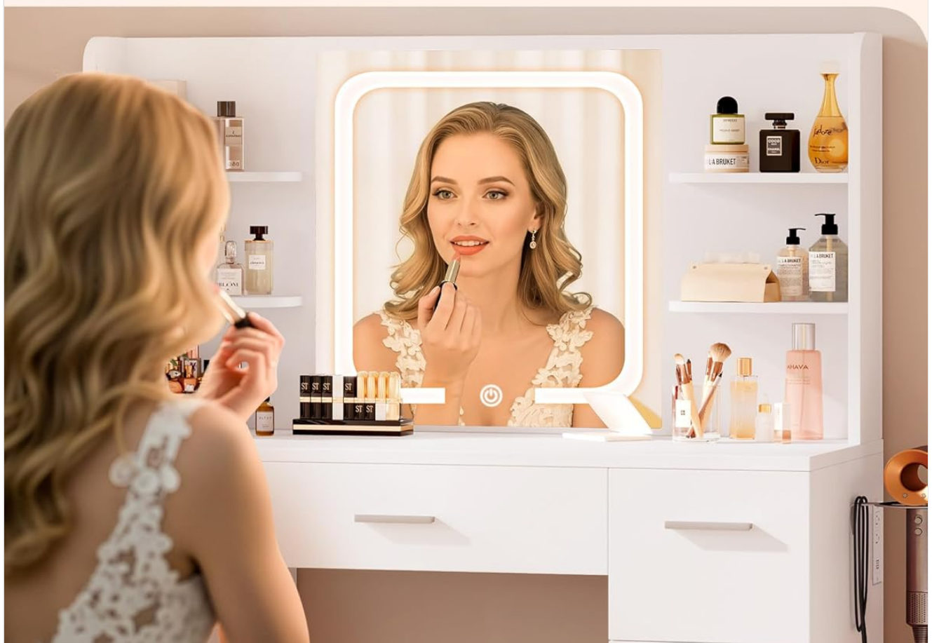
Figure 2: LED Mirror Lighting Modes and Dimming Function.