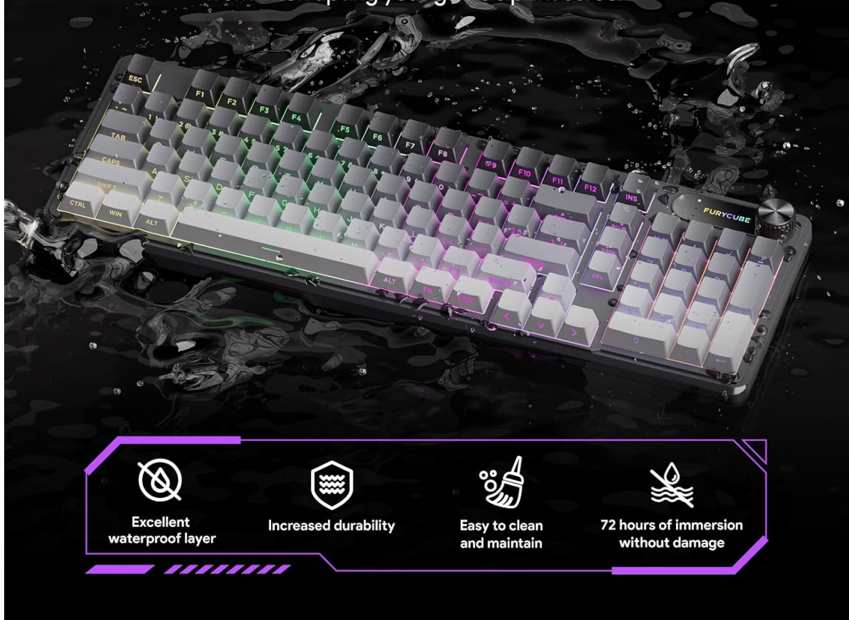
Image 5.1: The FURYCUBE IP98 demonstrating its IPX8 waterproof capabilities.

Waterproof coating prevents accidental spills from interrupting your game's print screen