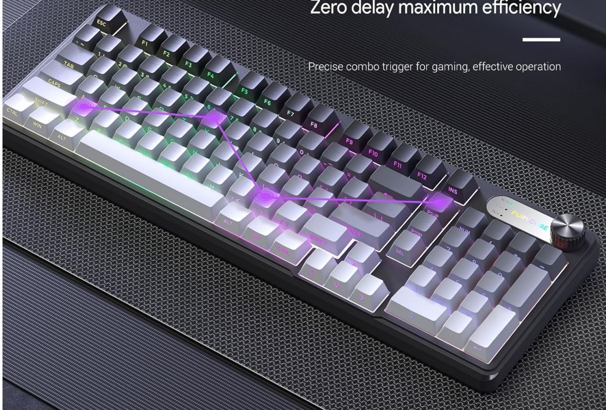
Image 4.5: Illustration of the FURYCUBE IP98's 19-key anti-conflict feature.

Precise combo trigger for gaming, effective operation