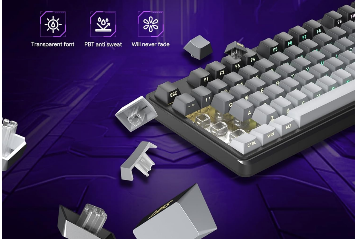
Image 4.3: Close-up view of the FURYCUBE IP98's side-printed PBT keycaps.