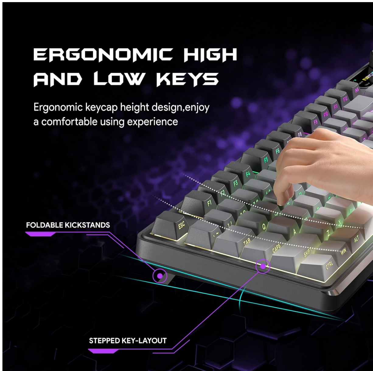
Image 4.6: The FURYCUBE IP98 highlighting its ergonomic design and adjustable kickstands.

Ergonomic keycap height design, enjoy a comfortable using experience