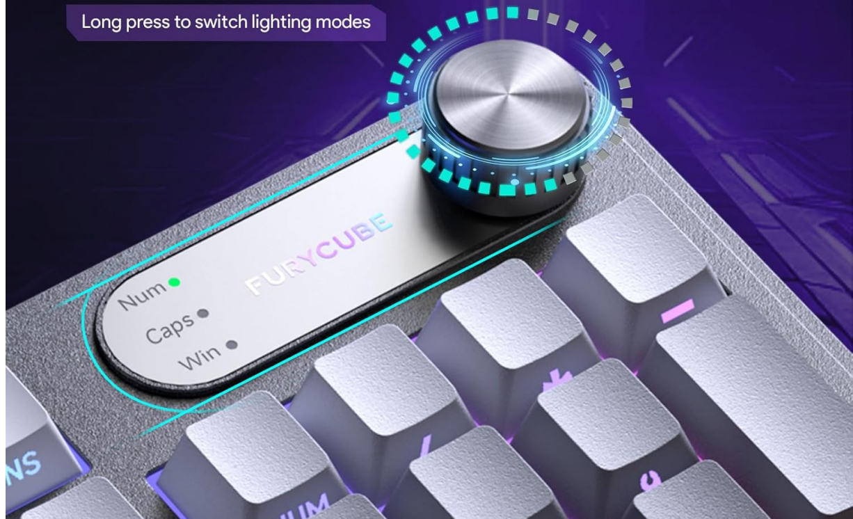
Image 4.4: The FURYCUBE IP98's multifunction knob for volume and lighting control.