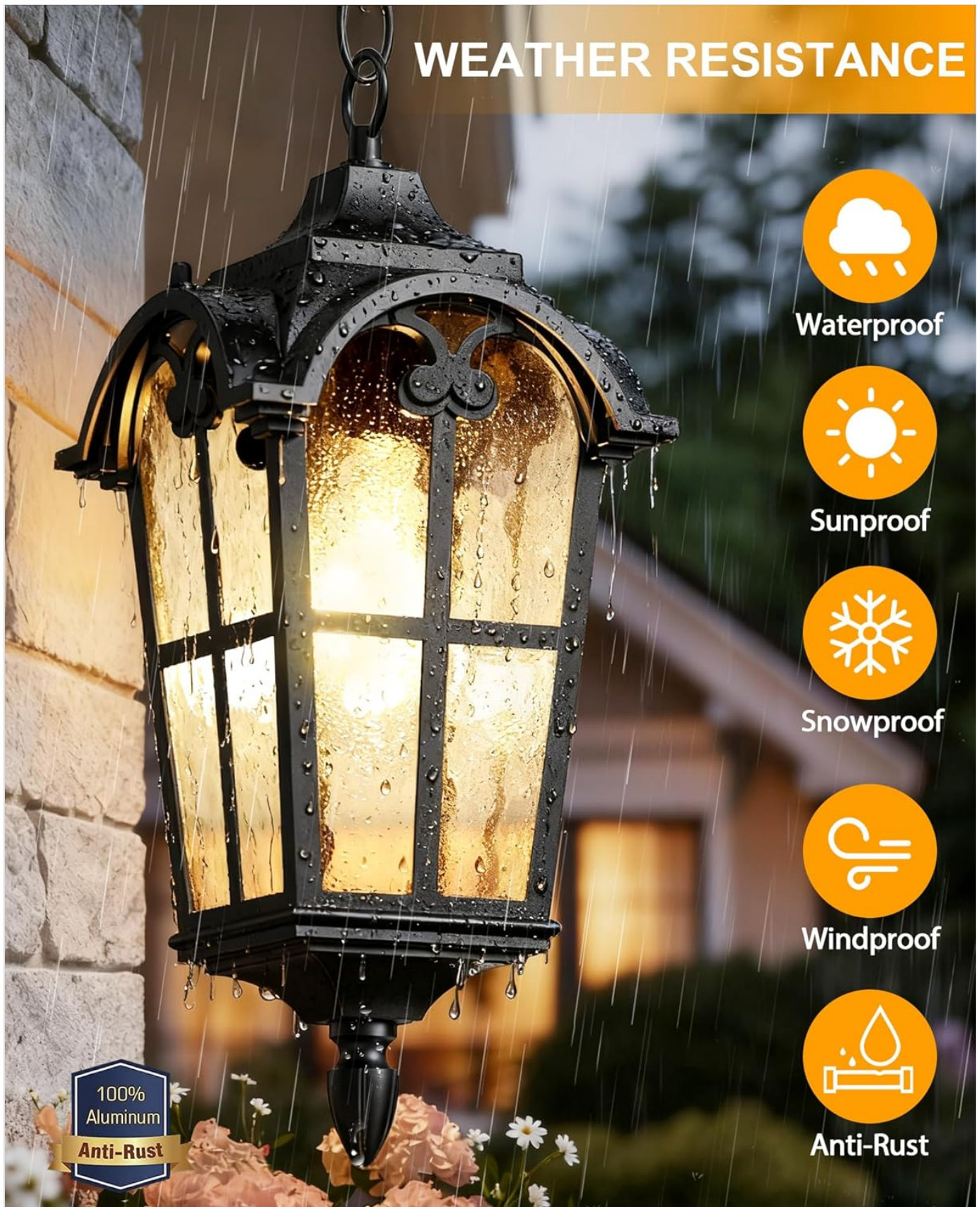
Image: Weather resistance features of the pendant light.