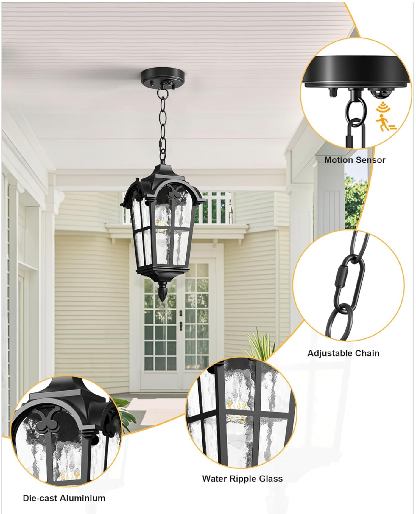
Image: Key components including motion sensor and adjustable chain.