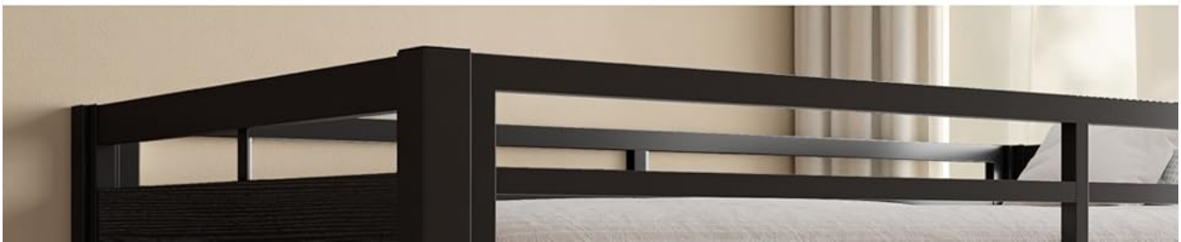
Image: A close-up view illustrating the 12-inch storage space available beneath the lower bunk, ideal for boxes or bins.