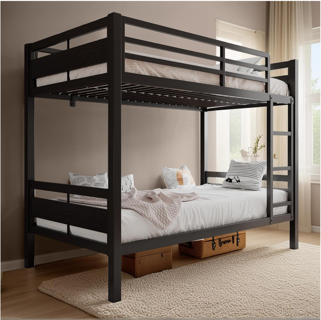
Image: Fully assembled nesture. Twin Over Twin Bunk Bed in black, showcasing its robust design and space-saving structure.