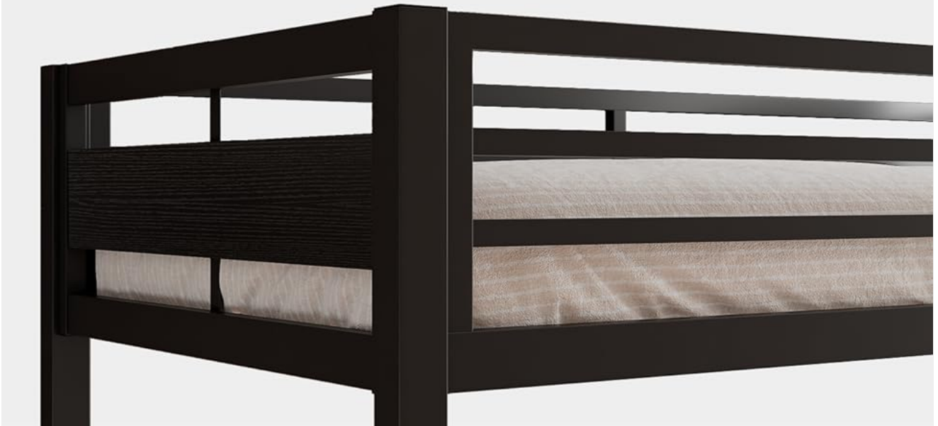
Image: A visual representation of the bed's metal slat system and the "Easy Assembly" feature, highlighting how slats click into place effortlessly.

With extra metal slats, the bed frame stays twist-free and keeps its shape - for safer, more stable sleep night after night.