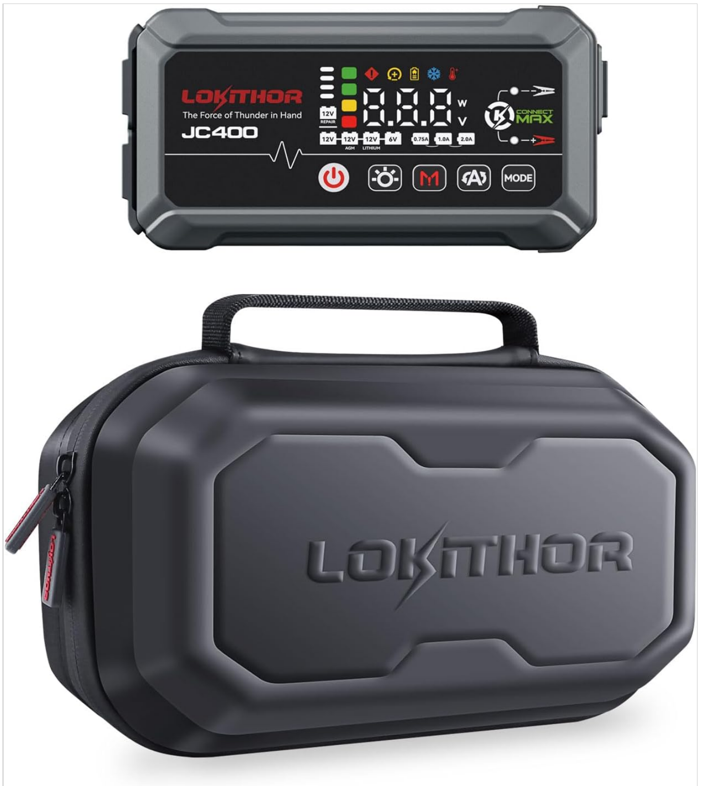
Image: The LOKITHOR JC400 unit and its protective storage case.