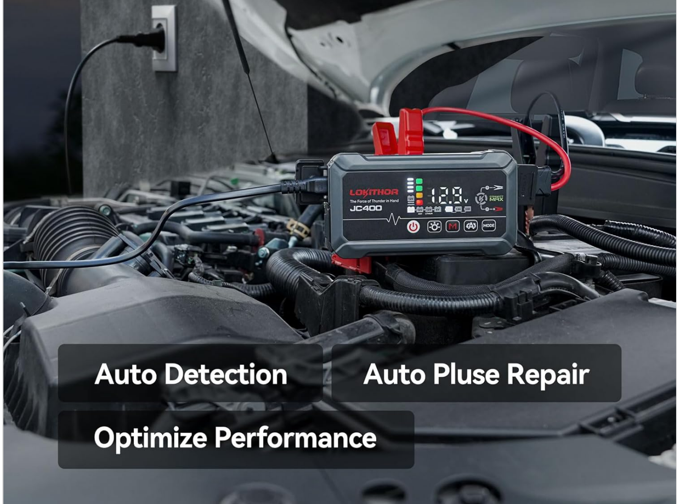
Image: The LOKITHOR JC400 actively charging and maintaining a car battery, displaying its smart features.