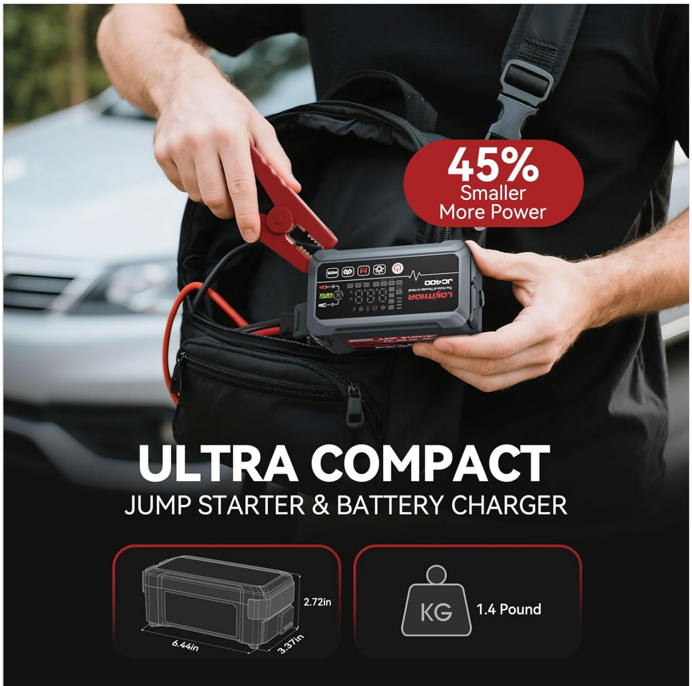
Image: The LOKITHOR JC400 demonstrating its ultra-compact design, making it easy to carry.

The unit is designed for portability and durability, featuring a robust casing and a clear digital display. Key elements include: