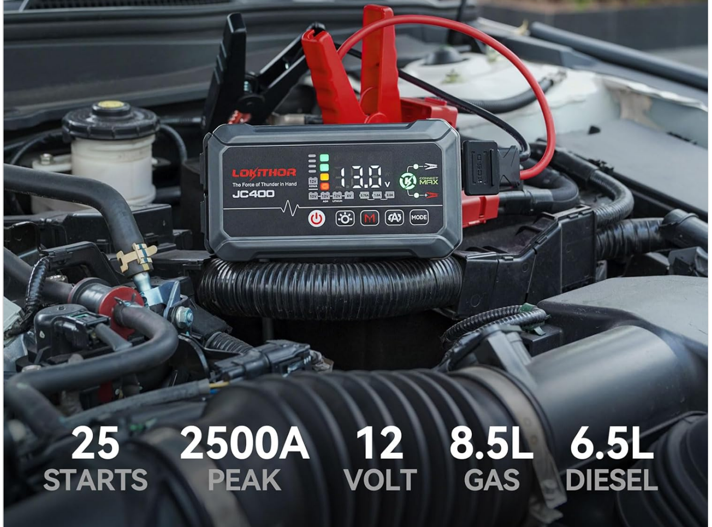
Image: The LOKITHOR JC400 connected to a vehicle battery, ready to jump start.