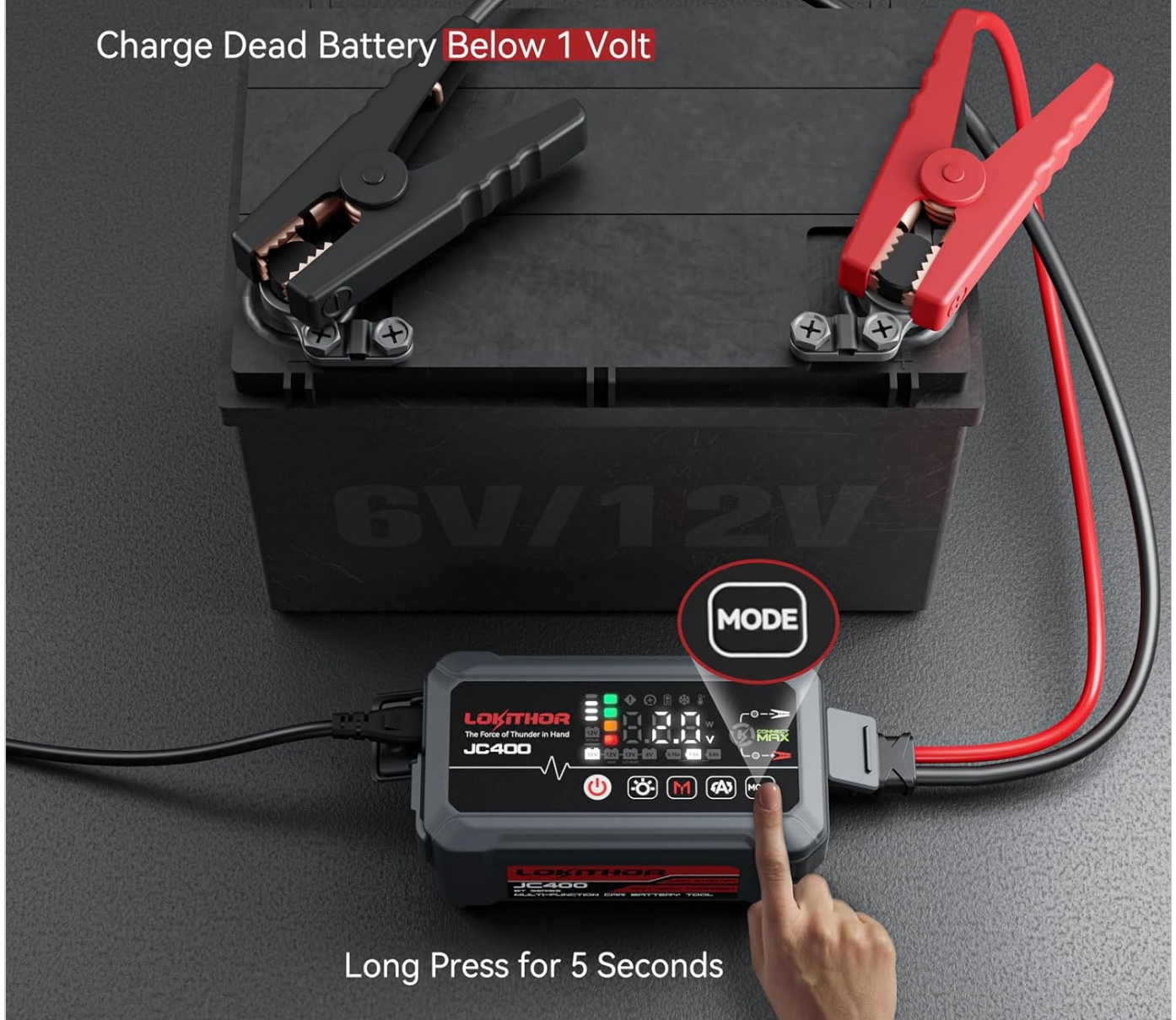
Image: Activating the Force Charging Mode on the LOKITHOR JC400 for deeply discharged batteries.