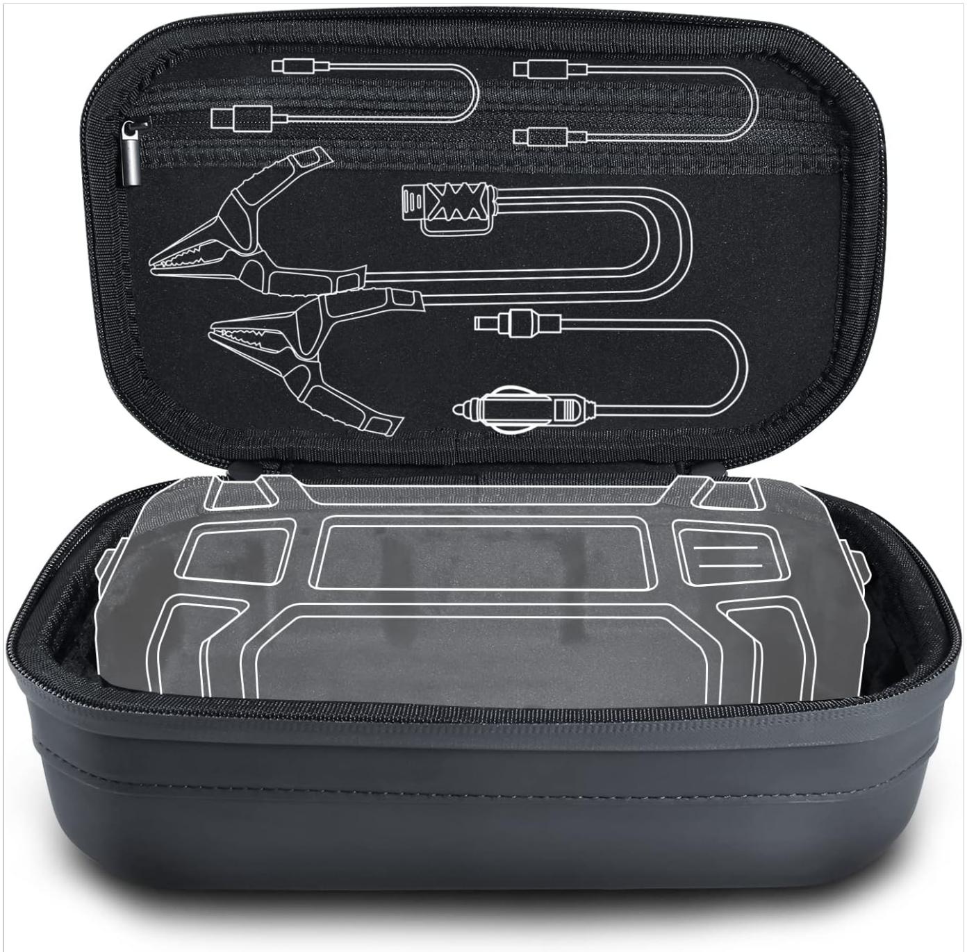
Image: The LOKITHOR JC400's durable storage case, highlighting its water-resistant properties.