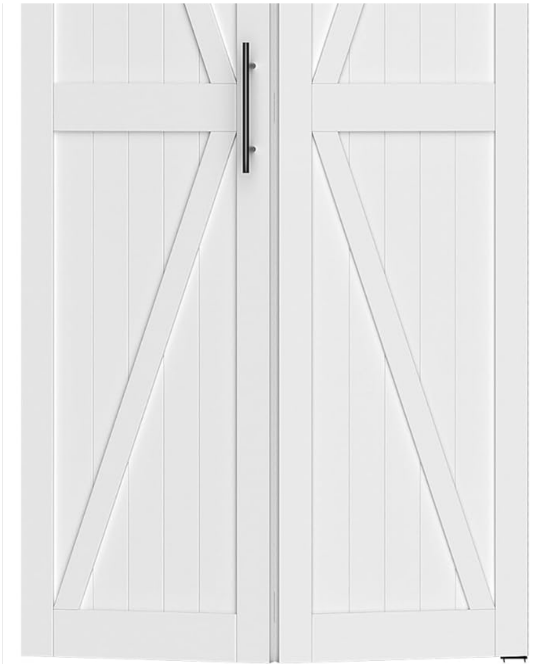
Image 1.1: The ROOMTEC 36"x84" Solid Pine Bi-Fold Closet Door in white, featuring a barn door style design with track hardware installed at the top.