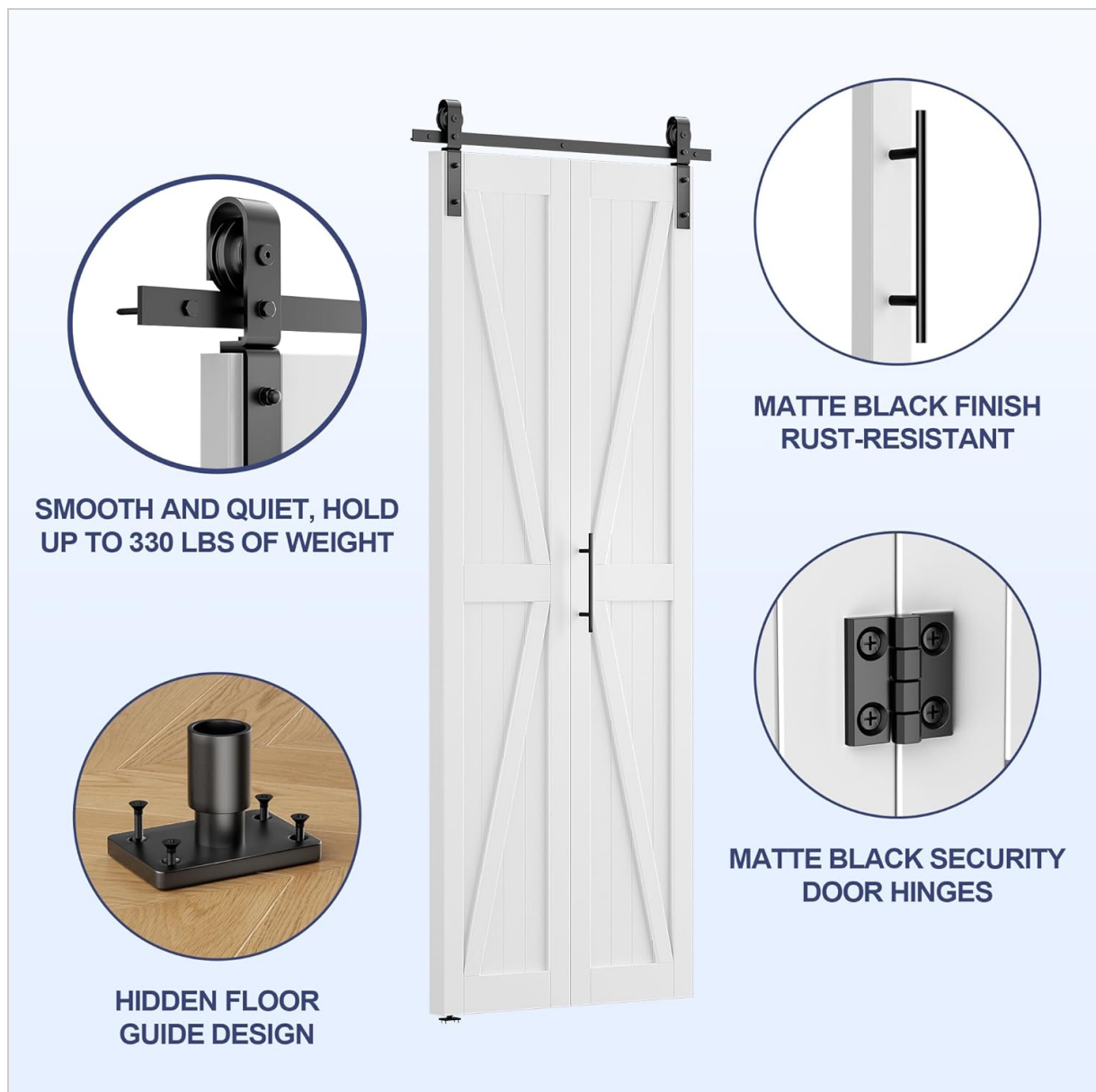
Image 3.2: Close-up views of the heavy-duty raw steel rail, T-shaped floor guide, and nylon pulleys with bearings, highlighting their robust construction and smooth operation.