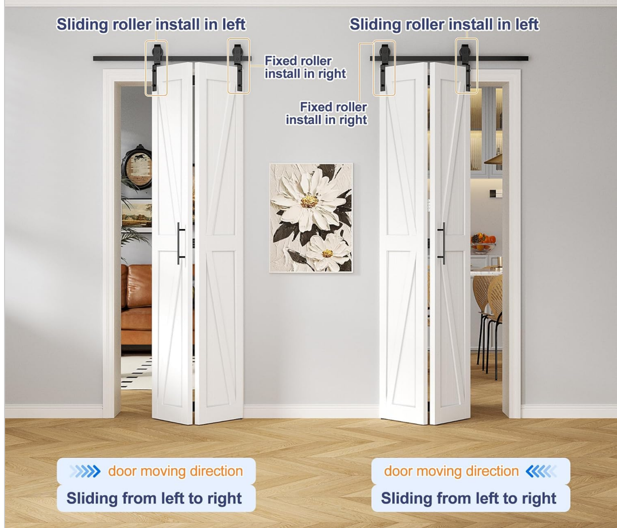
Image 4.1: Illustration showing two configurations for the bi-fold door, allowing it to slide open from left to right or right to left, depending on roller placement.