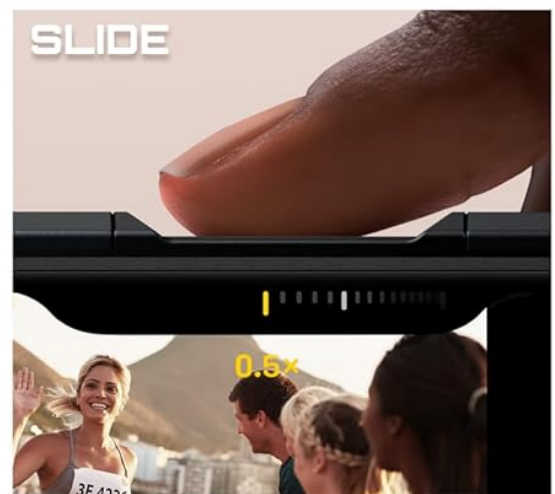
Image: Close-up of the built-in camera control button on the case, illustrating its use for light press, click, and slide actions.

Built with 19 pure copper conductors for precise camera control