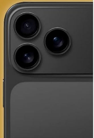
Image: The SUPCASE Unicorn Beetle Pro case designed for iPhone 17 Pro Max, highlighting its compatibility and precise fit.