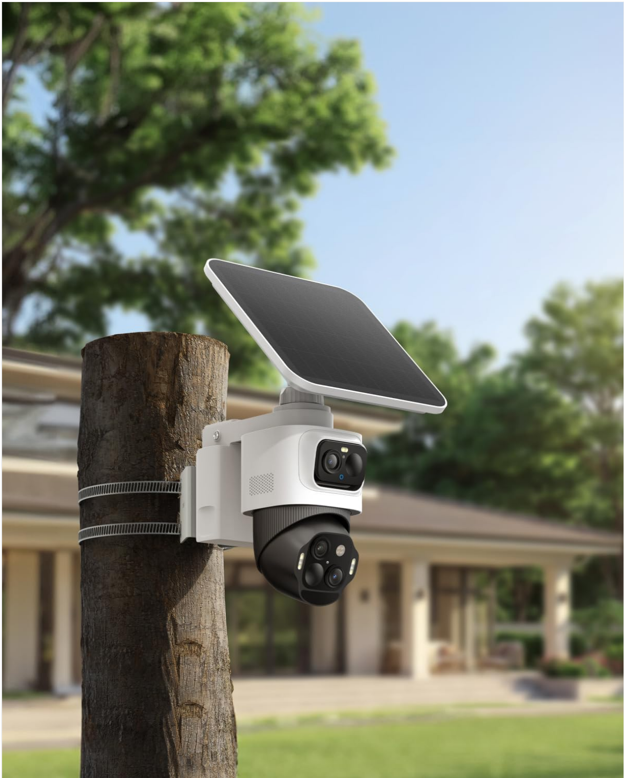
Image: An eufy camera attached to a tree trunk with the pole mount bracket, showcasing flexible placement options in a garden setting.