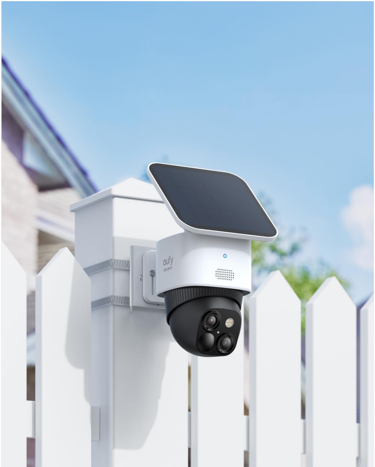
Image: An eufy camera with a solar panel accessory mounted on a white fence post using the pole mount bracket, illustrating a common home installation.