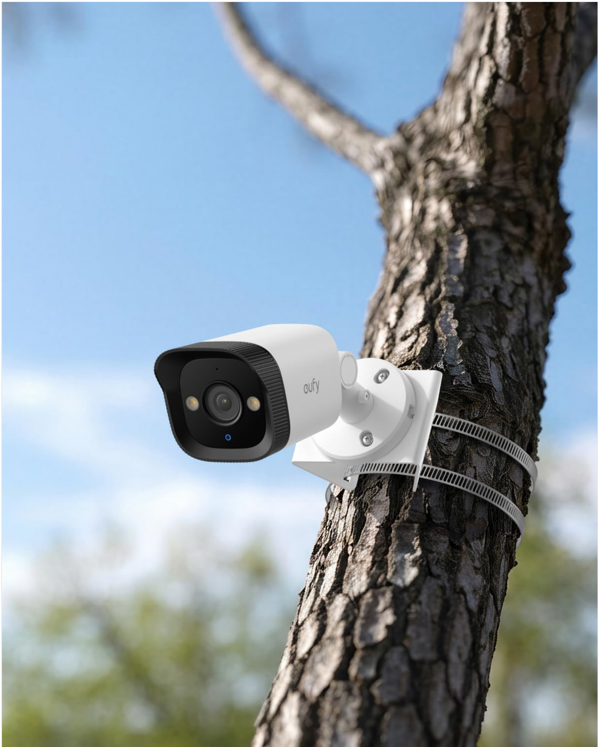
Image: A eufy bullet-style camera mounted on a tree trunk with the pole mount bracket, demonstrating compatibility with different camera form factors.