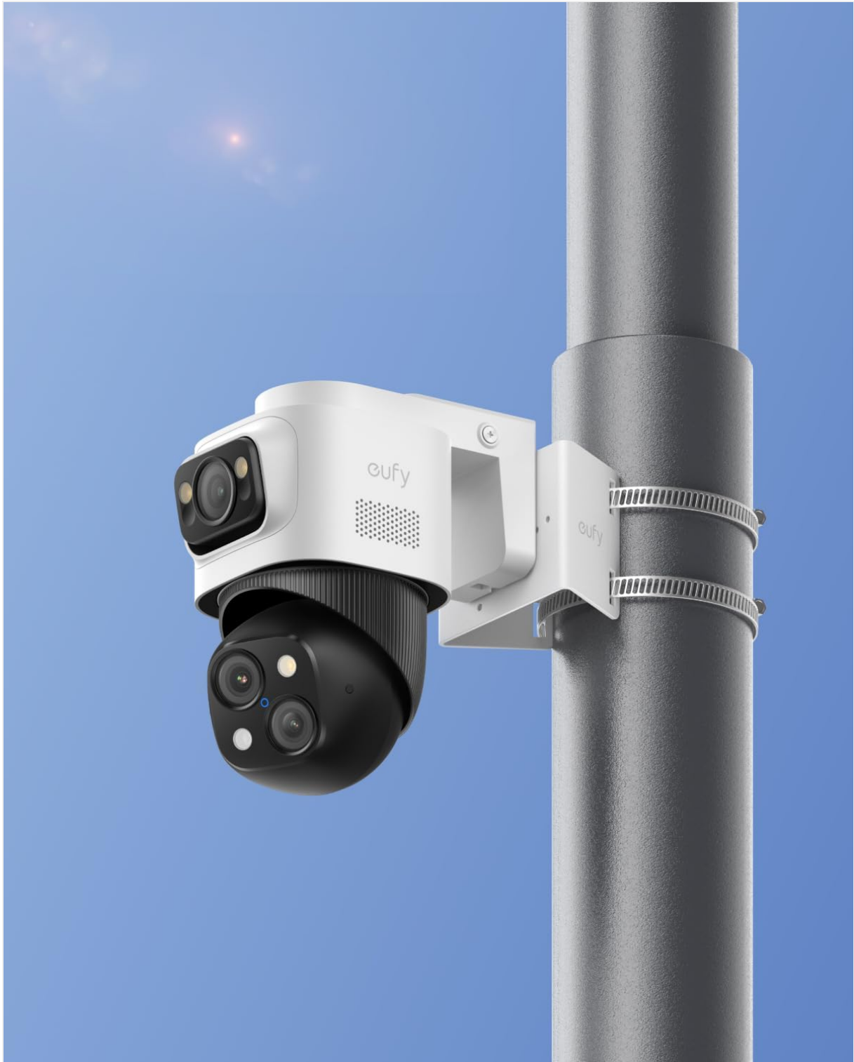
Image: eufy camera securely mounted on a street light pole, demonstrating a typical installation scenario for the pole mount bracket.

Choose a vertical pole with a diameter between 50 mm and 150 mm. Ensure the location provides a clear view for your camera and is within range of power and network connectivity if required.