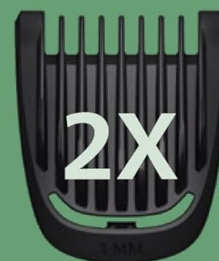
Stubble combs 1-2 mm