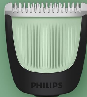
Image: A detailed view of the trimmer's self-sharpening blades, highlighting their rounded tips designed for skin comfort.