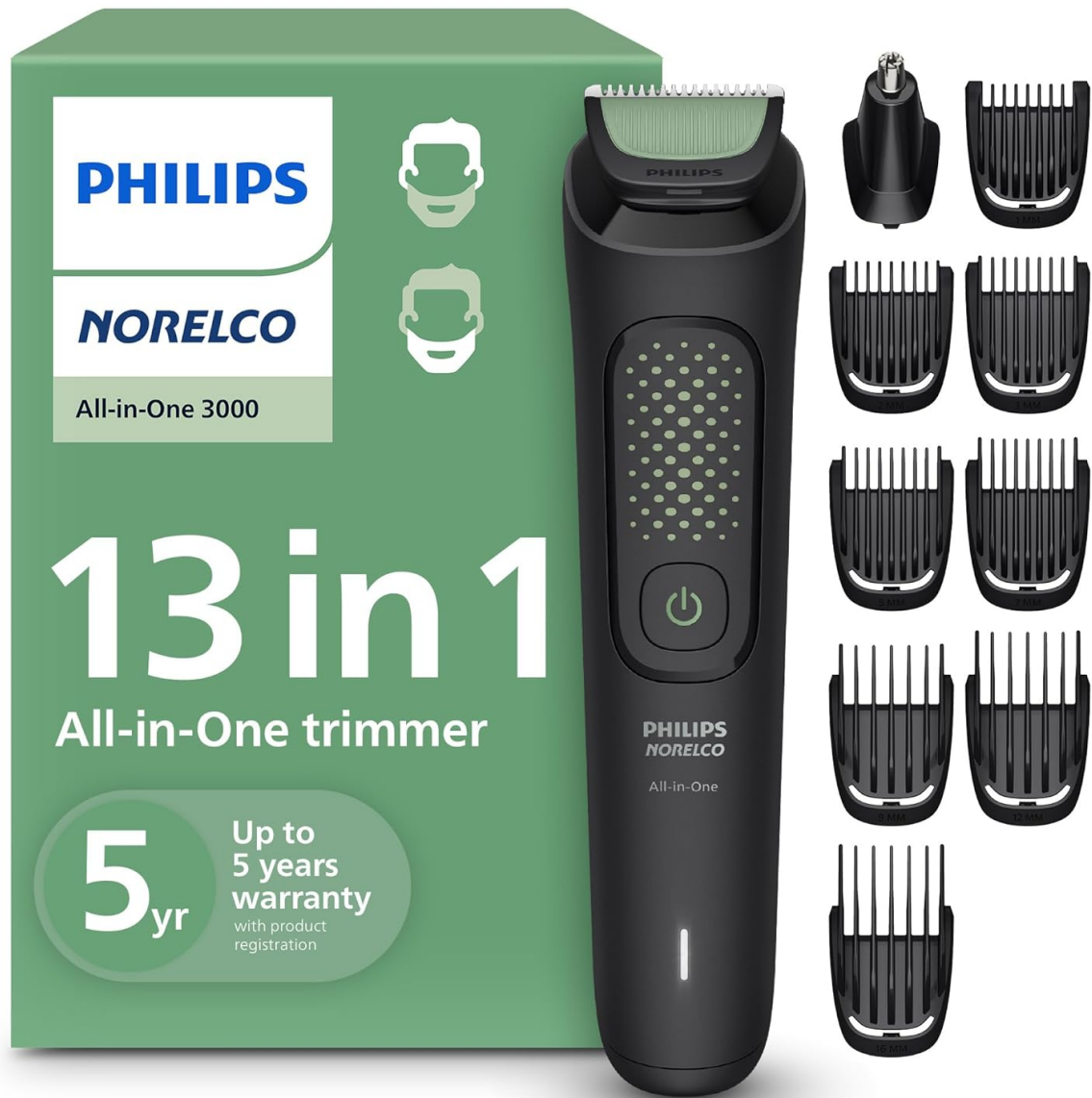
Image: The Norelco Philips All-in-One 3000 Series MG3919/50 trimmer, showcasing the device and its various attachments within its packaging.