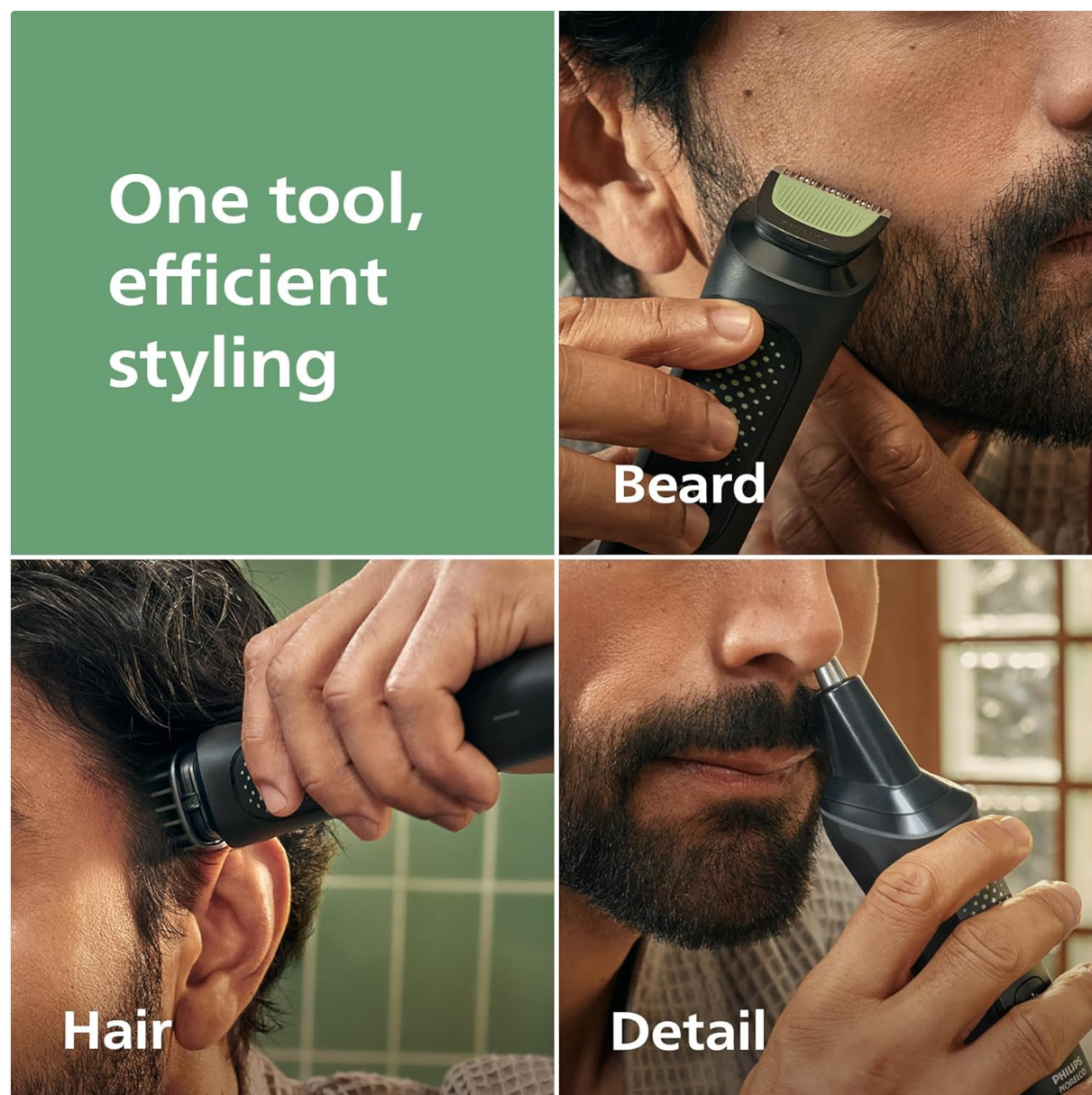
Image: A man demonstrating the use of the trimmer for various grooming tasks, including beard trimming, hair cutting, and detail work.

The Norelco Philips All-in-One 3000 Series trimmer is designed for versatile grooming of your beard, hair, and nose/ear areas.