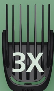
Hair combs 9-16 mm