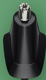
Nose and ear trimmer