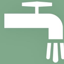
Image: Trimmer blades and comb attachments being rinsed under running water for easy cleaning.