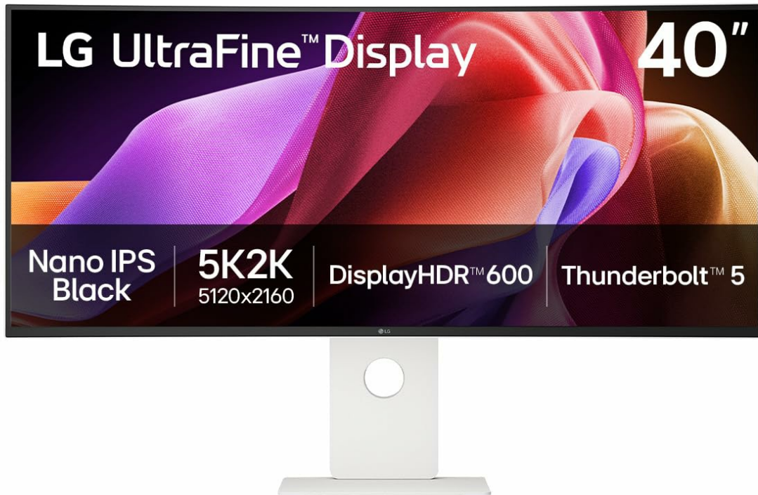
Figure 1: Front view of the LG 40U990A-W Ultrafine 5K2K WUHD Monitor.