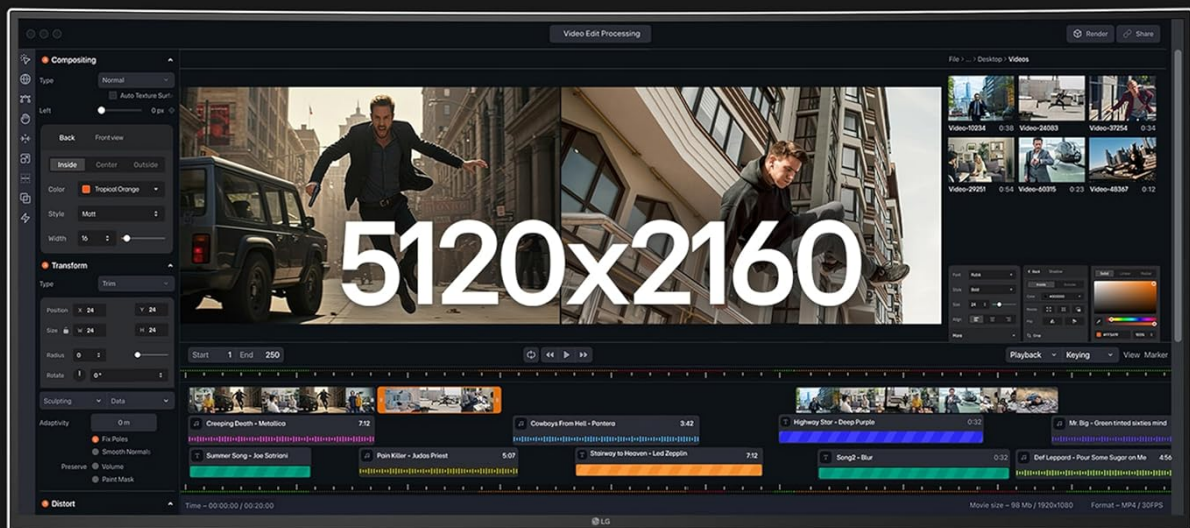
Figure 4: The 5K2K resolution provides ample screen space for detailed work.