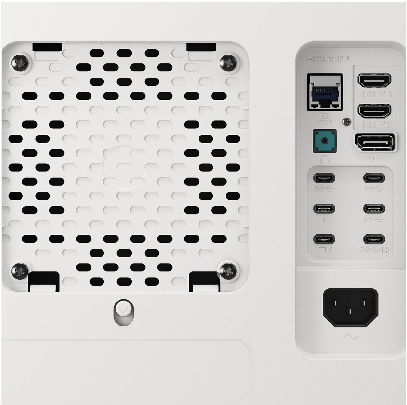
Figure 3: Thunderbolt 5 connection providing power, data, and display to a laptop.