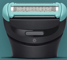
2D Flexing shaver head