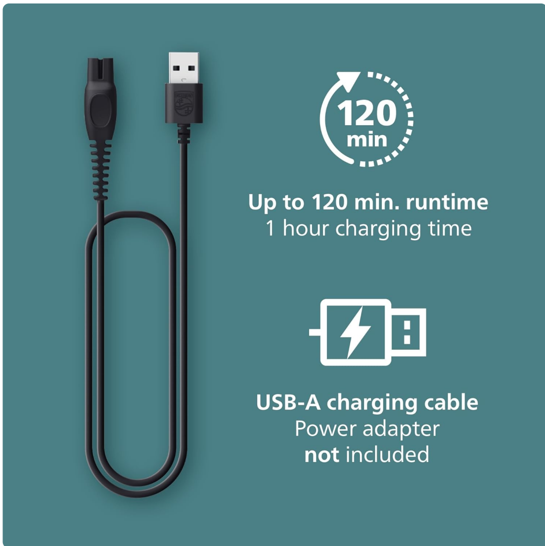
Image: The USB-A charging cable and visual indicators for the device's 120-minute runtime and 1-hour charging time.