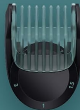
Adjustable precision comb 1-3 mm