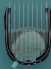
Adjustable comb 3-7 mm