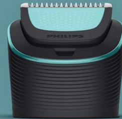
Image: The main body groomer unit alongside its interchangeable trimmer and shaver heads.

Interchangeable shaver and trimmer blades for optimal skin comfort