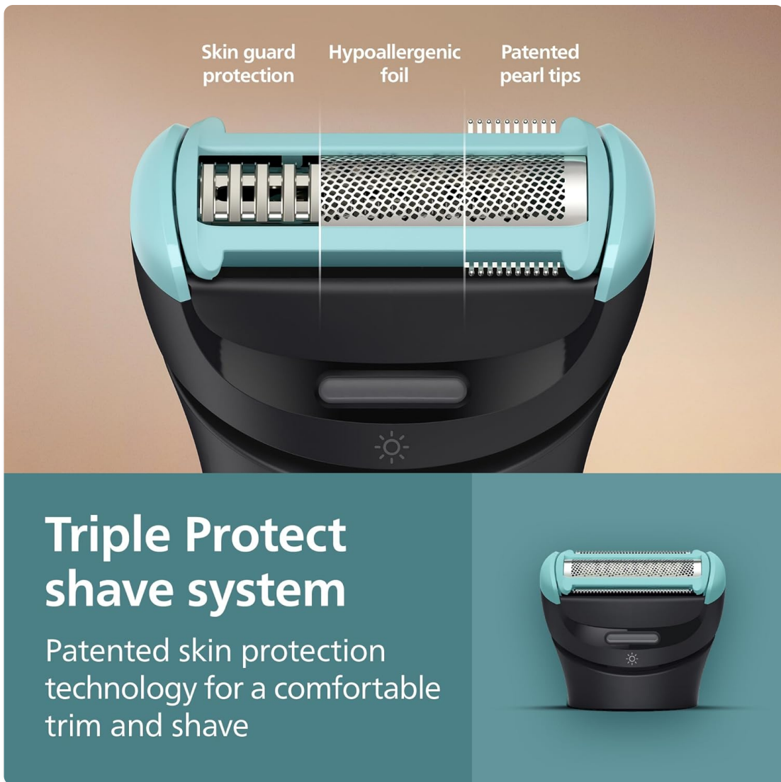
Image: Detailed view of the Triple Protect shave system, illustrating its components for skin safety.