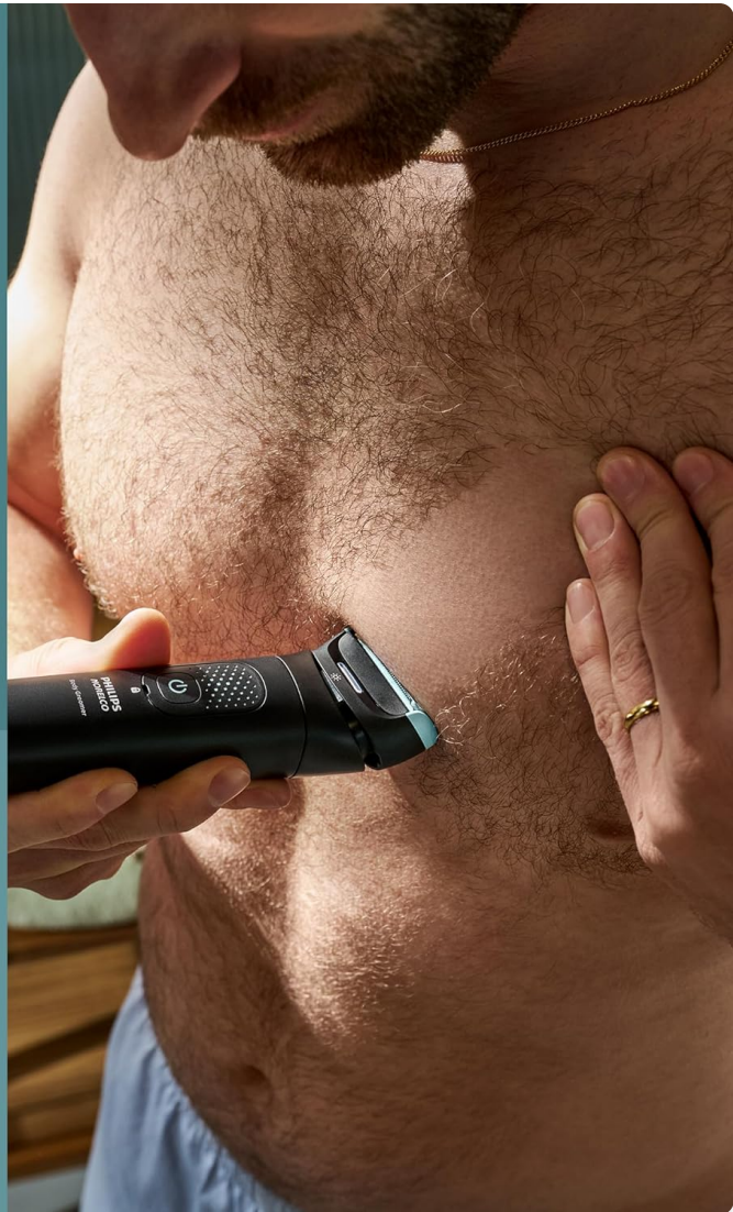
Image: The 2D flexing head with Optilight in action, showing how it illuminates the grooming area.