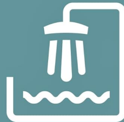
Image: The body groomer shown with water droplets, emphasizing its 100% showerproof capability.

Comfortable and convenient grooming, wet or dry