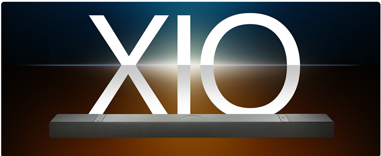
Image: The KEF XIO Soundbar, showcasing its sleek design and the XIO branding.

The KEF XIO Dolby Atmos 5.1.2 Soundbar is engineered to deliver a truly cinematic audio experience with its full 5.1.2 speaker configuration and 12 discreet amplifiers. This manual provides essential information for setting up, operating, and maintaining your KEF XIO Soundbar to ensure optimal performance and longevity.