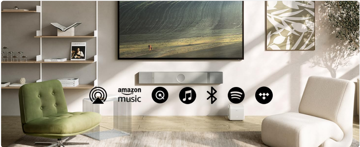
Image: The KEF XIO Soundbar displayed with icons representing its support for Google Cast, Amazon Music, Qobuz, Apple Music, Bluetooth, Spotify, and Tidal.

The KEF XIO is engineered for seamless connectivity and easy streaming, supporting a wide range of wireless technologies and services.