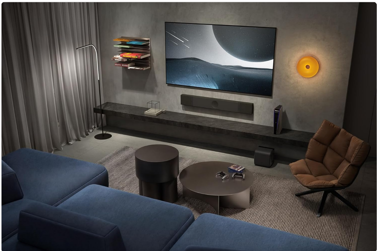
Image: The KEF XIO Soundbar wall-mounted below a large screen in a dedicated gaming or entertainment area.