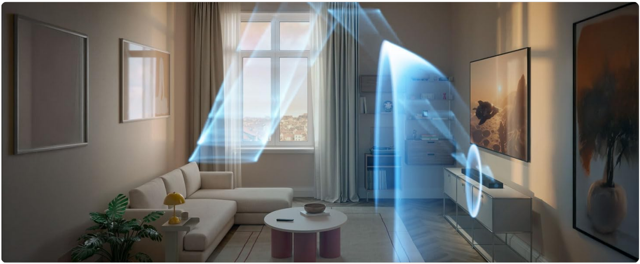
Image: An artistic representation of sound waves emanating from the KEF XIO Soundbar, illustrating immersive audio filling a living space.