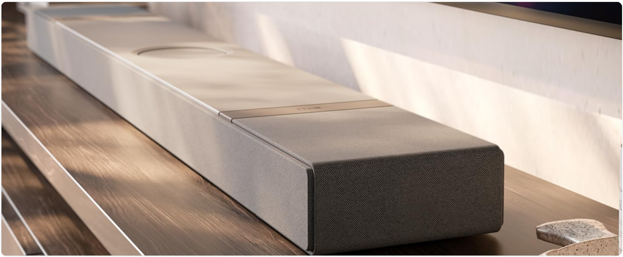
Image: A detailed view of the KEF XIO Soundbar resting on a credenza, highlighting its sleek profile.