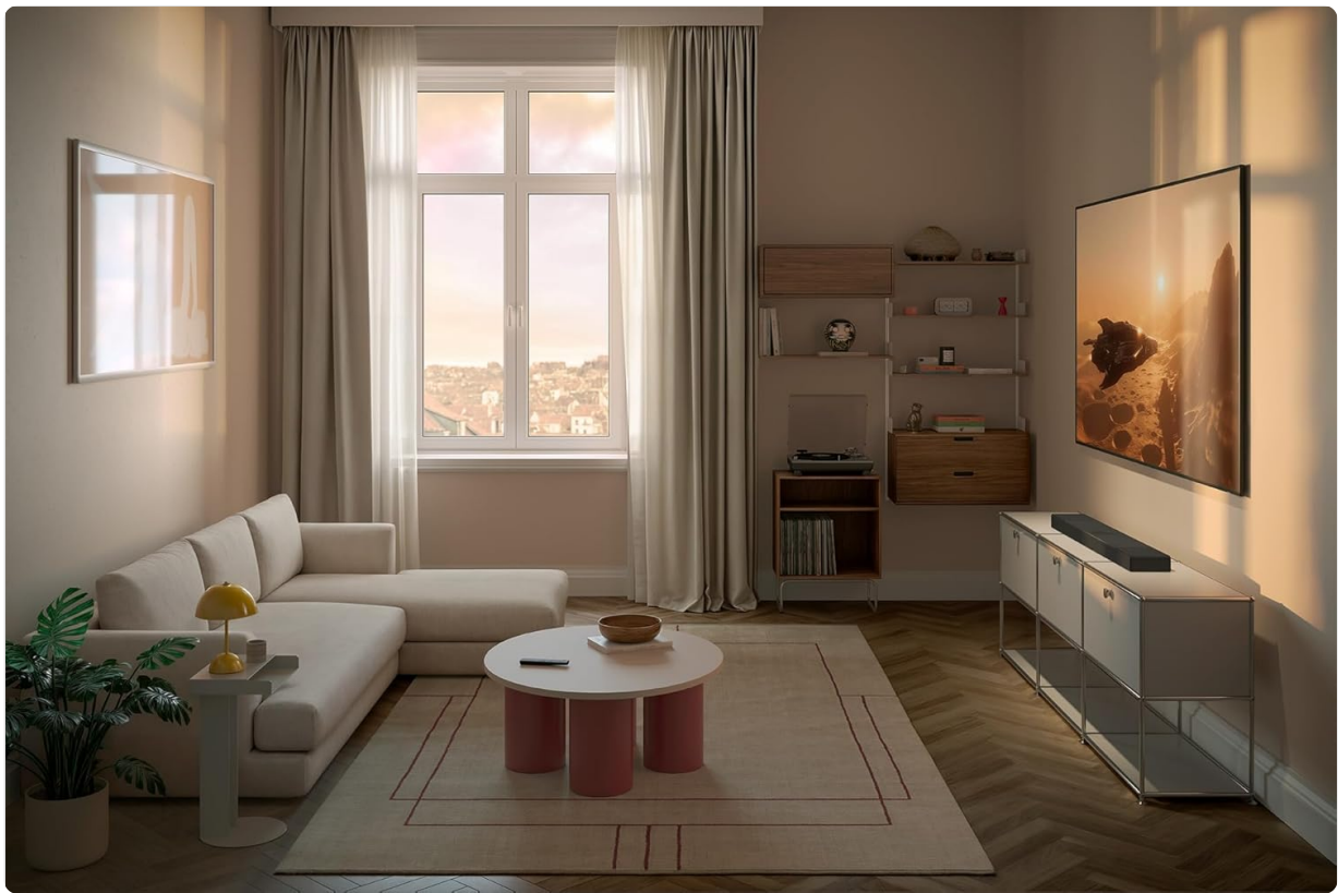
Image: The KEF XIO Soundbar positioned on a credenza beneath a television in a modern living room setting.