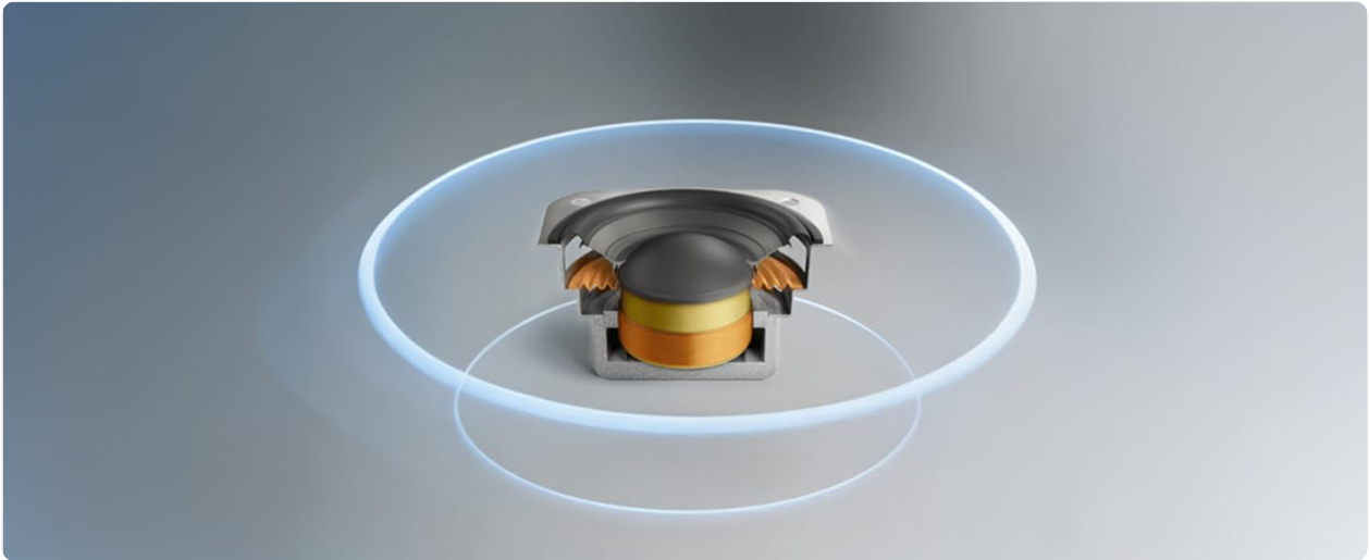
Image: A detailed view of one of the internal speaker drivers, showcasing its design and construction.