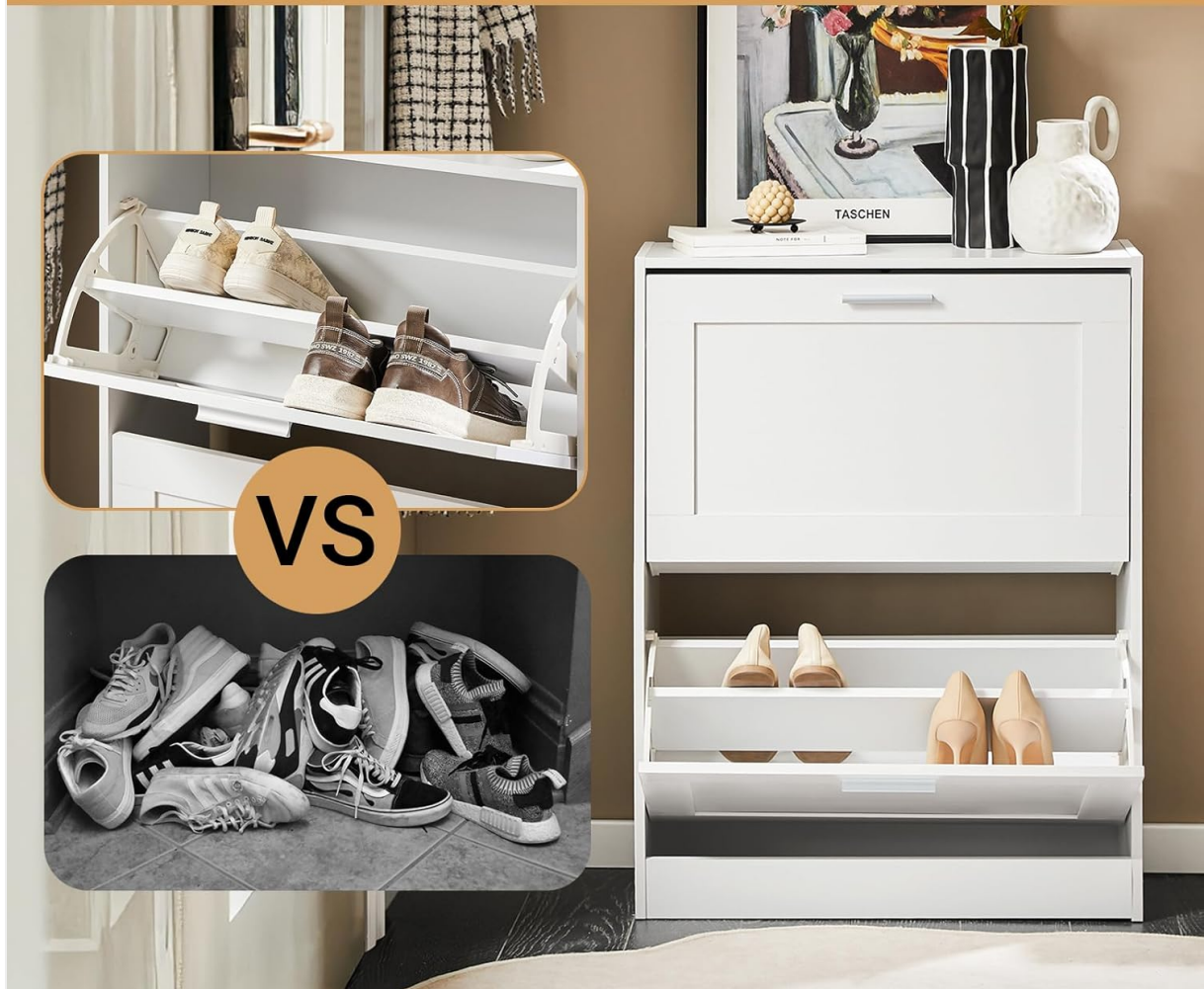
Image: The SoBuy FSR137-W Slim Shoe Storage Cabinet, a white unit with two flip-down drawers, positioned in an entryway next to a window and radiator, with a decorative vase and book on top.