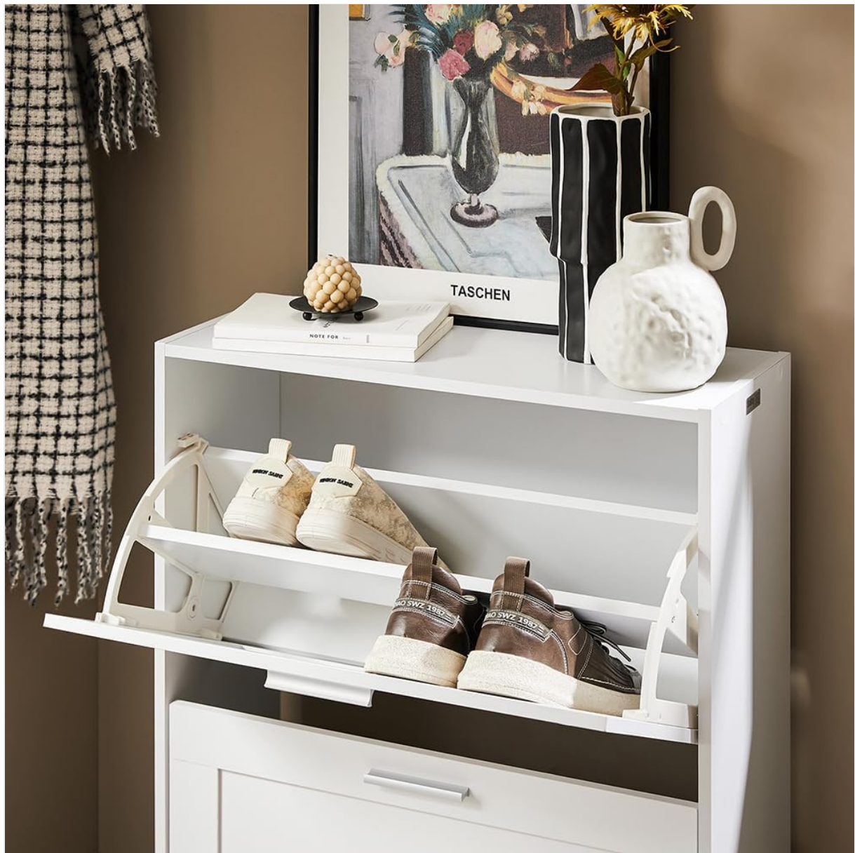
Image: The SoBuy FSR137-W shoe cabinet with its top flip-down drawer open, showcasing two pairs of shoes stored neatly on the internal shelves. The cabinet is positioned in an entryway with decor on top.