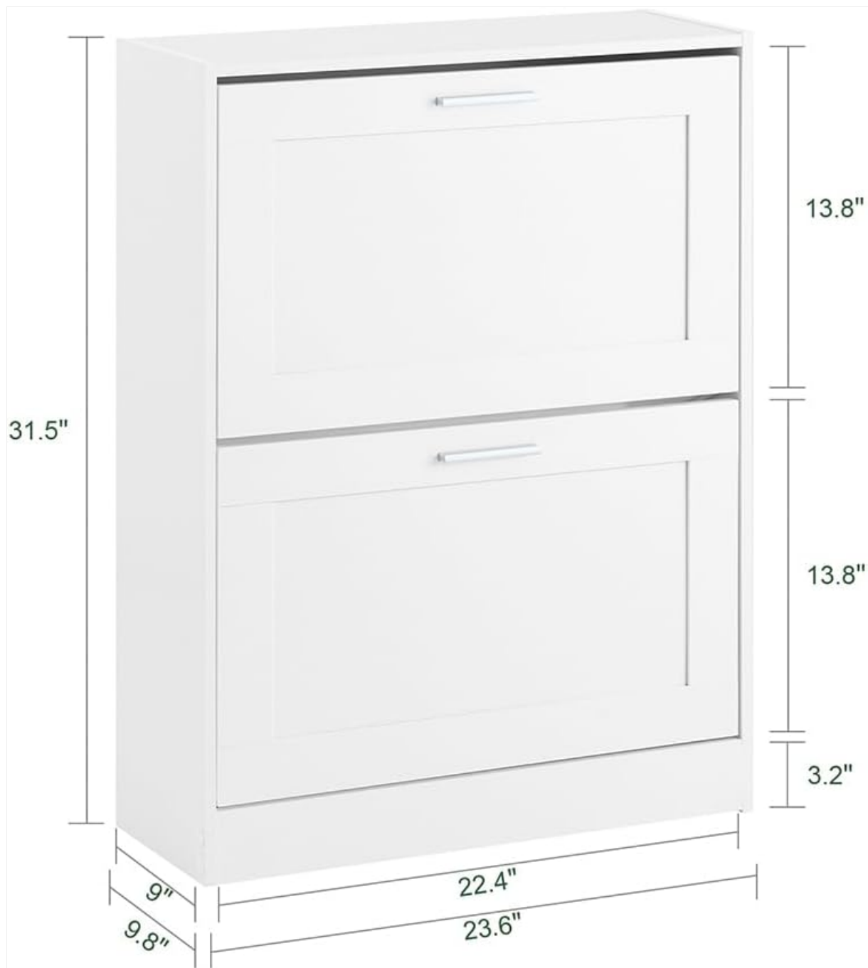
Image: A detailed diagram illustrating the dimensions of the SoBuy FSR137-W shoe cabinet, including its height (31.5"), width (23.6"), and depth (9.8"), along with individual drawer heights.