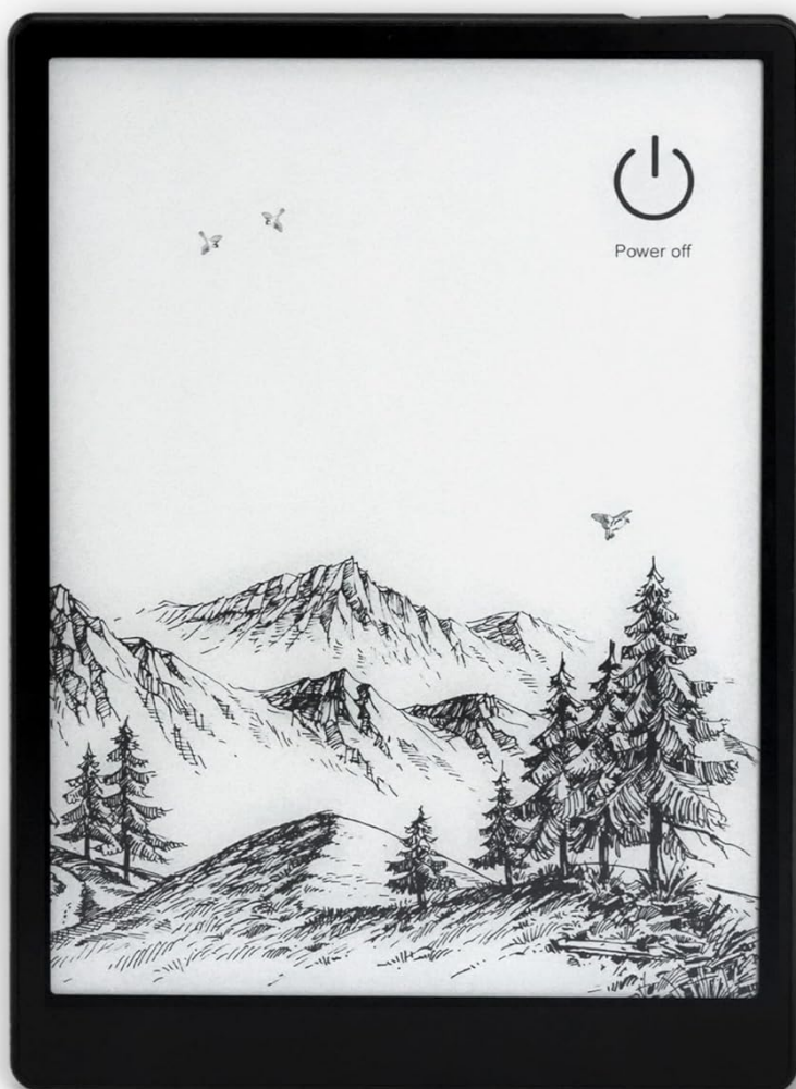
Image: A close-up of the Veidoo E8's 8.2-inch E-Ink display, highlighting its 1440x1920 resolution and paper-like quality.