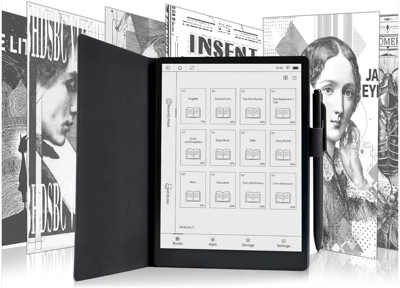
Image: The Veidoo E8 E-Book Reader's interface showing a library of books, emphasizing its 4GB RAM and 64GB ROM for extensive storage.