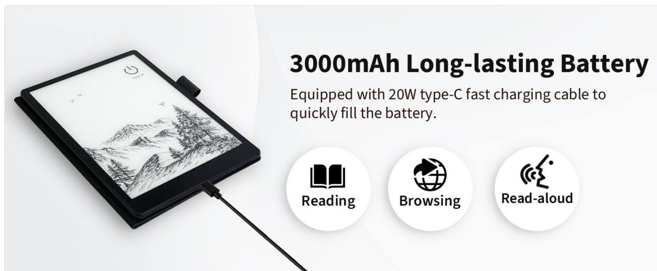
Image: The Veidoo E8 E-Book Reader being charged via a USB-C cable, illustrating its long-lasting battery and fast charging capability.

Before first use, fully charge your E-Book Reader. Connect the provided USB-C cable to the device's USB-C port and the other end to the Type-C adapter, then plug into a power outlet. The 3000mAh battery provides weeks of reading on a single charge.