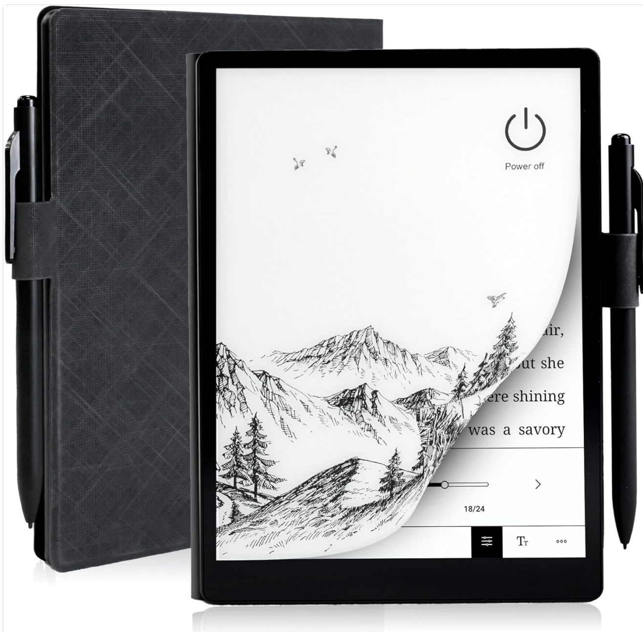
Image: The Veidoo E8 E-Book Reader, shown with its protective cover and stylus. The device features an E-Ink screen displaying text and a power button icon.