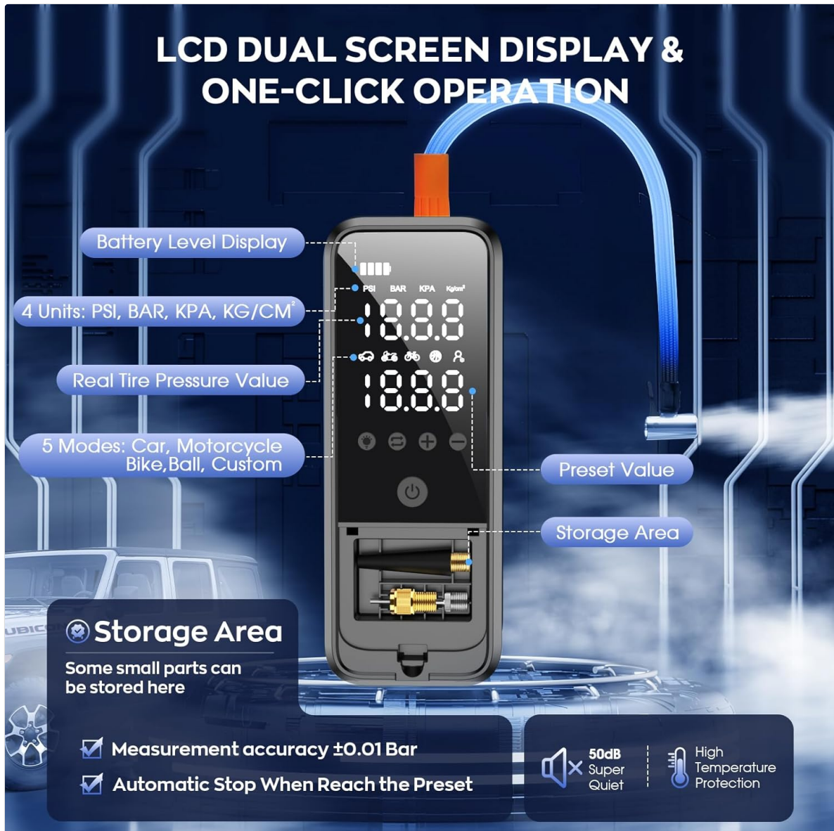
Figure 3.1: Front view of the inflator showing the LCD dual screen display and control buttons. Key features include battery level display, pressure unit display (PSI, BAR, KPA, KG/CM 2 ), real-time tire pressure value, 5 inflation modes (Car, Motorcycle, Bike, Ball, Custom), preset pressure value, and a storage area for nozzles.

Familiarize yourself with the components of your KZKB Portable Tire Inflator.