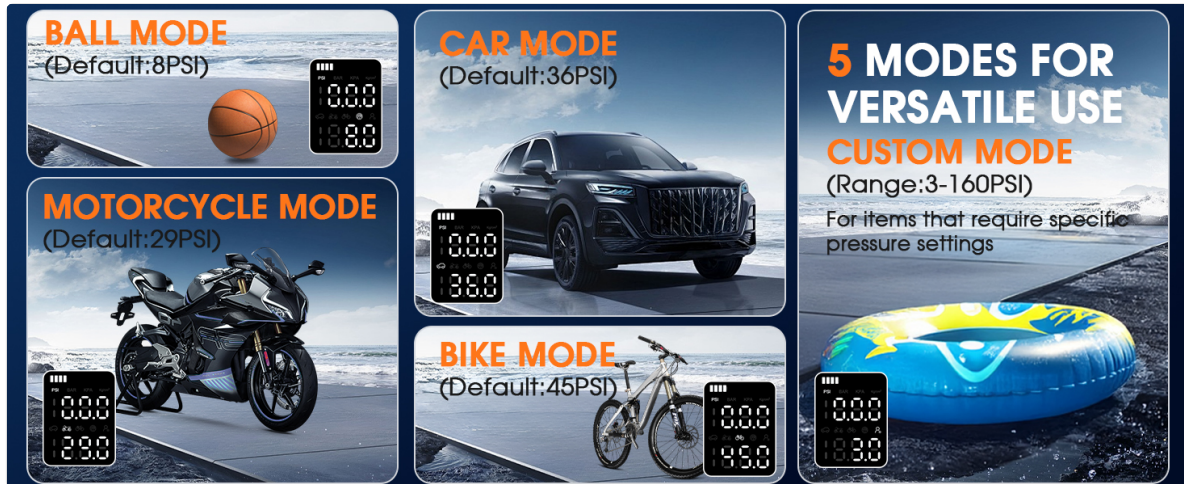
Figure 5.1: Overview of the 5 versatile inflation modes available on the KZKB Portable Tire Inflator, including default pressure settings for Ball (8 PSI), Motorcycle (29 PSI), Car (36 PSI), Bike (45 PSI), and a Custom mode (3-160 PSI) for specific pressure requirements.