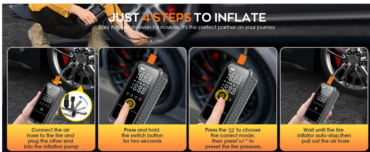
Figure 5.2: A visual guide demonstrating the four simple steps for inflating tires with the KZKB Portable Tire Inflator. This includes connecting the air hose to the tire and pump, pressing the power button, selecting the appropriate mode and adjusting the target pressure, and finally, waiting for the automatic shut-off before disconnecting.