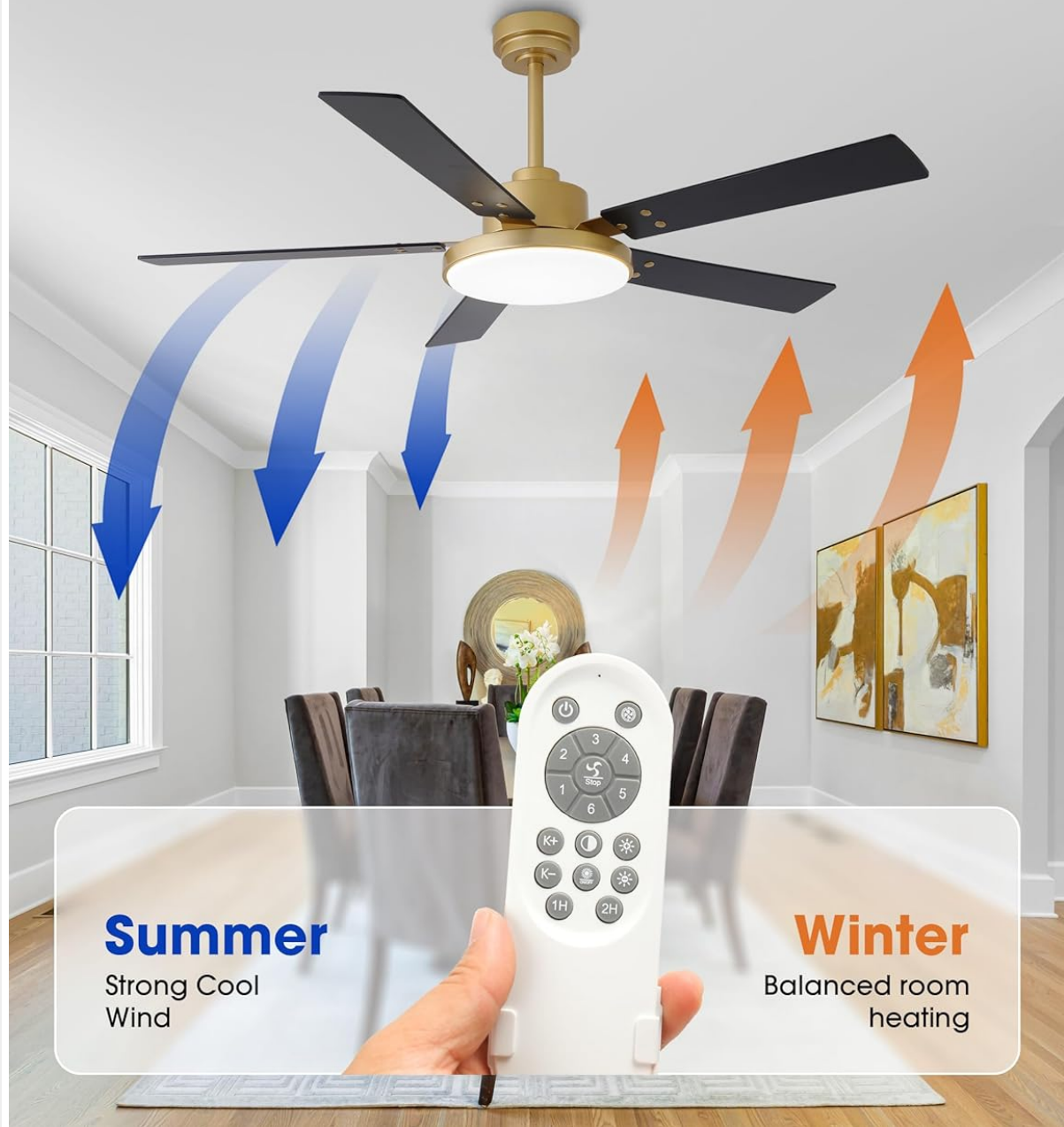
Figure 4.2: The reversible DC motor allows for seasonal air circulation: downward airflow for cooling in summer and upward airflow for heat distribution in winter.