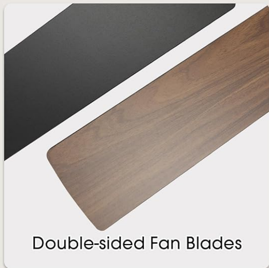
Double-sided Fan Blades