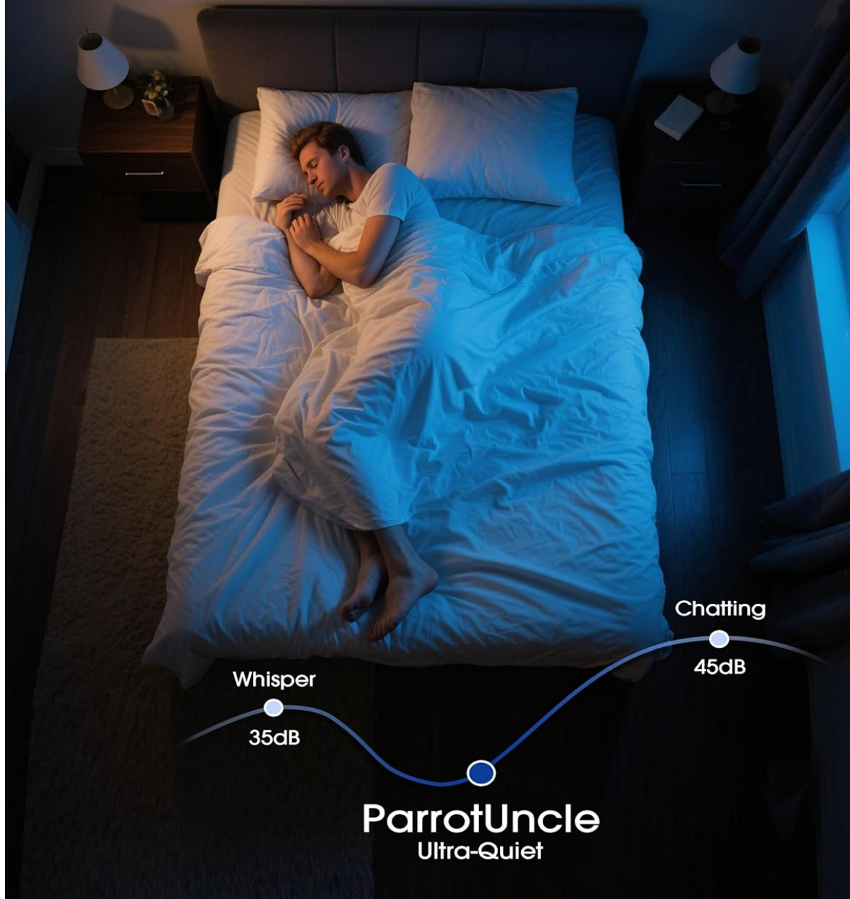
Figure 7.3: Enjoy ultra-quiet operation, ensuring a comfortable rest with noise levels as low as 35dB.