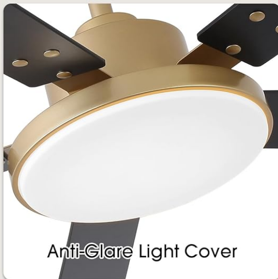
Anti-Glare Light Cover