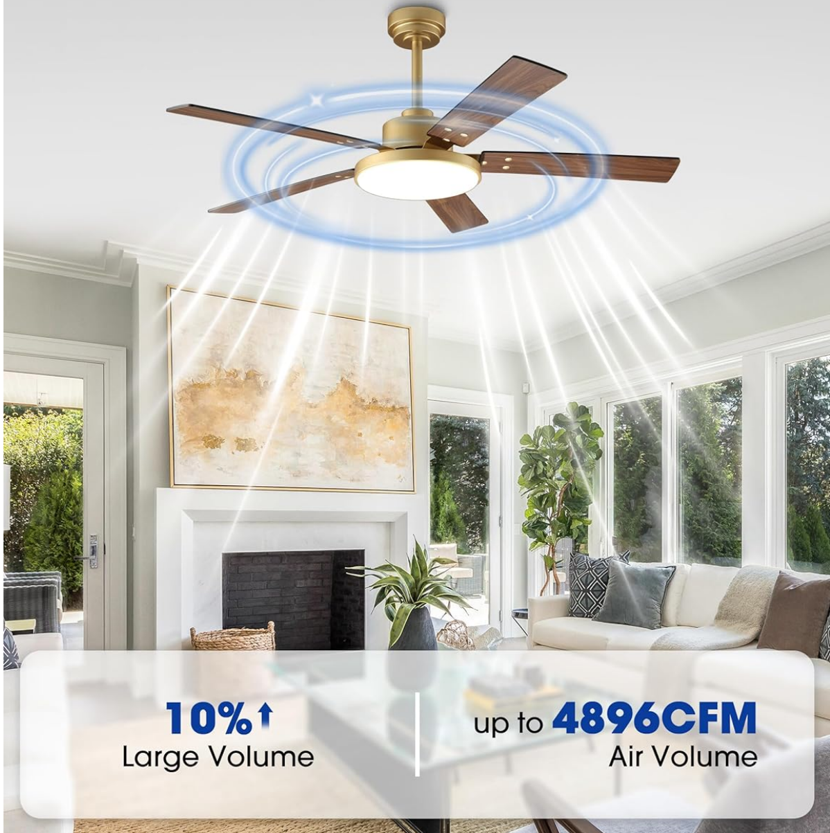
Figure 7.1: The fan features high efficiency and low energy consumption, providing up to 4896 CFM air volume.