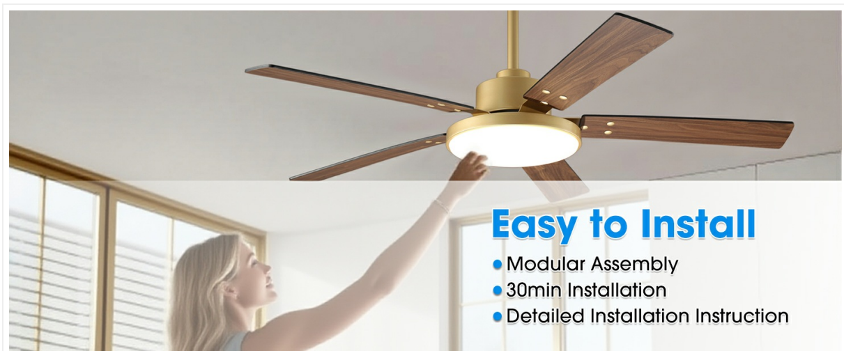
Figure 3.1: The fan is designed for easy installation with modular assembly.

Your browser does not support the video tag.