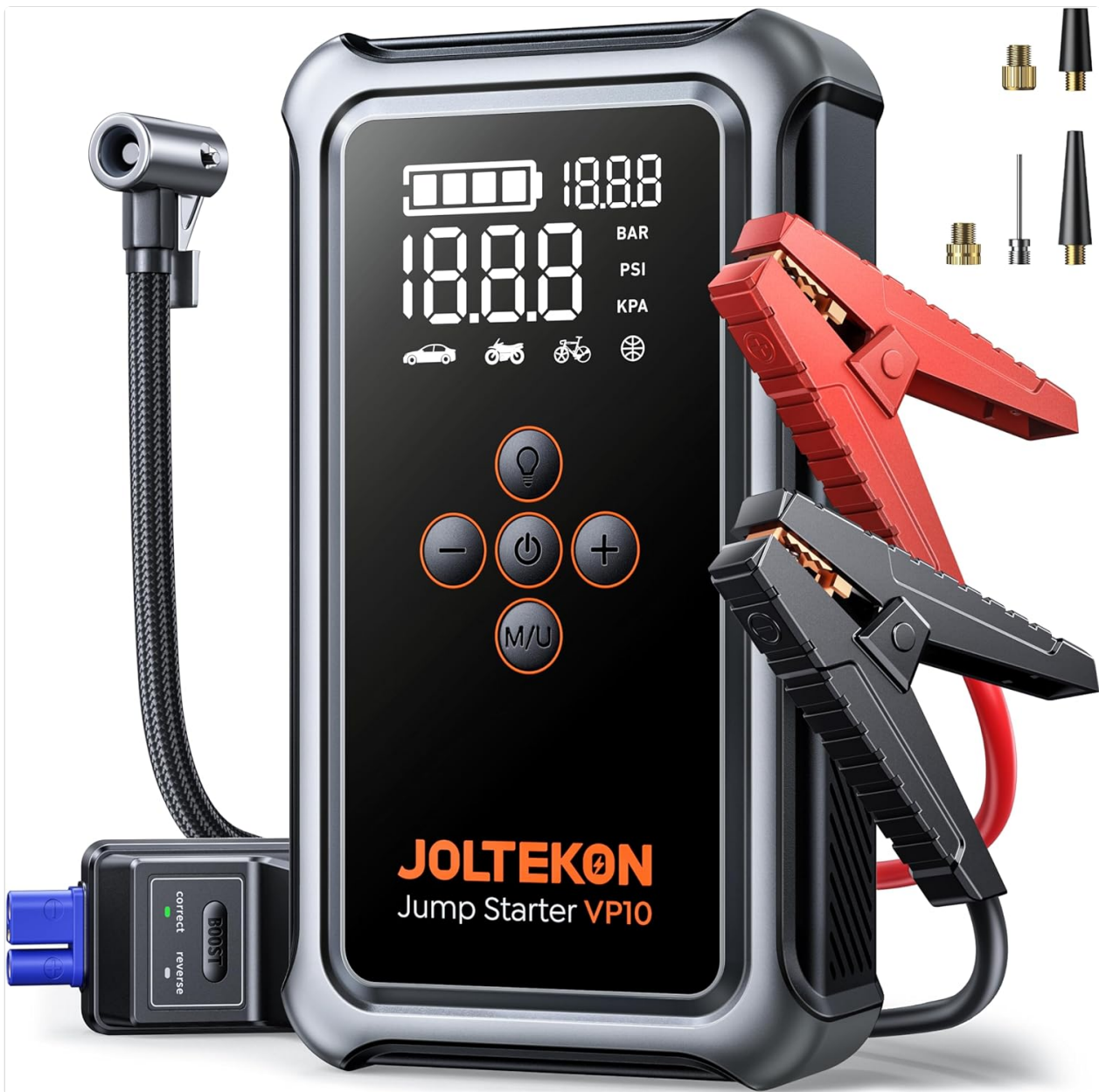
Image 1: The Joltekon VP10 Jump Starter with Air Compressor and included accessories.