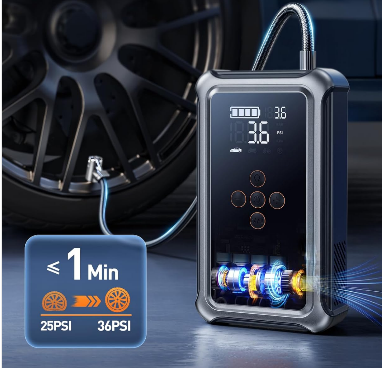
Image 4: The Joltekon VP10 actively inflating a car tire, with the digital display showing pressure readings.