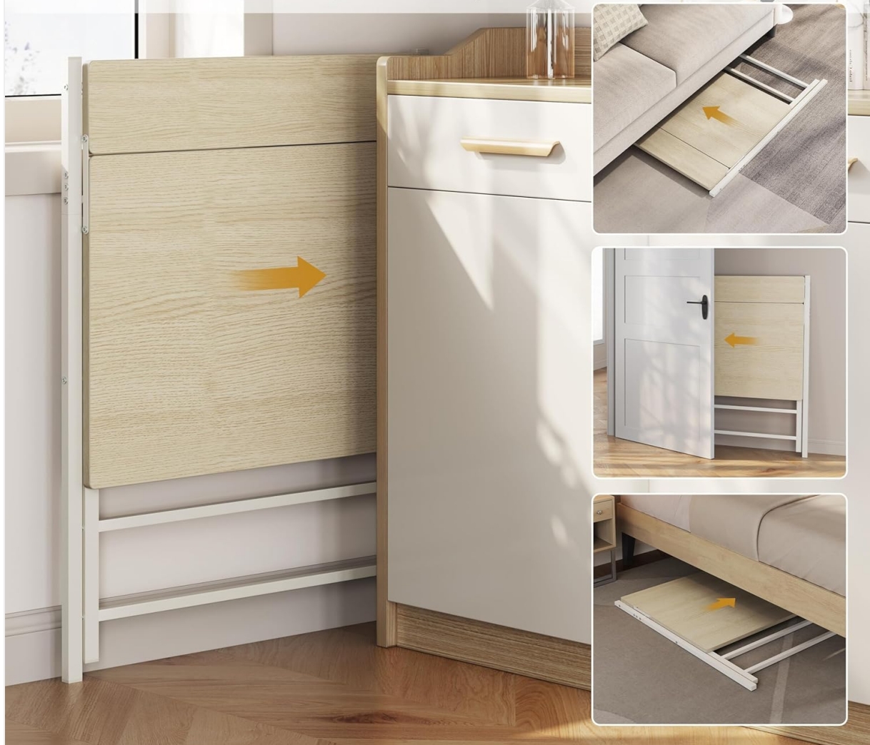
Figure 5.1: Space-Saving Storage. This image illustrates how the folded desk can be conveniently stored in various compact locations, such as behind a door, under a bed, or beside a sofa.

Folds easily to fit behind doors, under beds or sofas, or any other compact space