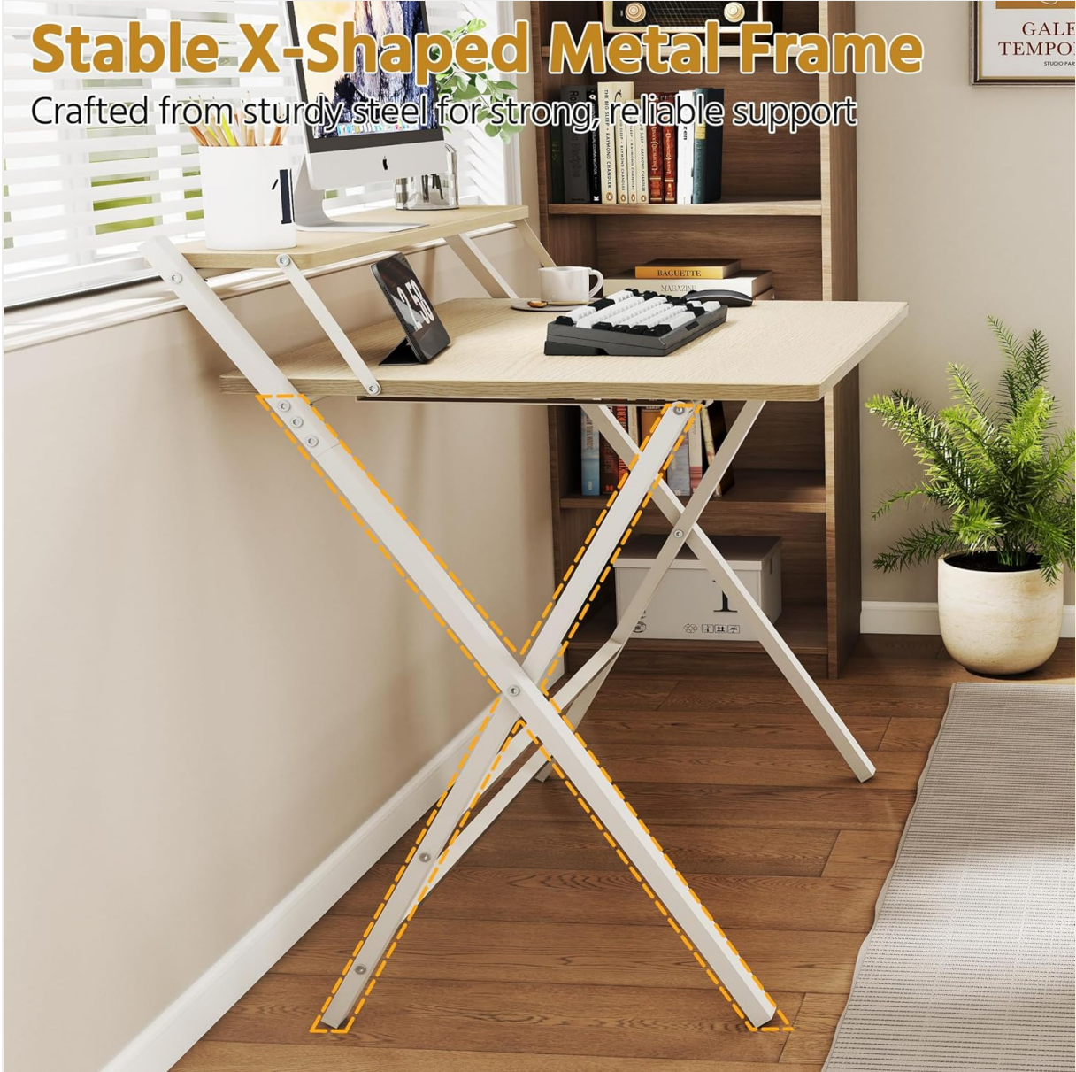
Figure 2.3: Stable X-Shaped Metal Frame. A detailed view of the desk's robust X-shaped metal frame, designed for strong and reliable support.