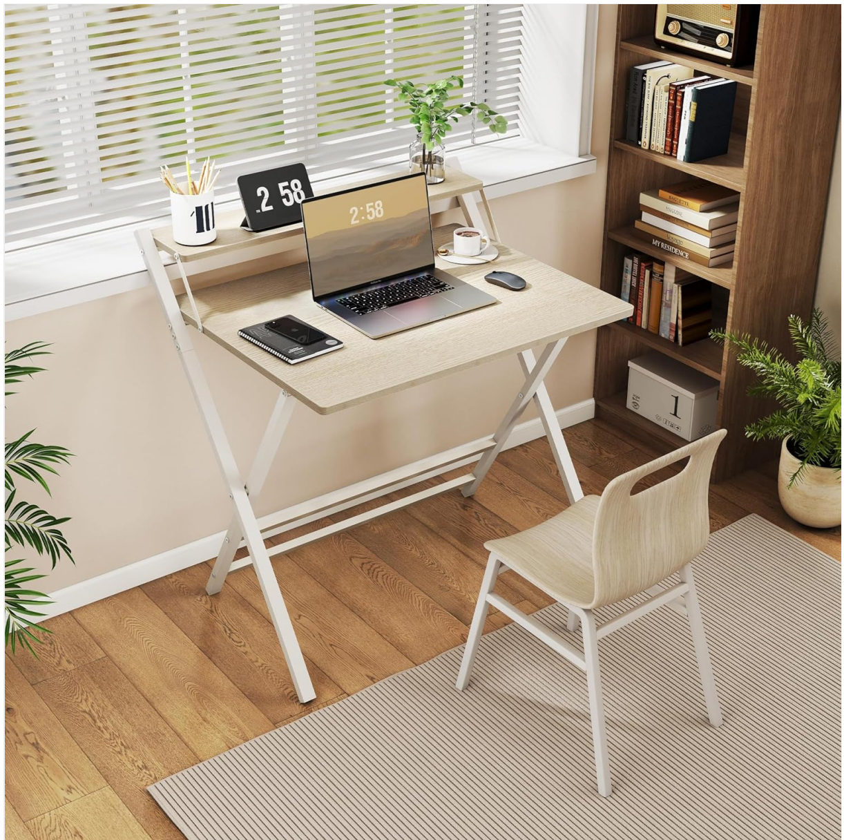
Figure 2.1: Product in Use. The Yaheetech folding computer desk set up in a home office, showcasing its monitor shelf and compact design.