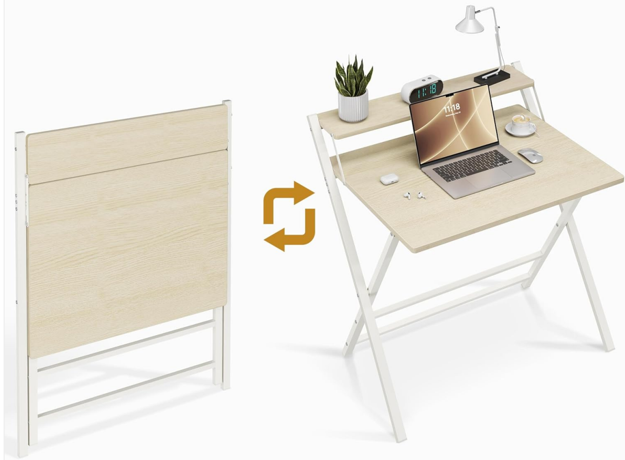
Figure 4.1: Unfolding the Desk. This image demonstrates the simple process of unfolding the desk from its compact storage position to its ready-to-use state.

Simply fold and store away when not in use