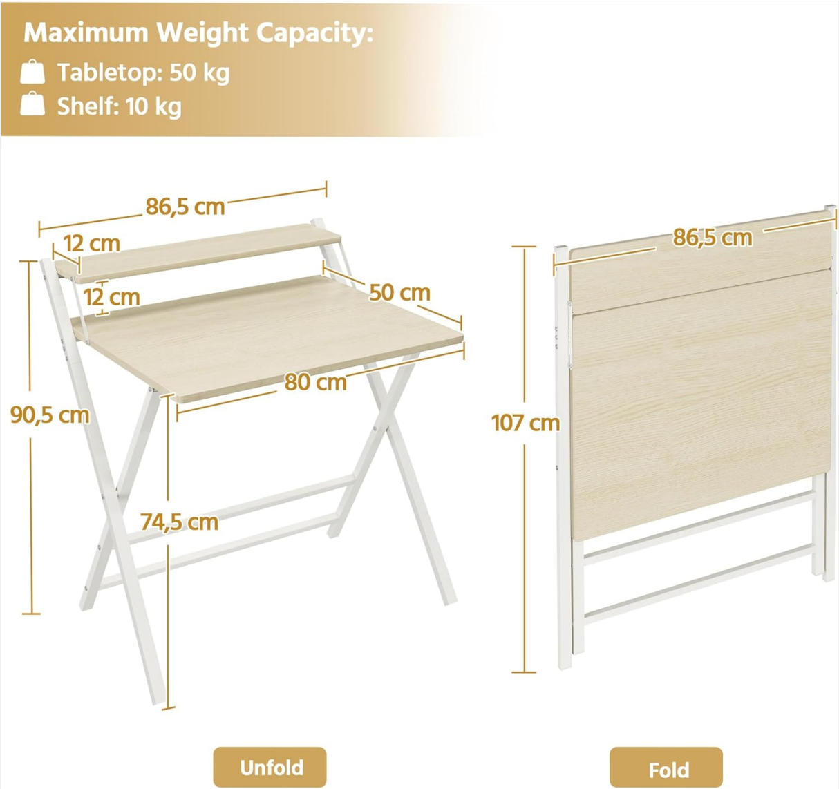
Figure 3.1: Desk Dimensions and Capacities. This image provides detailed measurements for both the unfolded and folded states of the desk, along with maximum weight capacities for the tabletop and monitor shelf.