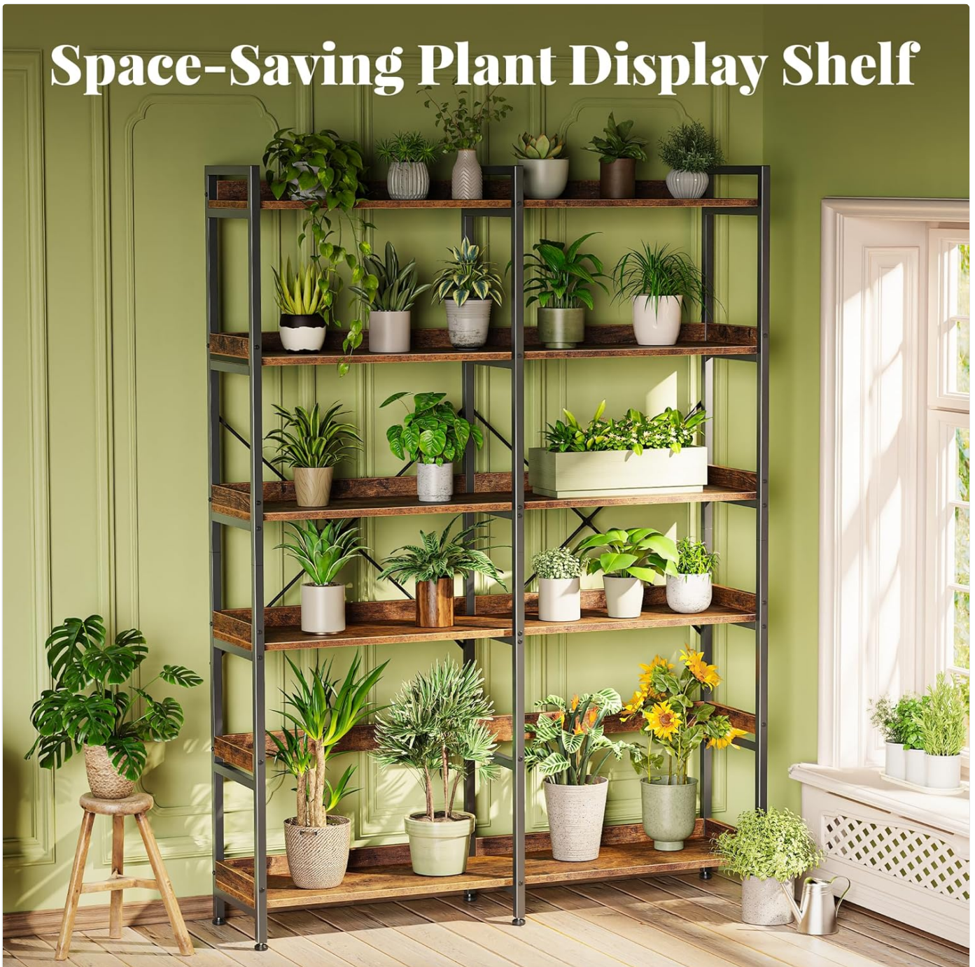
Figure 4.3: The bookshelf utilized as a plant display shelf.