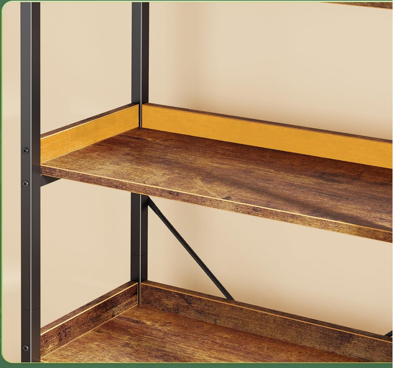
Figure 7.3: Detail of the raised baffle feature on the shelves.