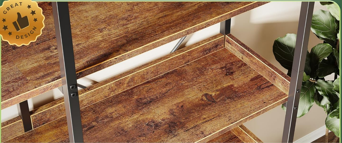
Quality Wooden Board