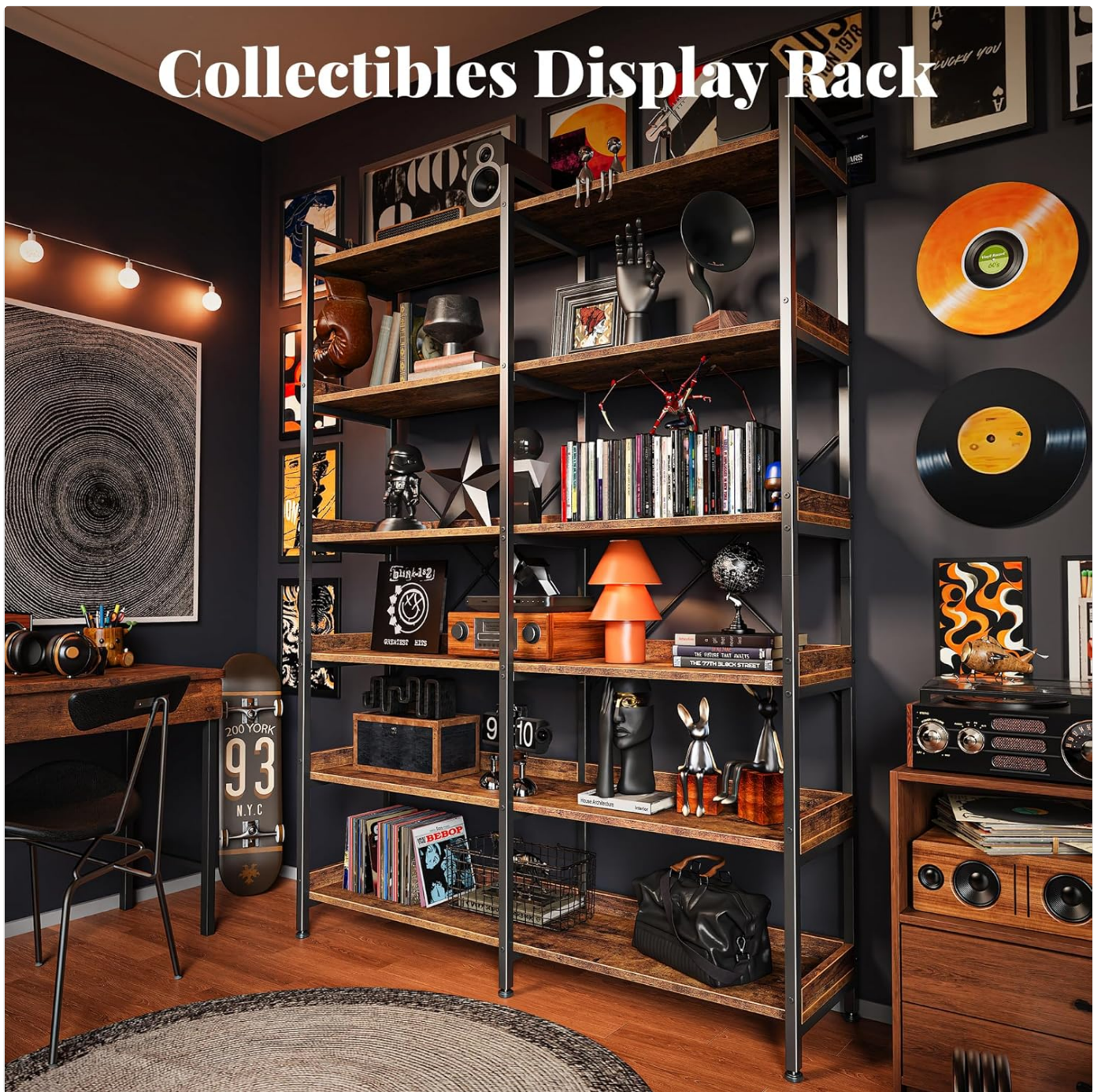
Figure 4.2: The bookshelf serving as a display rack for collectibles.