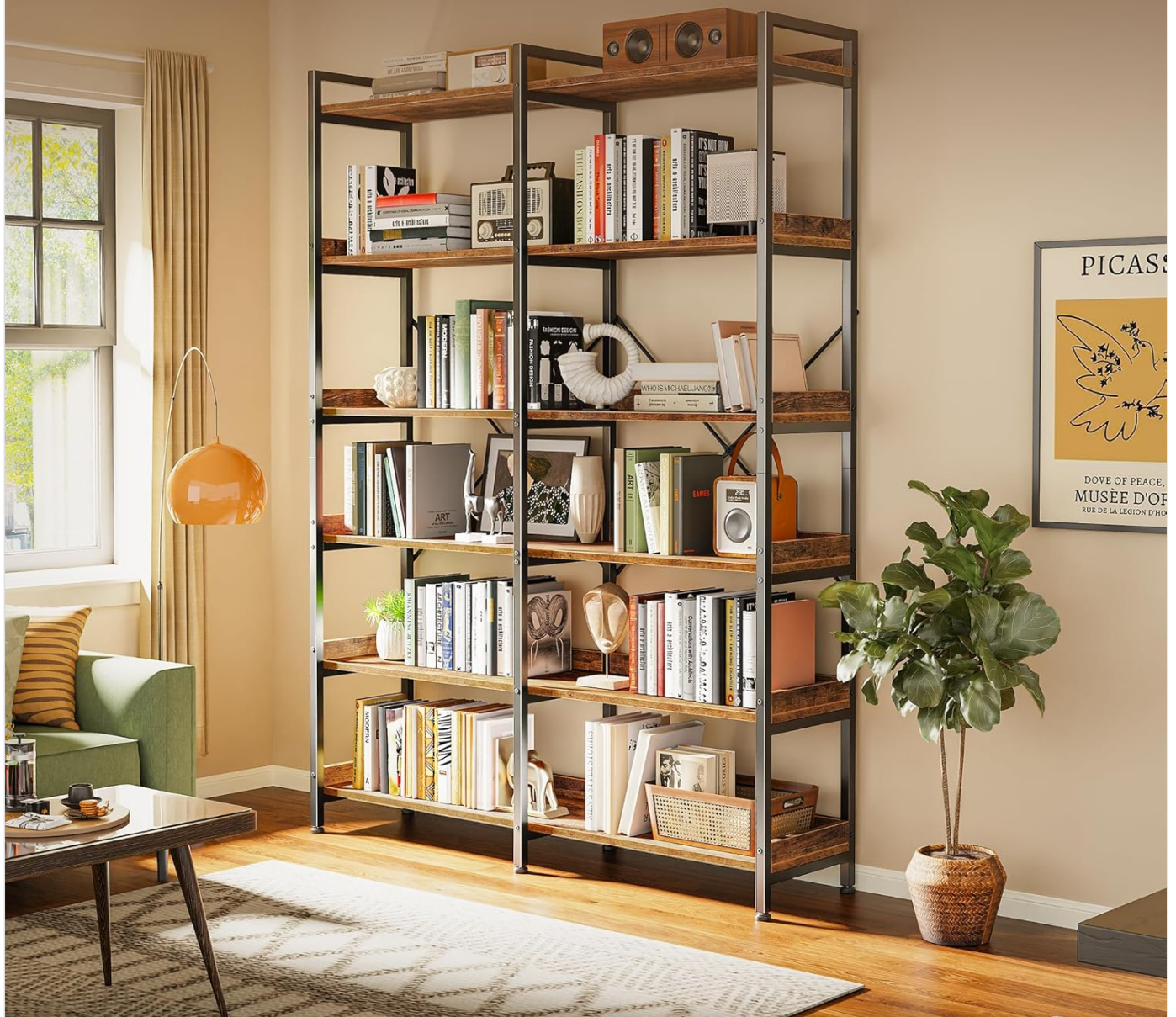
Figure 4.1: The bookshelf configured as a long, straight shelf in a living room setting.