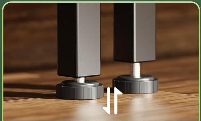
Adjustable Feet Pad