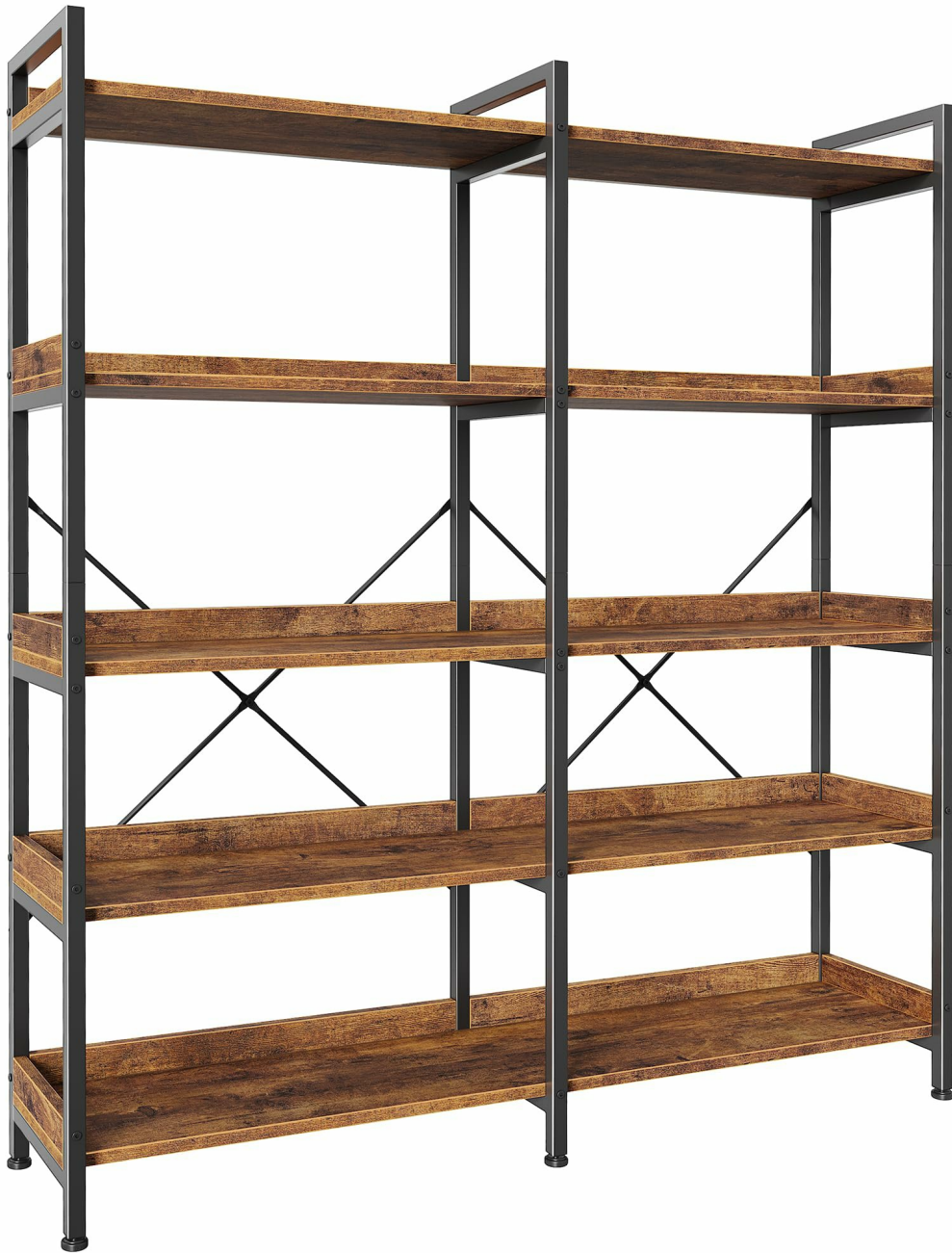
Image: Fully assembled Huuger 5 Tier Bookshelf, showcasing its rustic brown finish and open shelf design.