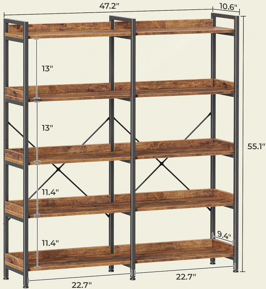
Image: Diagram illustrating the precise dimensions of the bookshelf.