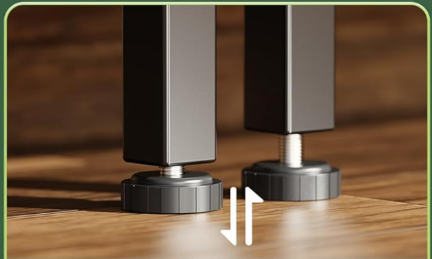
Adjustable Feet Pad

Image: Features such as the X-shape crossbar and adjustable feet pads for enhanced stability.