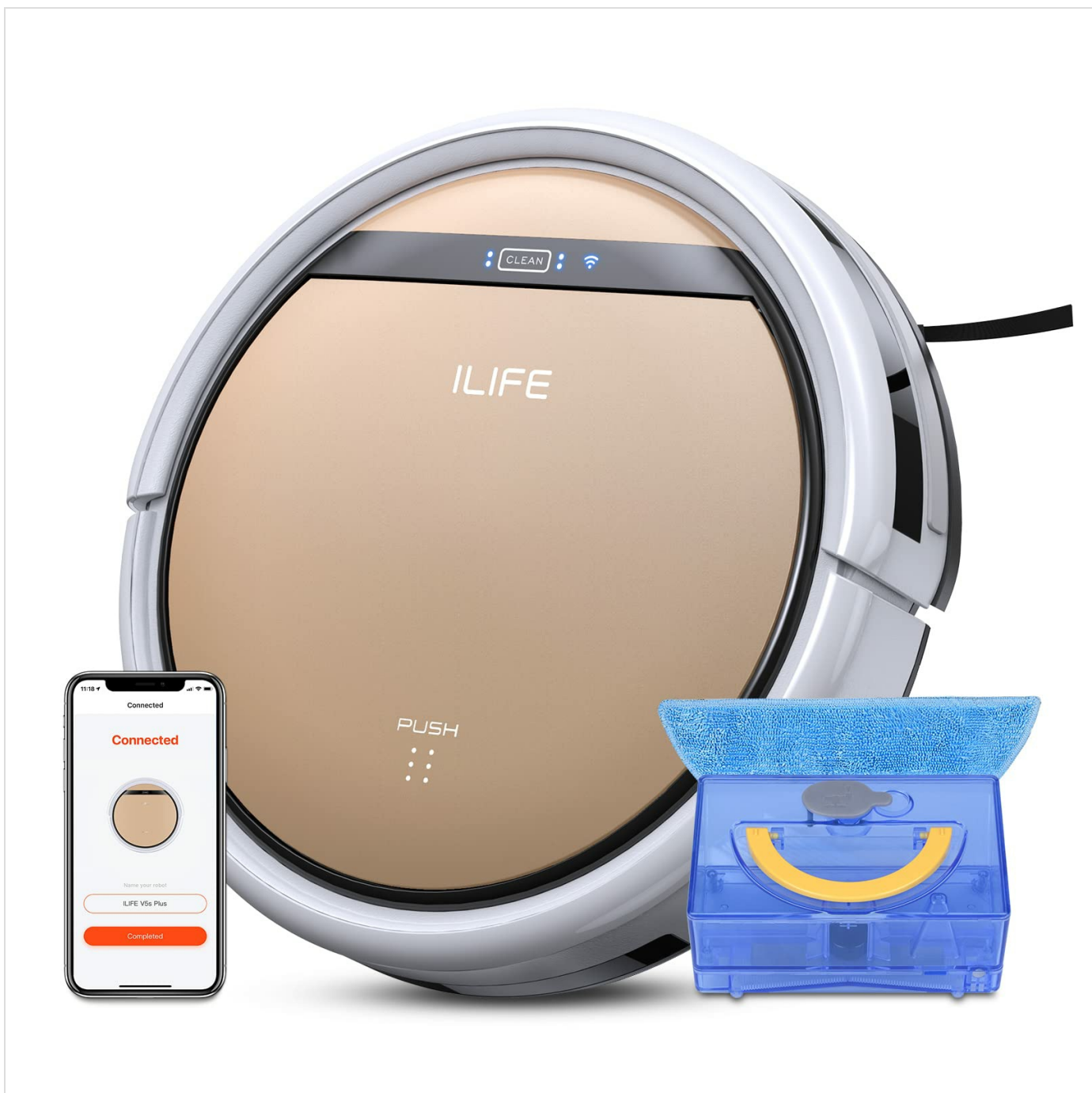
The ILIFE V5s Plus Robot Vacuum and Mop, ready for use.