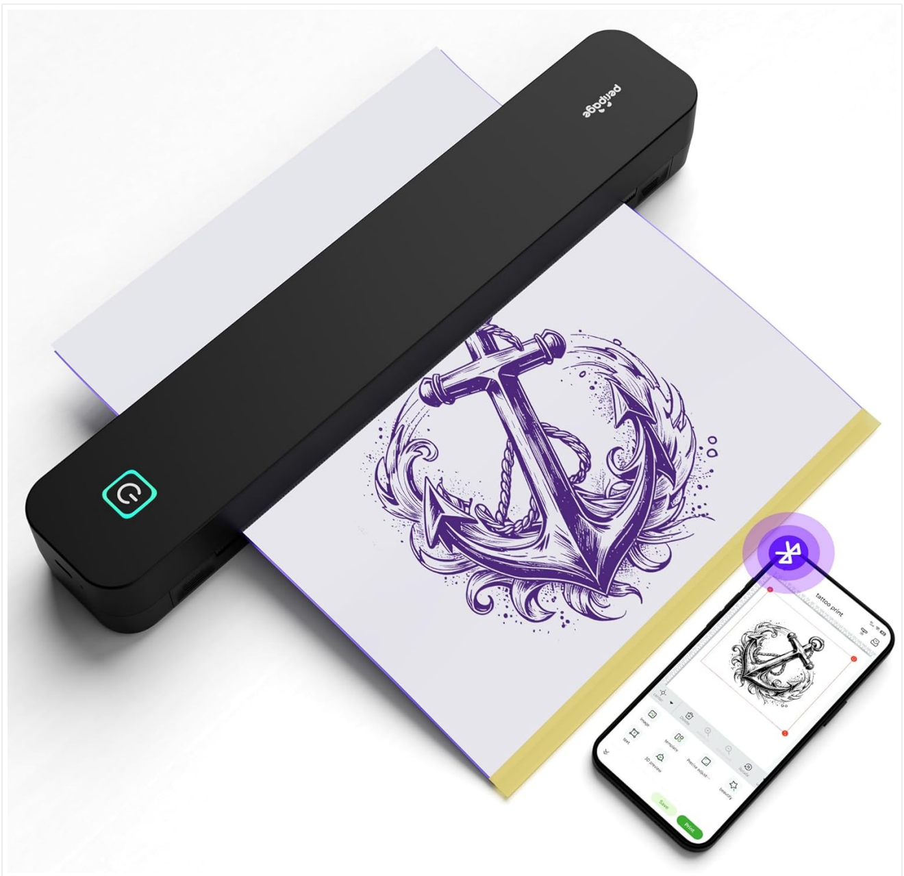
Image: The PeriPage P92 printer actively printing a tattoo stencil design onto thermal paper, with a smartphone displaying the design.