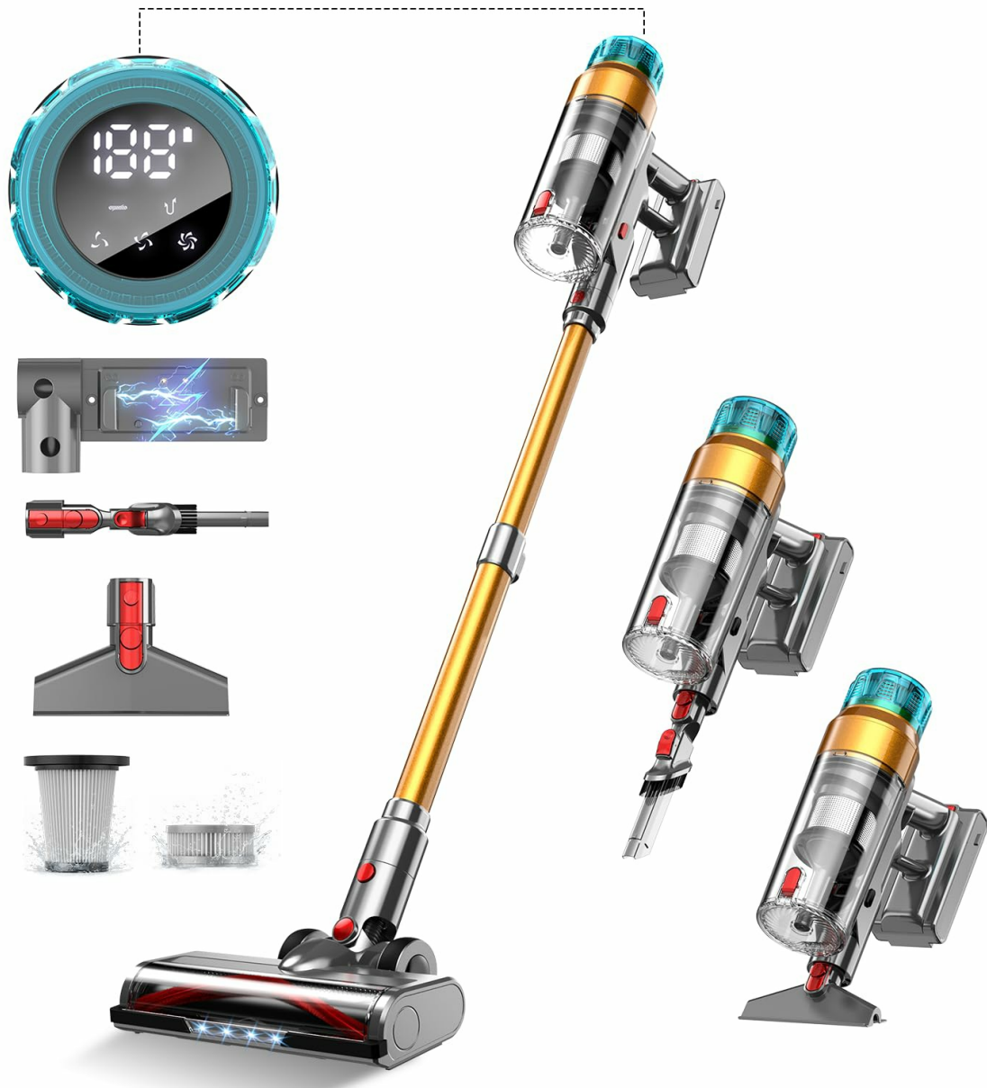
Image: The MBYULO Cordless Vacuum Cleaner highlighting its 600W upgraded motor and 60Kpa super suction power.