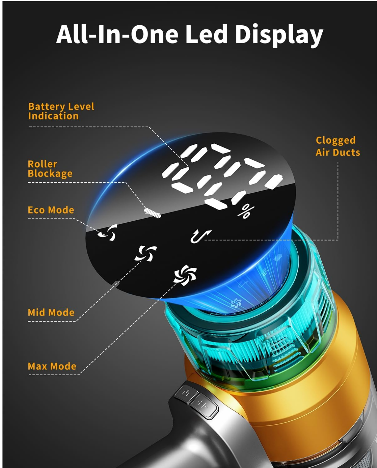
Image: Close-up of the MBYULO Cordless Vacuum Cleaner's LED display, indicating battery level, roller blockage, Eco, Mid, and Max modes, and clogged air ducts.