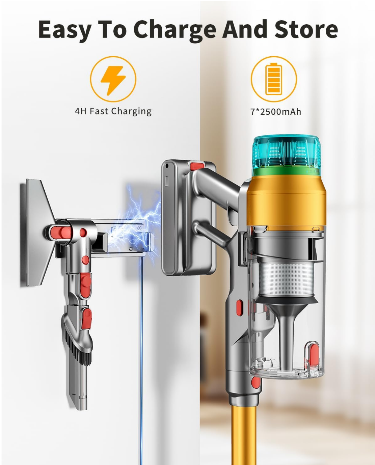
Image: The MBYULO Cordless Vacuum Cleaner being charged and stored on its wall-mounted bracket.