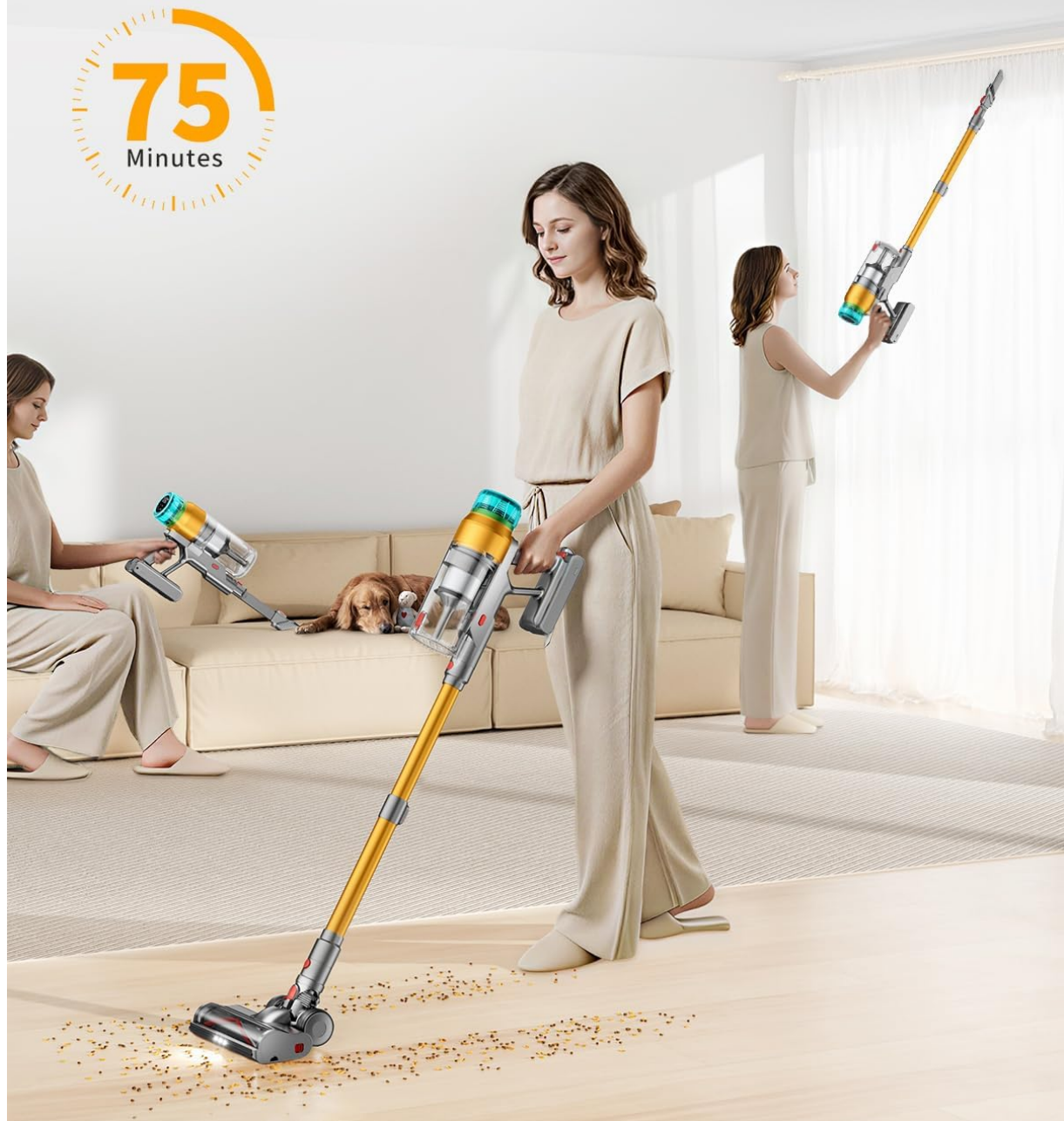
Image: A woman using the MBYULO Cordless Vacuum Cleaner, illustrating its 75-minute runtime for whole-house cleaning.