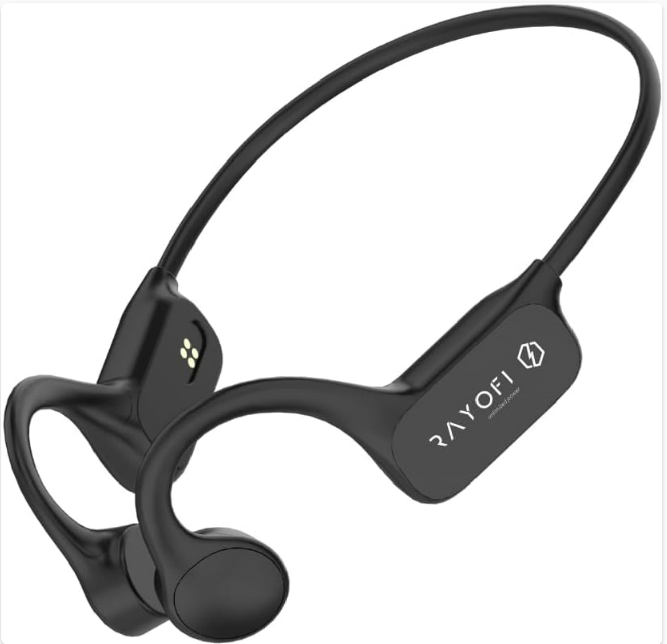
Image: Rayofi FREESWIM W26 Bone Conduction Headphones, front view.