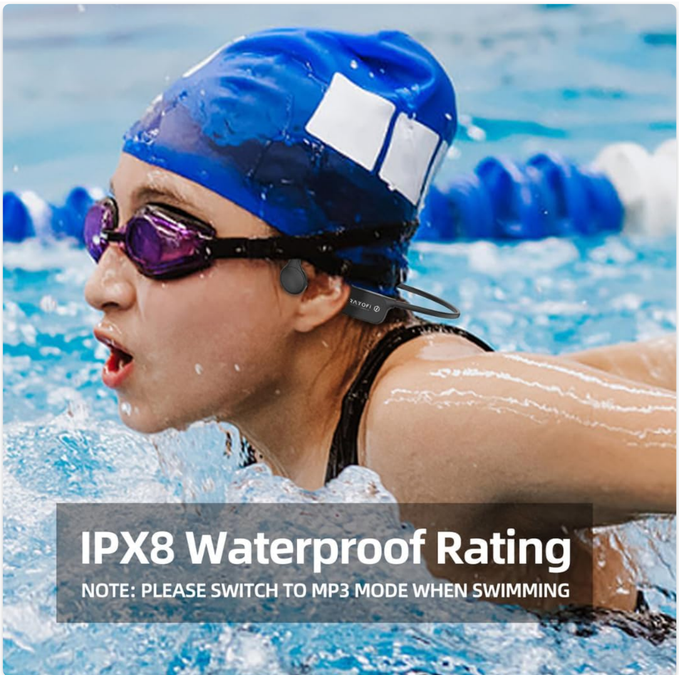
Image: A person swimming while wearing Rayofi FREESWIM W26 headphones, with a clear note: "IPX8 Waterproof Rating. NOTE: PLEASE SWITCH TO MP3 MODE WHEN SWIMMING."