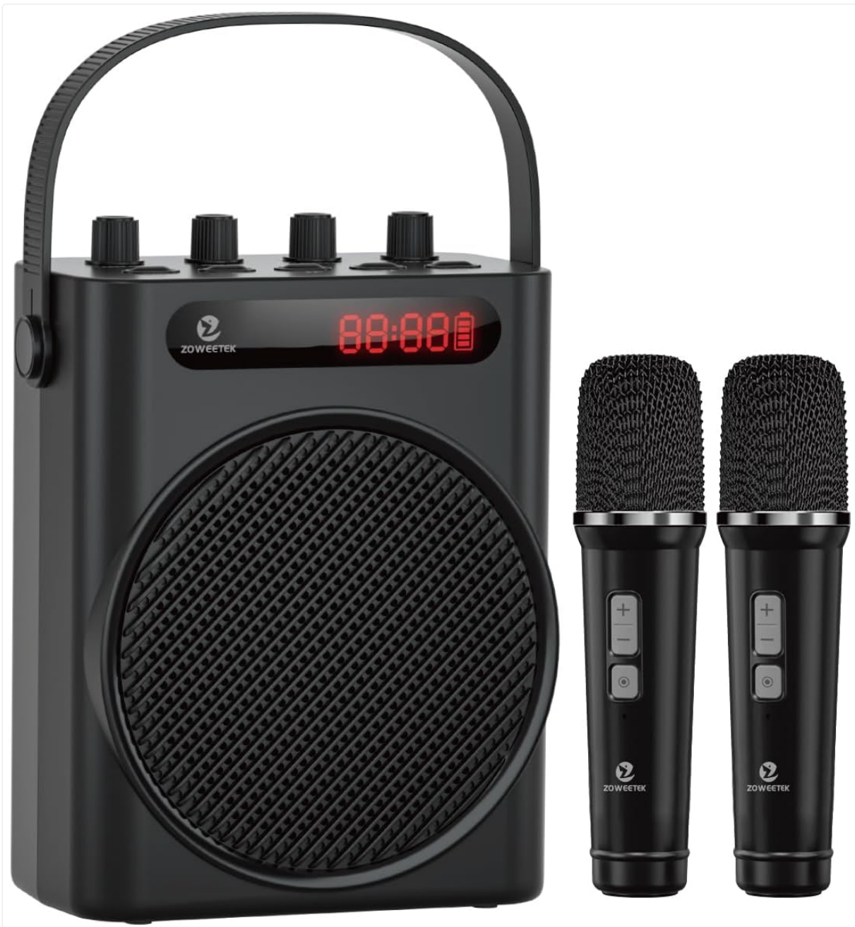
Image: The ZOWEETEK S4PLUS Portable Voice Amplifier unit with two wireless handheld microphones.