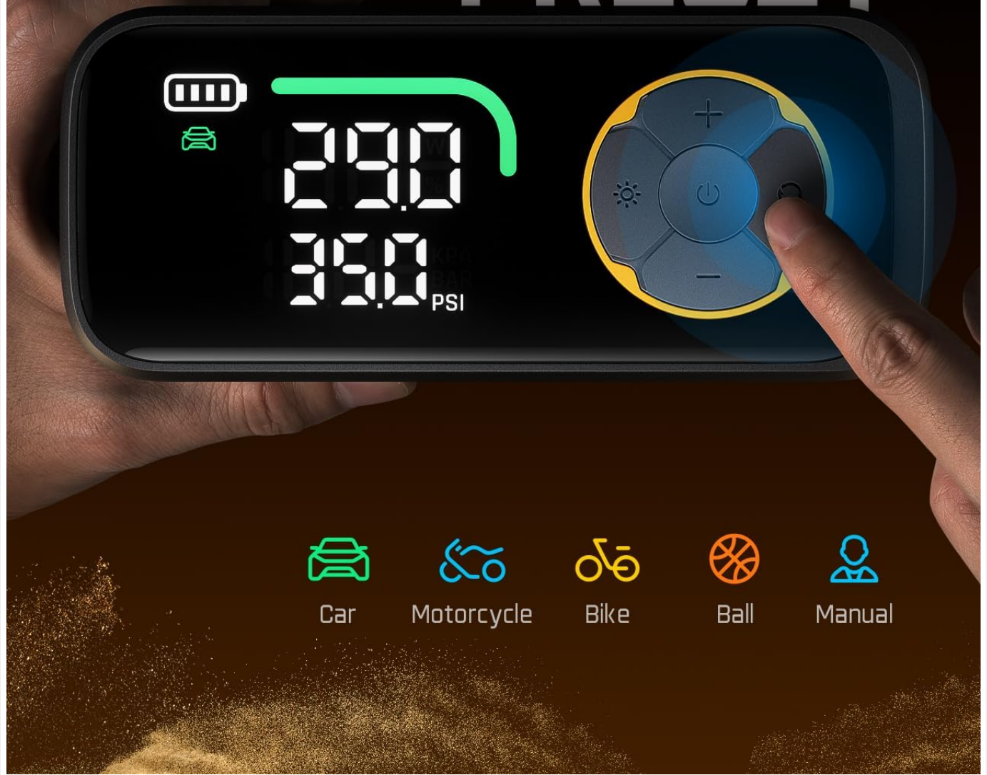
Image: The Fanttik X10 APEX flashlight in operation.