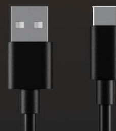
Image: Contents of the Fanttik X10 APEX package.