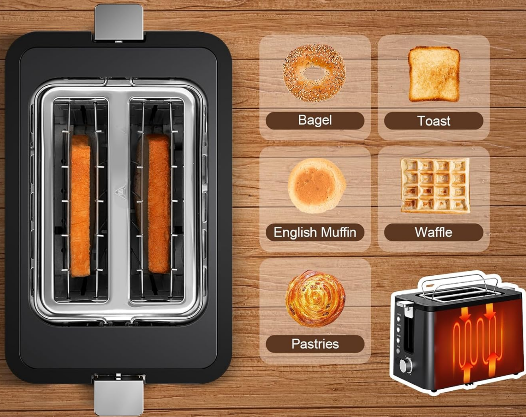
Image: An overhead view of the toaster's extra-wide slots, with illustrations of a bagel, toast, English muffin, waffle, and pastries, demonstrating the versatility of the slots.