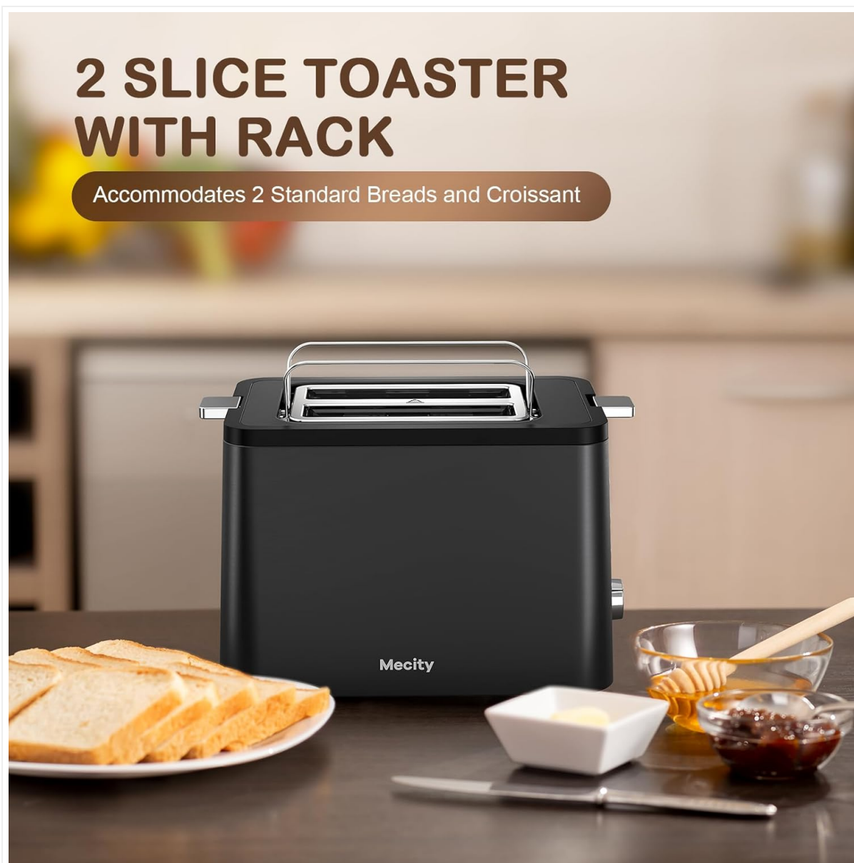
Image: The Mecity 2-Slice Toaster in black, featuring two wide slots and a removable warming rack on top. Slices of bread are visible next to the toaster.

The Mecity 2-Slice Toaster is designed for efficient and versatile toasting. It features extra-wide slots, multiple browning settings, and specialized functions for various bread types.