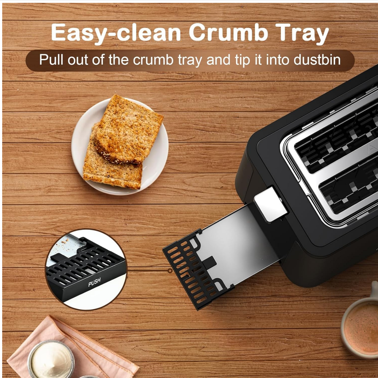
Image: A hand removing the easy-clean crumb tray from the bottom of the Mecity 2-Slice Toaster, with toasted bread slices on a plate nearby.

Pull out of the crumb tray and tip it into dustbin