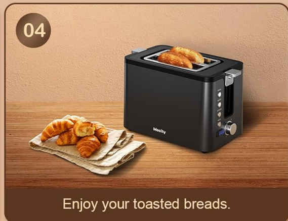
Image: A four-step visual guide demonstrating how to use the toaster: 1. Put bread into slots. 2. Select browning level. 3. Press down the lever. 4. Enjoy your toasted bread.