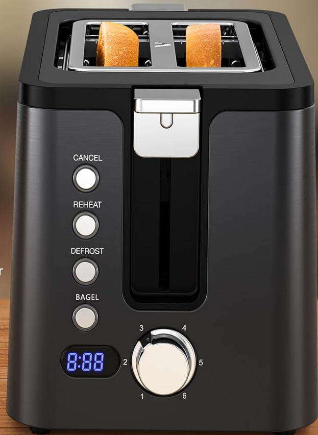
Image: A close-up view of the Mecenya 2-Slice Toaster's control panel, showing the 'CANCEL', 'REHEAT', 'DEFROST', and 'BAGEL' buttons, along with the browning control dial and digital display.