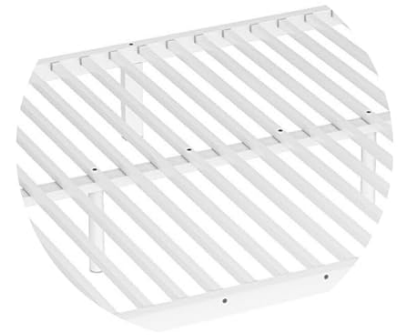
19 Slats Support

Image: Illustration detailing the heavy-duty steel construction, solid hardware, and 19 slat support system of the bunk bed frame, highlighting its robust design.