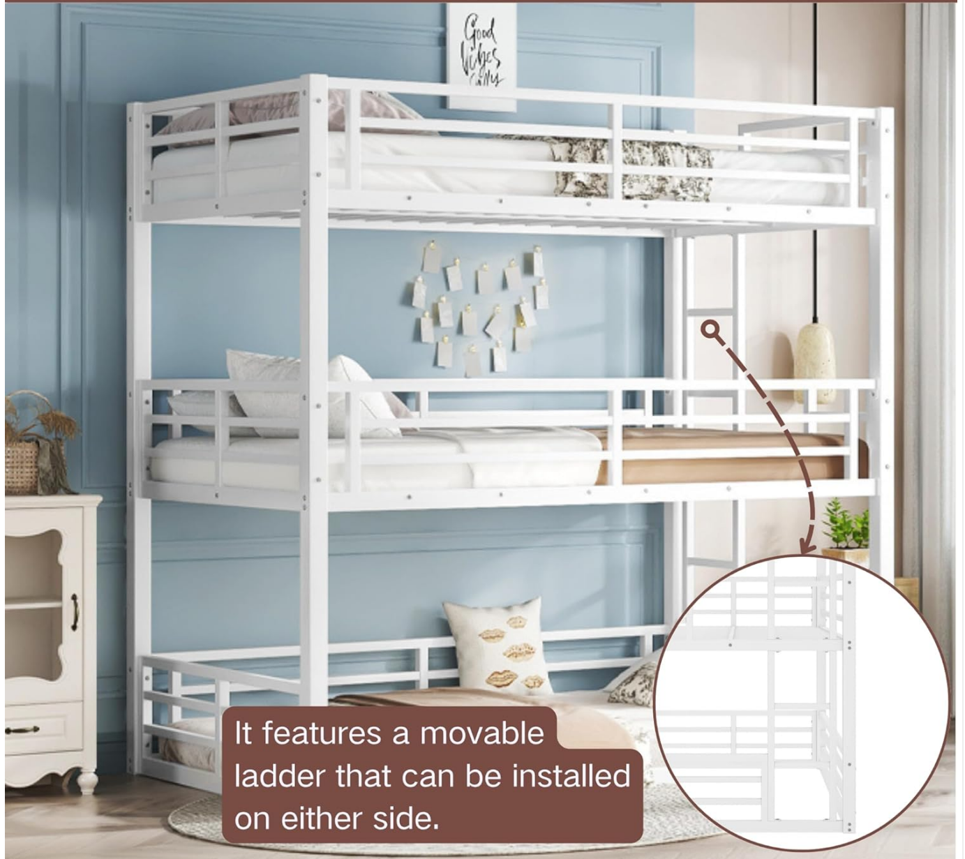
Image: This image highlights the adjustable ladder feature of the triple bunk bed, demonstrating how it can be installed on either the left or right side to suit various room configurations.