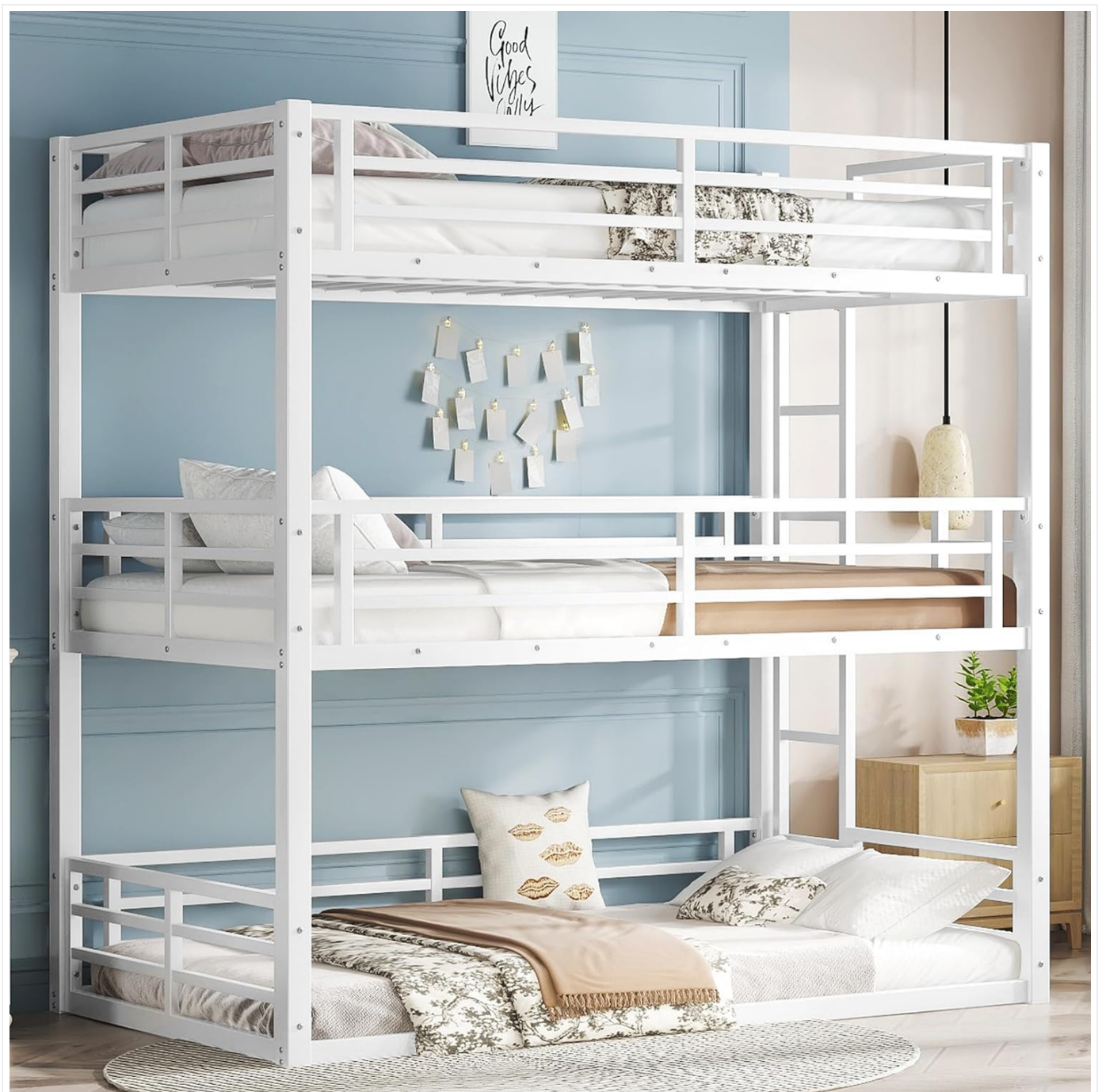
Image: Fully assembled Harper & Bright Designs Triple Bunk Bed, showcasing its three-tier design and white metal frame.

Carefully unpack all components from both packages. Lay them out on a clean, soft surface (like a carpet) to prevent scratching. Identify each part using the provided parts list in your physical manual.