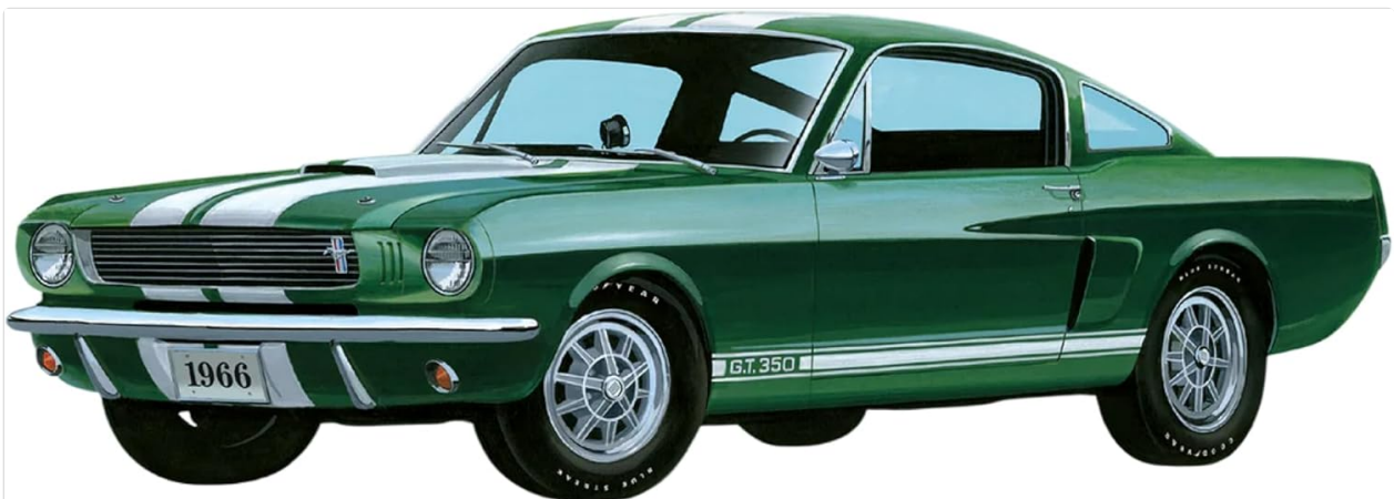
Image 5.2: Illustration of the completed 1966 Shelby GT-350 model.