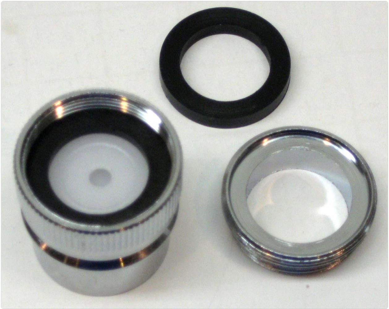
Figure 2: Disassembled view of the adapter, illustrating the main body, threaded connector, and rubber washer.