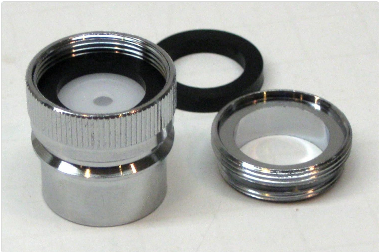
Figure 4: A detailed view of the adapter's internal threading and the placement of the rubber washer, essential for a leak-free seal.