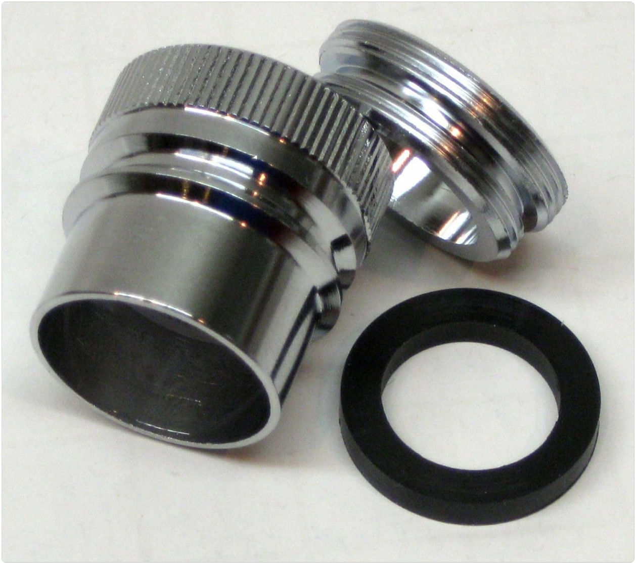
Figure 1: The Dishwasher Faucet Adapter Aerator Snap Fitting, showing the main body and threaded connector.