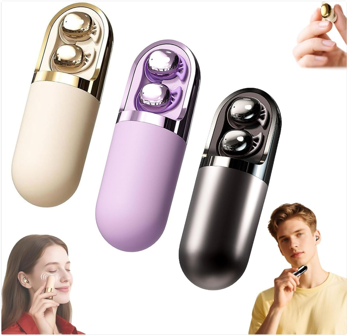
Figure 1: Generic S13 Vibration Massage Bluetooth Headphones and Charging Cases

The S13 headphones feature a compact, in-ear design with integrated touch controls and a portable charging case. The earbuds are designed for stable and comfortable wear, providing both audio and vibration massage functionalities.