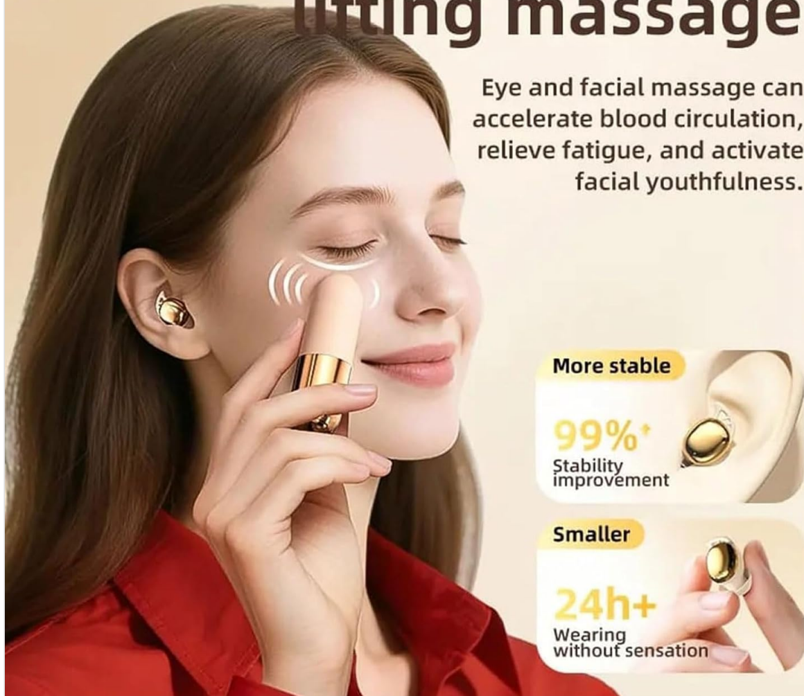
Figure 5: S13 Headphones used for Facial Massage

Eye and facial massage can accelerate blood circulation, relieve fatigue, and activate facial youthfulness.