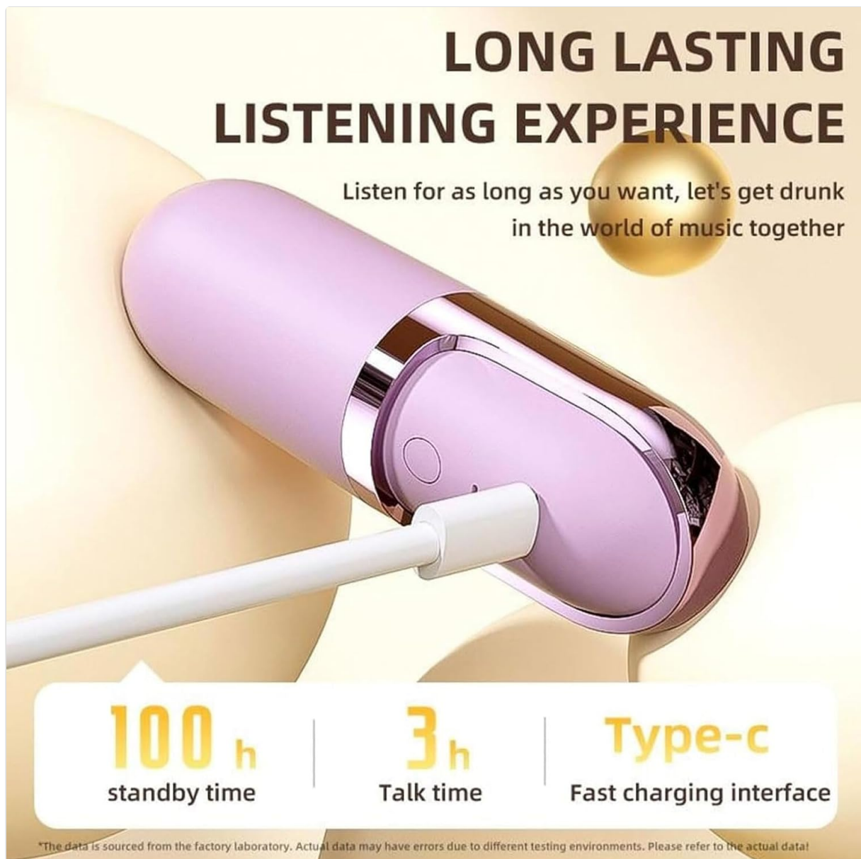
Figure 3: Charging the S13 Headphones Case via USB-C