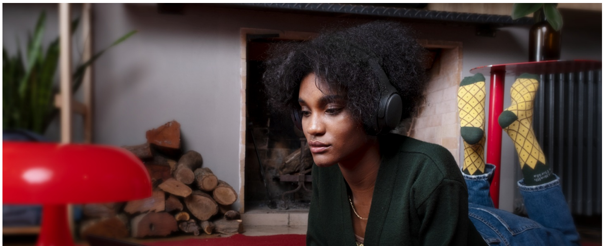
Image: A woman wearing the headphones, illustrating the effectiveness of the 5 AI microphones and AI noise cancelling for clear calls in various settings.