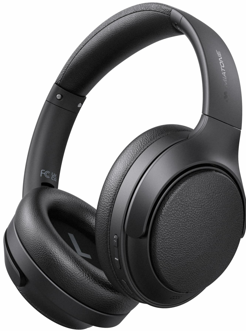
Image: MIATONE Seattle T-01A PRO Bluetooth Headphones in black, showcasing their sleek design.