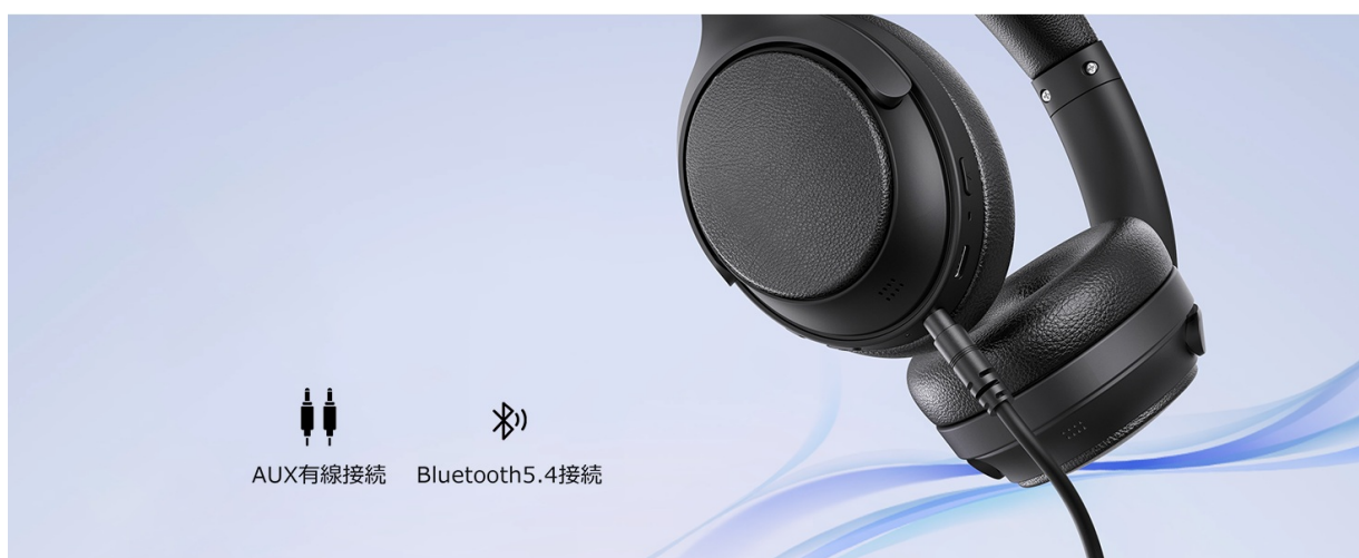
Image: Illustration of both wired (AUX) and wireless (Bluetooth 5.4) connection options for the headphones.

To use the headphones in wired mode, connect one end of the 3.5mm AUX audio cable to the headphone's AUX port and the other end to your audio source's 3.5mm jack. The headphones will automatically switch to AUX mode. Bluetooth functions will be disabled in wired mode.