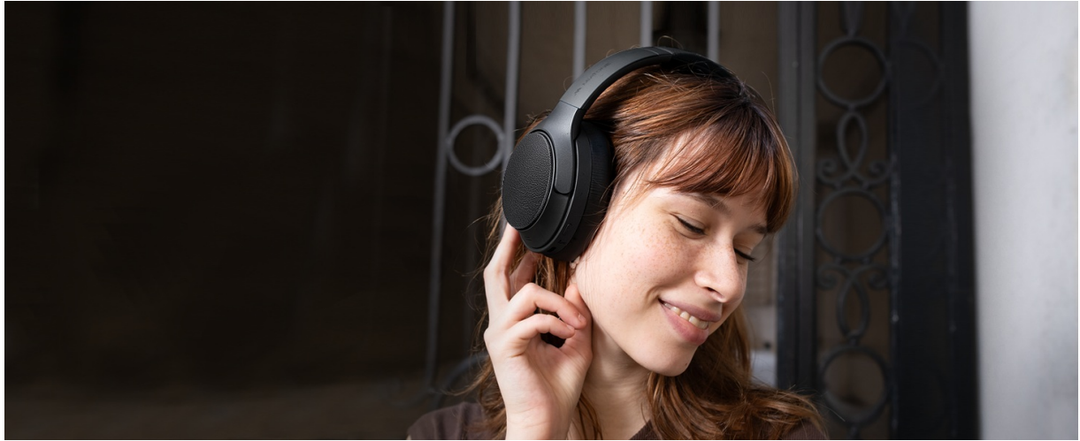
Image: A woman wearing the headphones, demonstrating the -48dB noise reduction capability in various environments like trains, airplanes, and cafes.