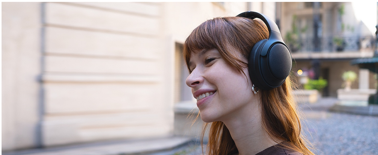
Image: Visual representation of the headphones' extended battery life, indicating up to 60 hours of playback.