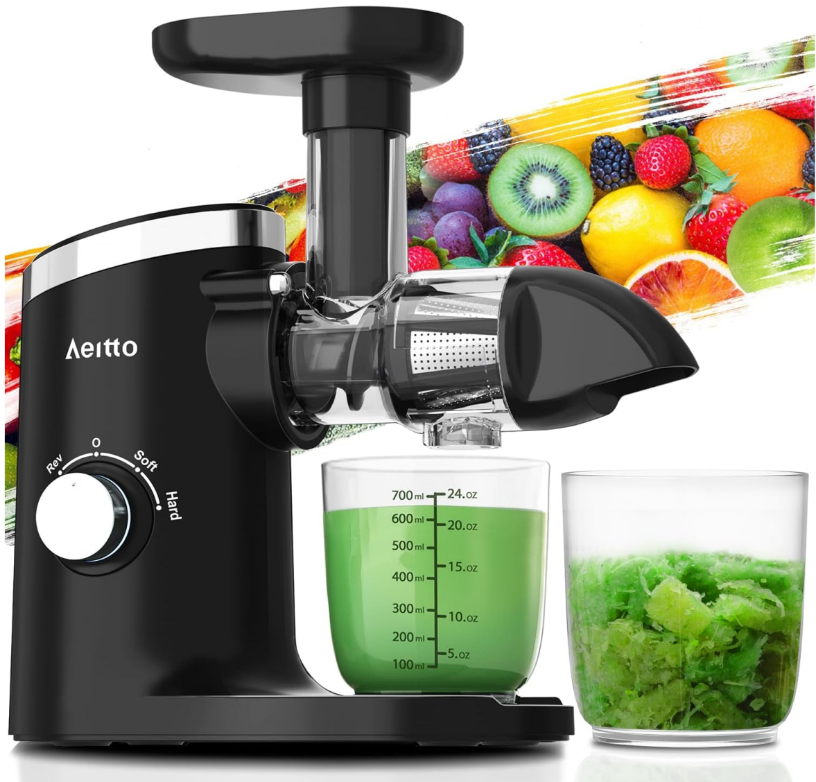
Image 1: The Aeitto Classic Horizontal Cold Press Juicer, showcasing its sleek design and the separate containers for juice and pulp.