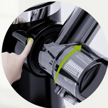
One Button Disassemble

Easy to assemble, use and clean, make your life easier.