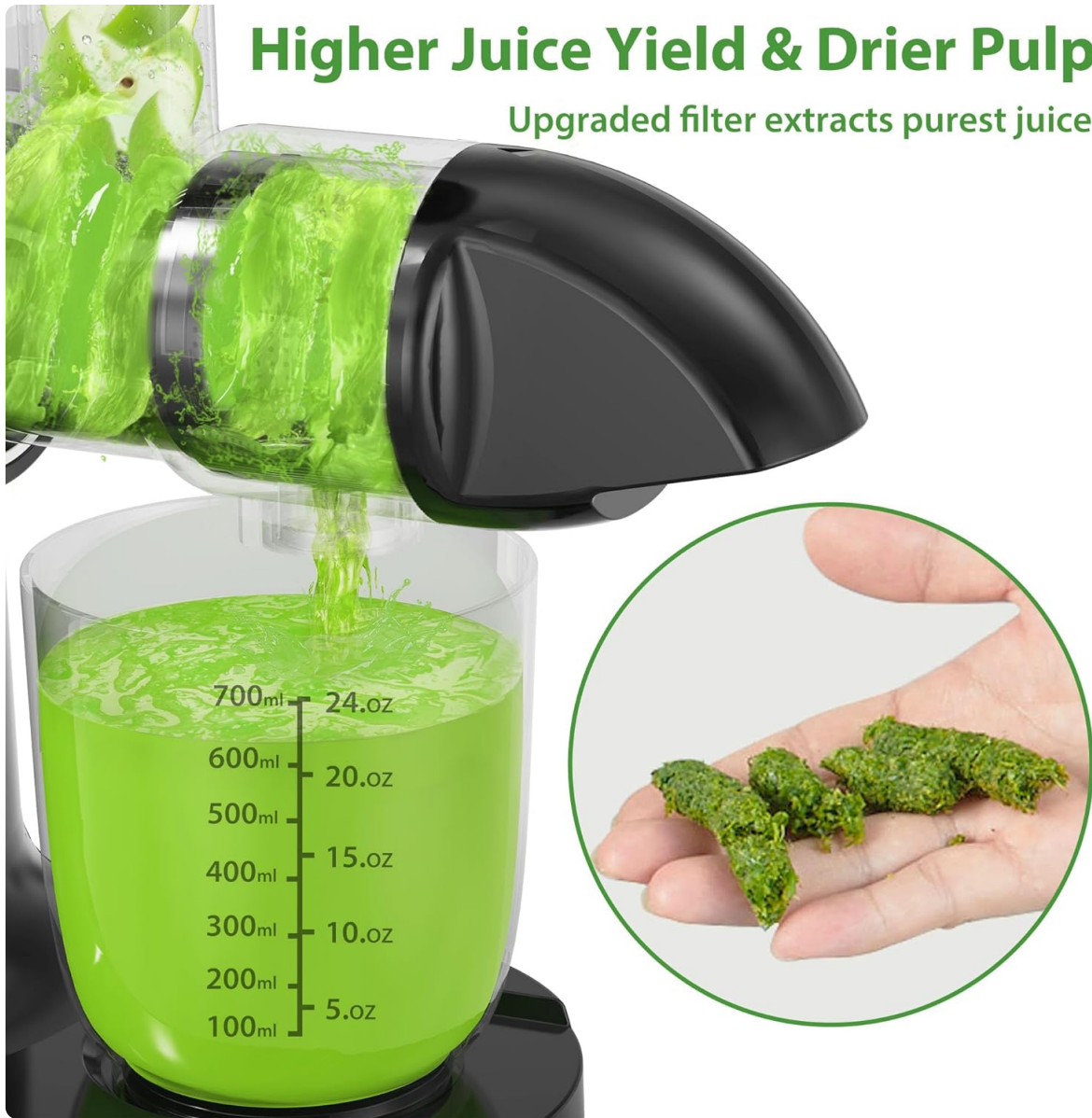
Image 3: The juicer in operation, demonstrating the separation of juice into a measuring cup and dry pulp into a separate container.