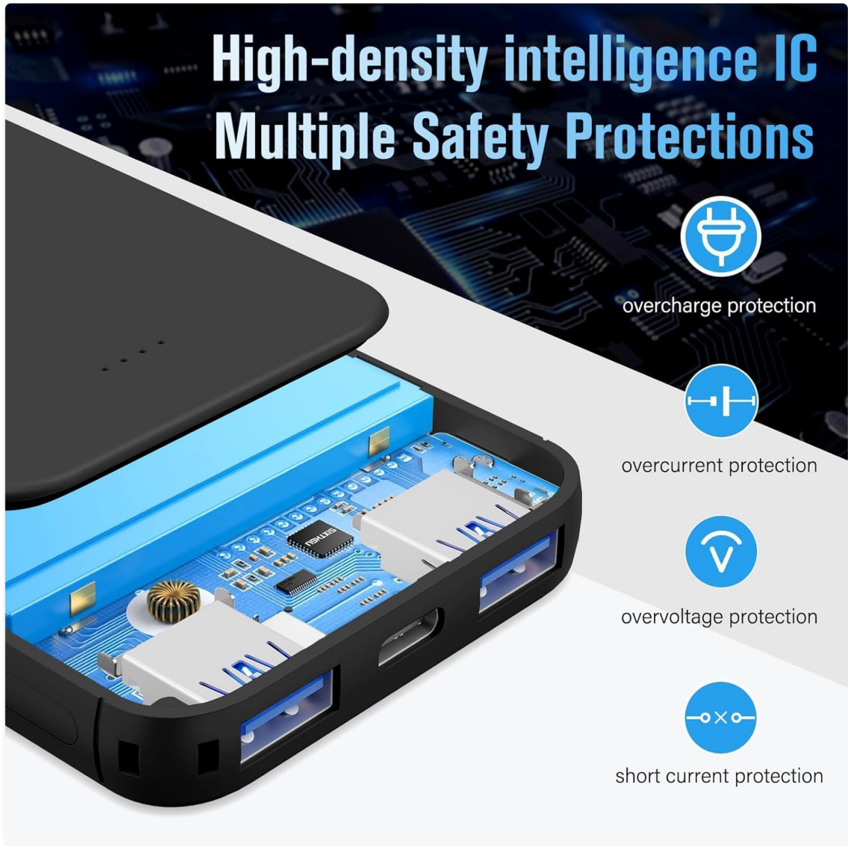
Image 2.2: Visual representation of the power bank's integrated safety features.