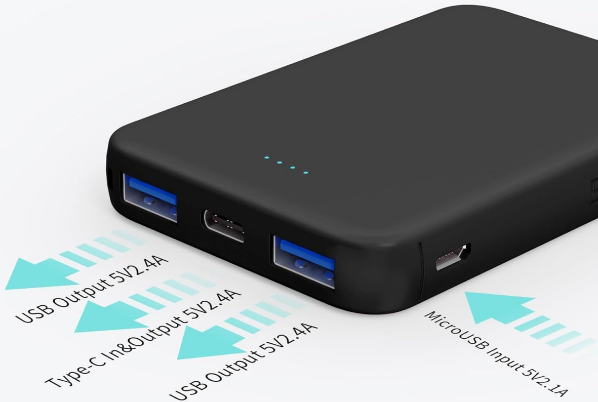
Image 4.1: Port layout of the VANYUST S22 Portable Charger, indicating two USB-A outputs, one USB-C input/output, and one Micro USB input.

*Dual Output provide total 5V2.1A (Max)*