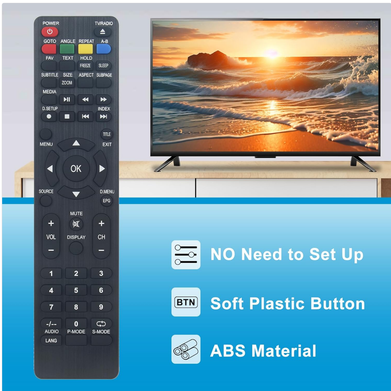
Image 2.1: The VINABTY remote control highlighting key features such as no setup requirement, soft plastic buttons, and durable ABS material construction.