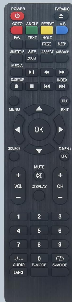
Image 5.1: The remote control emphasizing its premium ABS material and high resilience for durability.