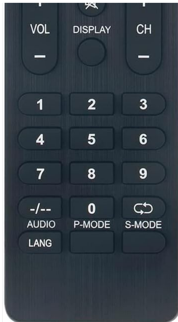
Image 4.1: A clear front view of the VINABTY remote control, displaying all functional buttons.