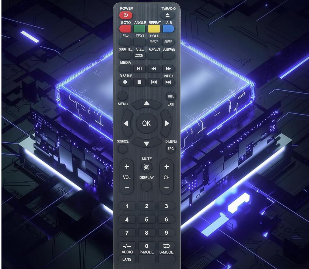
Image 2.2: The remote control shown against a background suggesting advanced internal components, emphasizing its upgraded smart chip for stable performance.