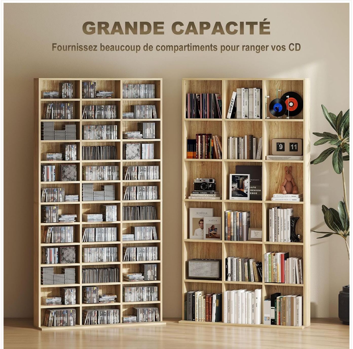
Image: Example of the large storage capacity, showing the shelf filled with various media and decorative items.