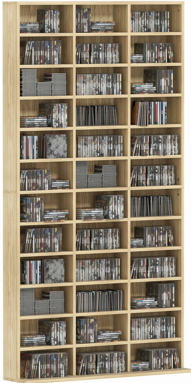
Image: Fully assembled HOMCOM CD/DVD storage shelf, showcasing its capacity and design.