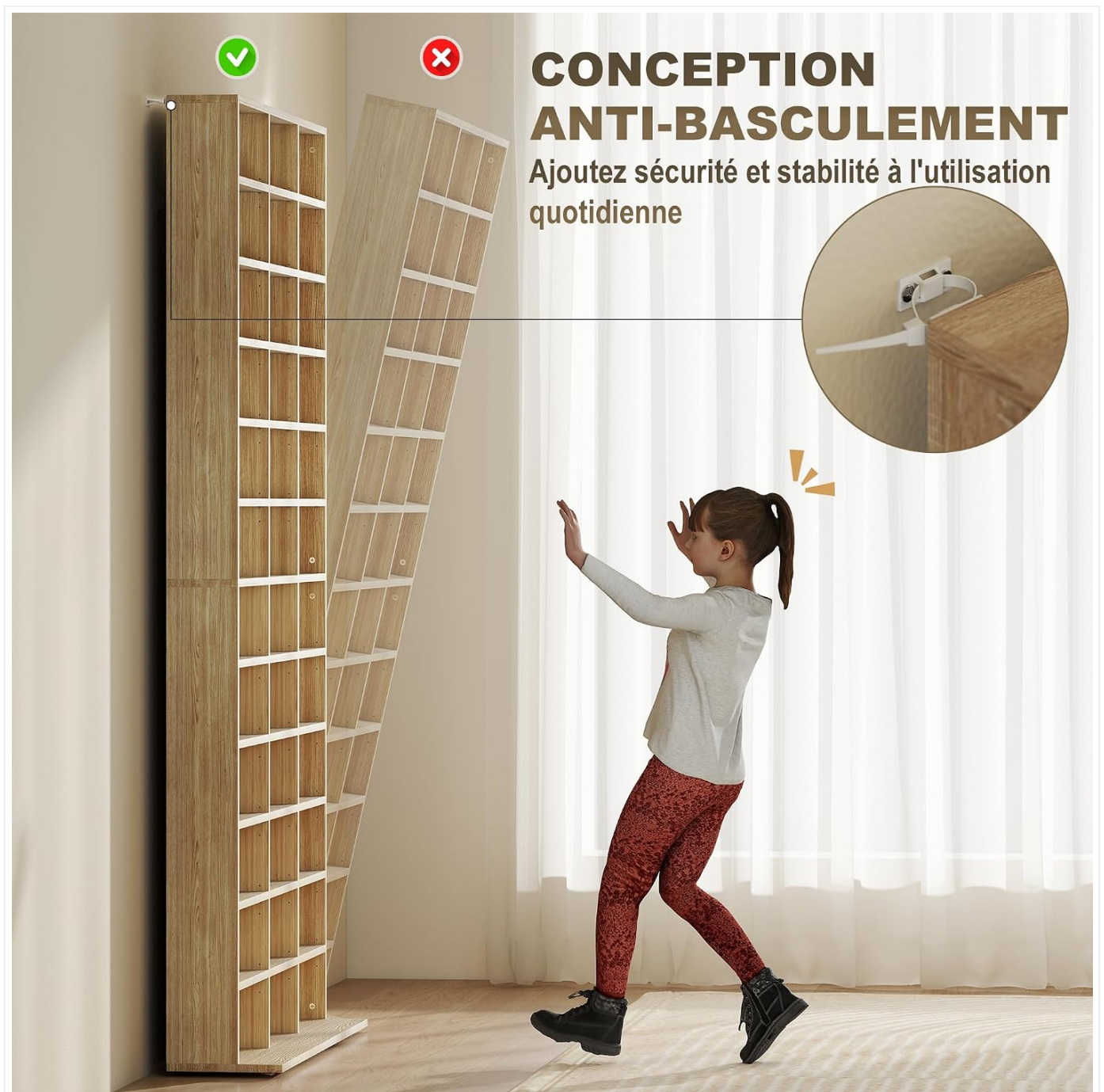
Image: Illustration of the anti-tipping design, showing how to secure the shelf to the wall for enhanced safety.