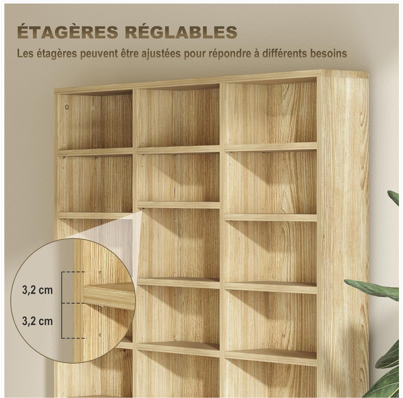
Image: Detail showing the adjustable shelf mechanism, allowing for flexible compartment sizing.