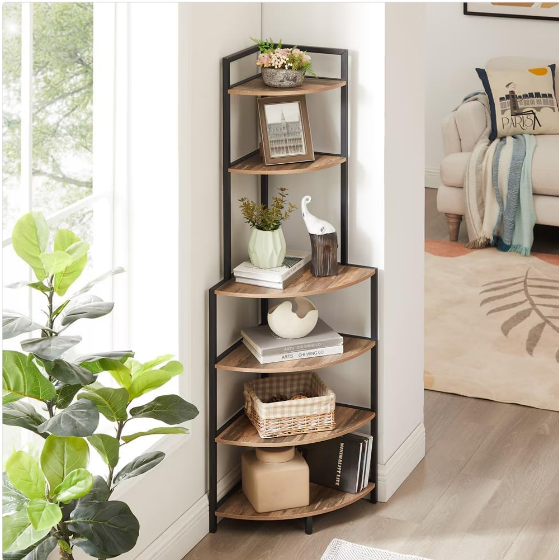
Figure 5: Illustration of the recommended weight limit per shelf, indicating that each of the six tiers can safely hold up to 30 pounds.