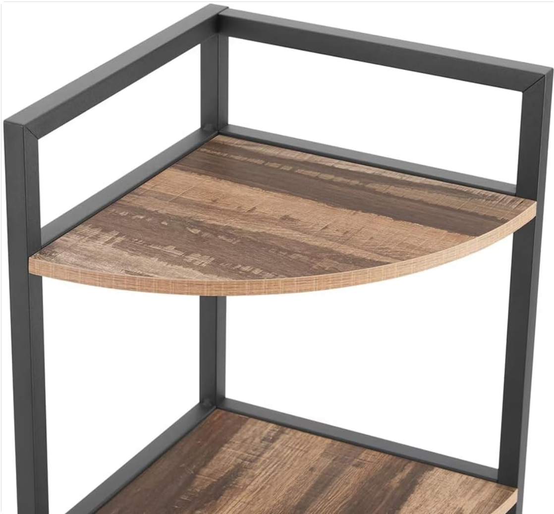
Figure 7: Another view of the corner bookshelf, highlighting its adaptability to different interior designs and functional needs.