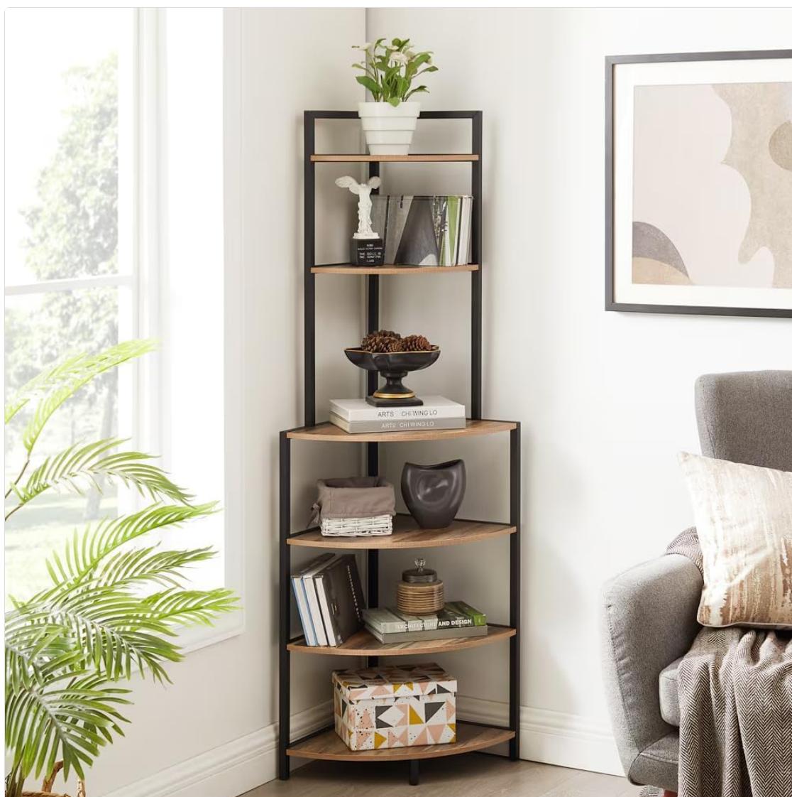
Figure 2: The fully assembled ALYIAMXL 6-Tier Corner Bookshelf, showcasing its design and capacity for display and storage in a home setting.