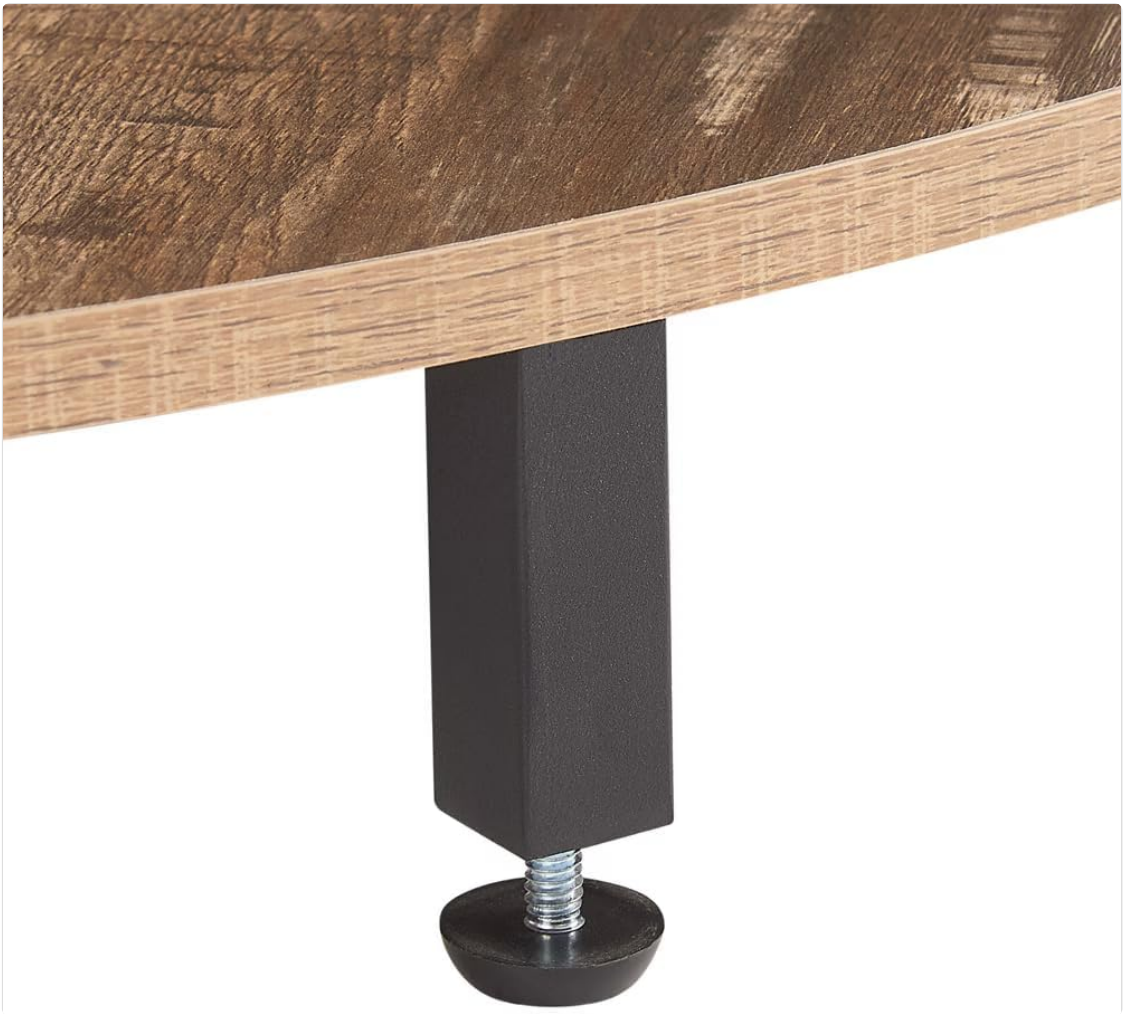
Figure 3: Detail of the top shelf and the sturdy metal frame construction, highlighting the quality of materials and finish.