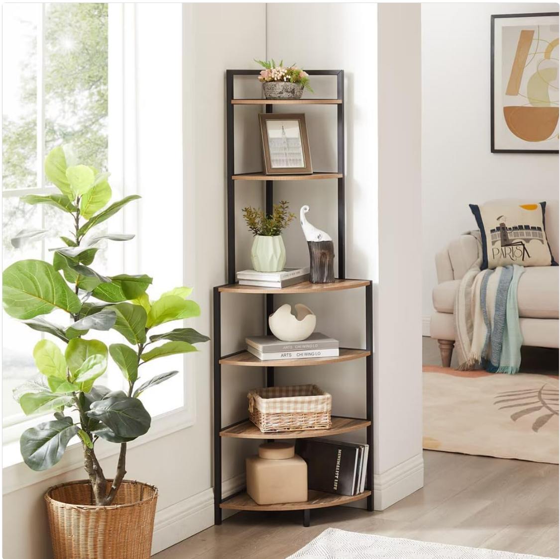
Figure 6: The bookshelf integrated into a living room, demonstrating its aesthetic appeal and practical use for displaying various items.