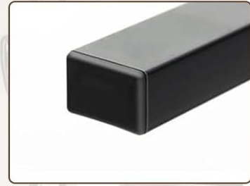
Non-slip Foot Pads