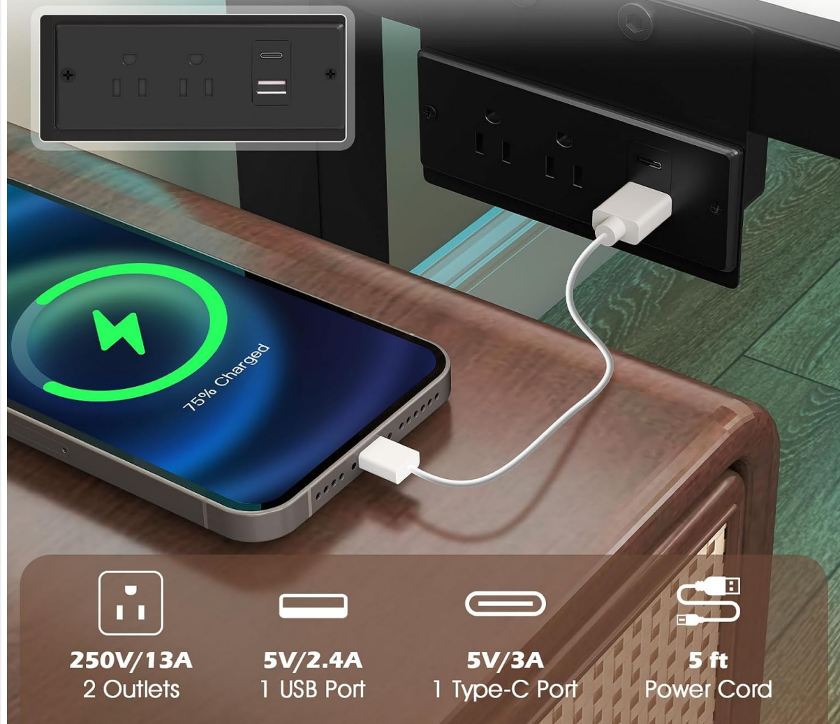
Figure 5: The integrated charging station offers convenient access to power with standard outlets, USB-A, and USB-C ports.