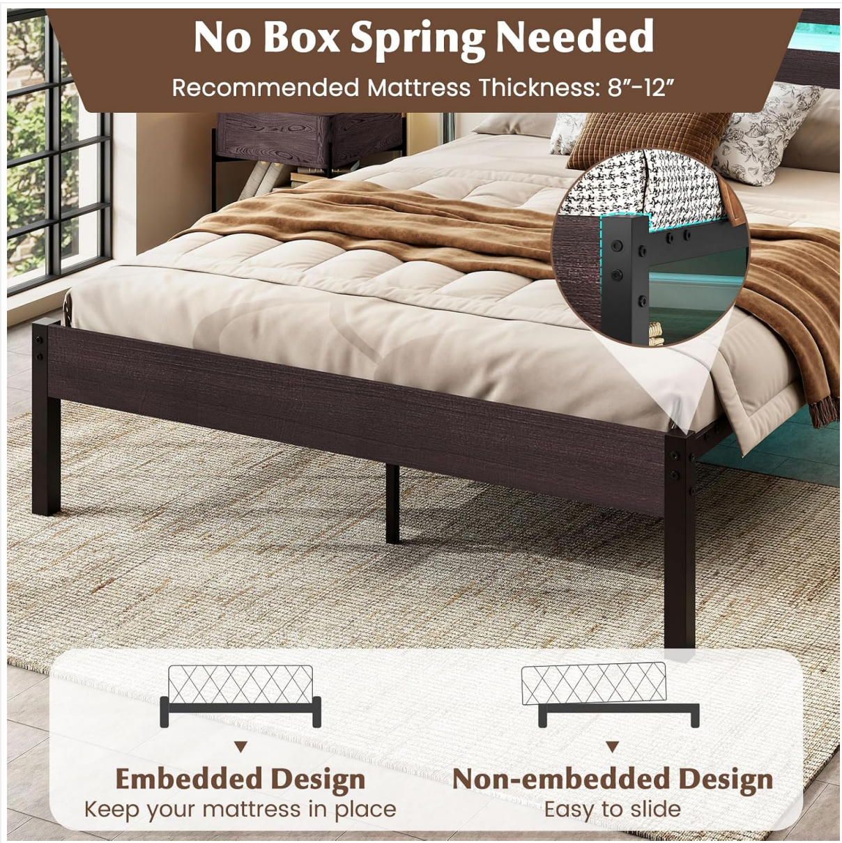
Figure 3: The embedded design of the bed frame securely holds the mattress, making a box spring unnecessary. Recommended mattress thickness is 8"-12".