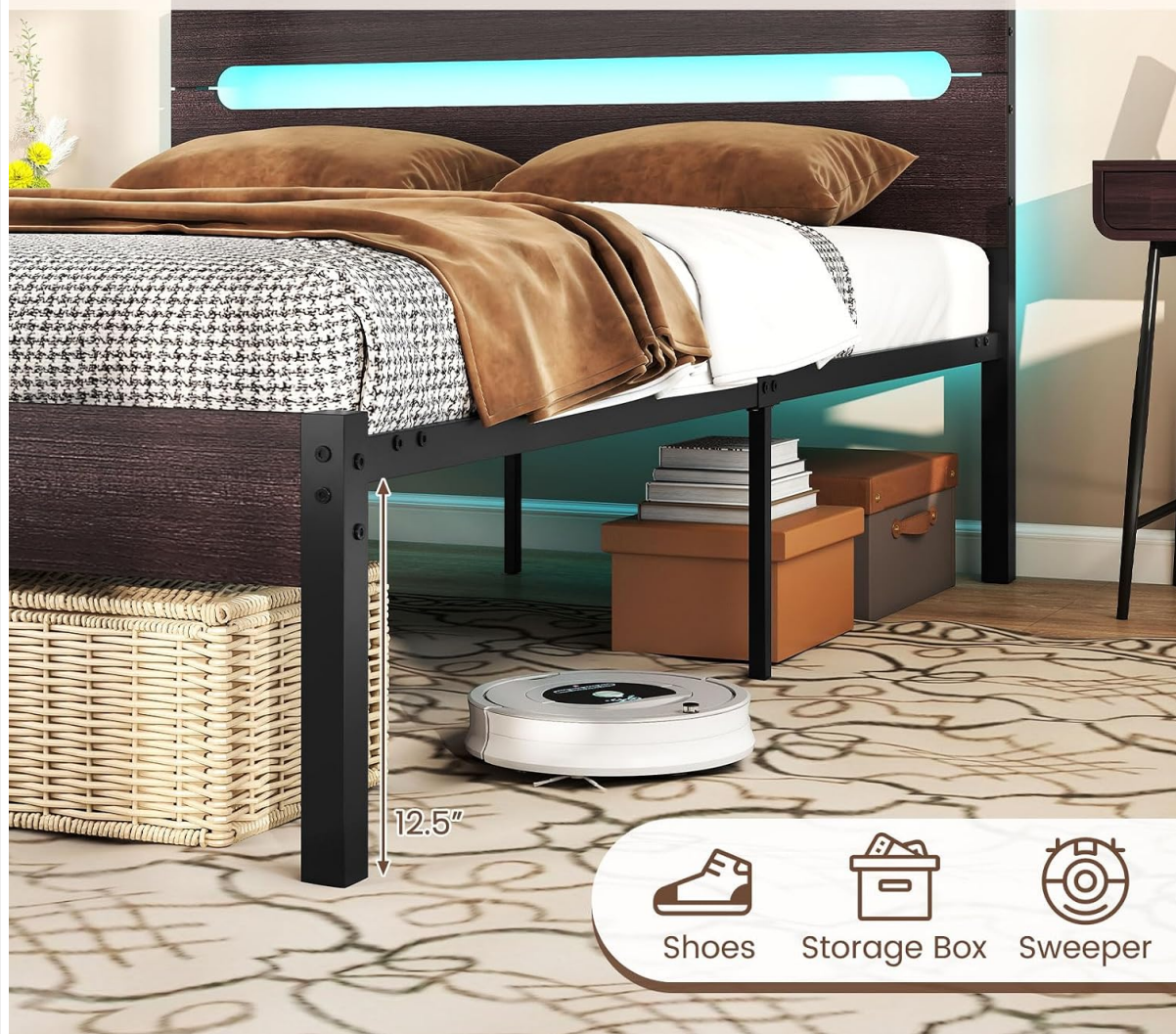
Figure 6: The bed frame provides 12.5 inches of under-bed clearance, ideal for additional storage.