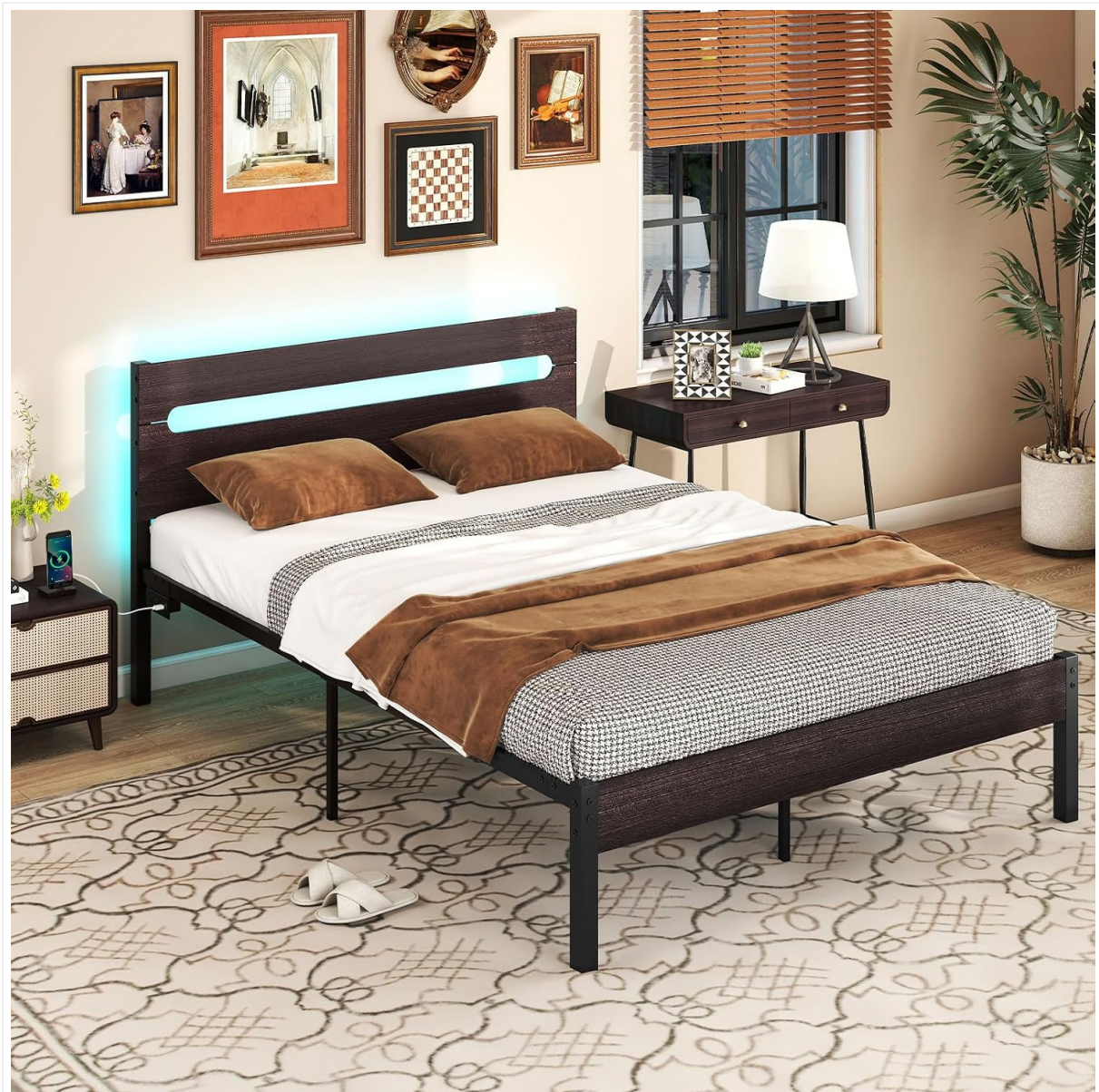
Figure 1: Assembled bed frame with key dimensions (78"L x 55"W x 34.5"H, 12.5" under-bed clearance).