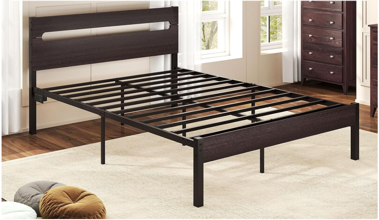
Figure 2: Details of the heavy-duty metal platform bed construction, including snap-on connections, noise-reducing foam pads, and non-slip foot pads.