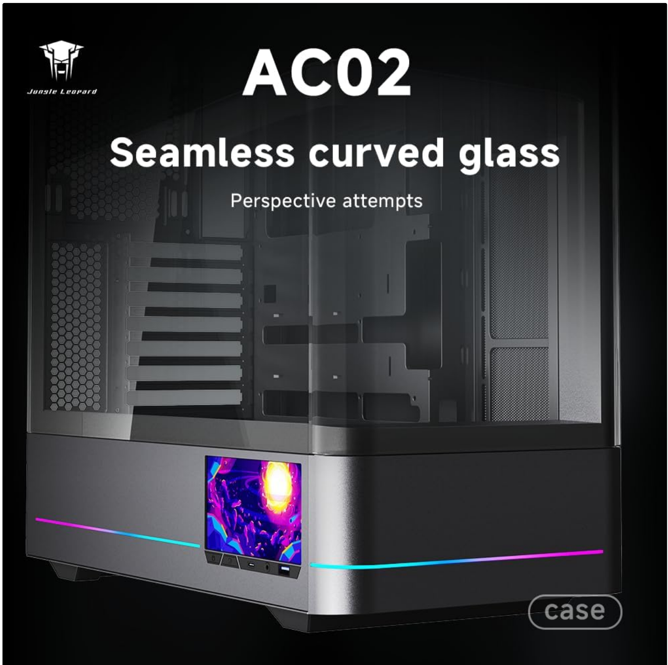
Figure 1: Overall view of the Jungle Leopard AC-02 PC Case with seamless curved glass panel.

Video 1: Official product overview of the Jungle Leopard AC-02 Digital ATX PC Gaming Computer Case.