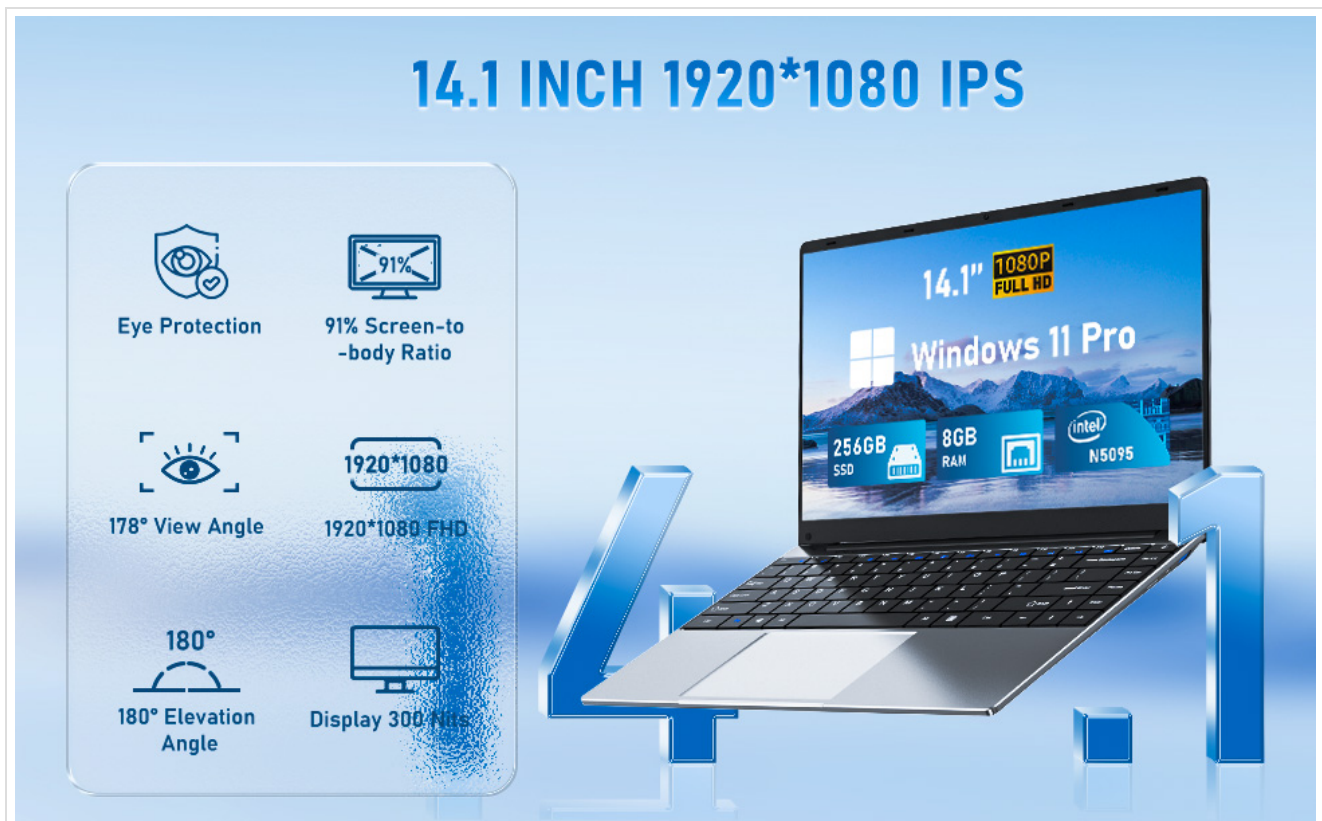
Image: Visual summary of key laptop features and specifications.