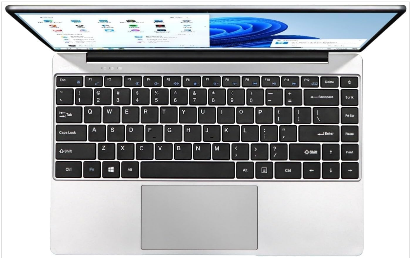
Image: Detailed view of the laptop's keyboard and touchpad.