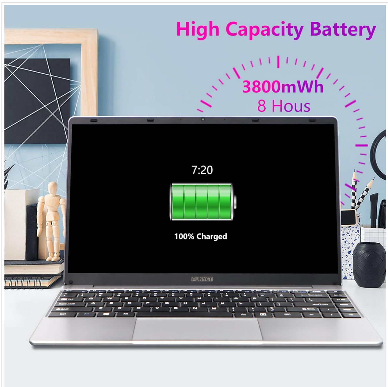
Image: Laptop screen showing a full battery charge indicator.