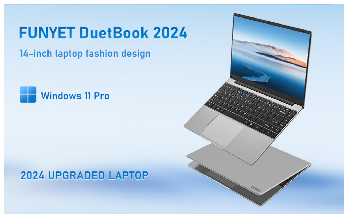
Image: The Windows 11 Pro operating system interface shown on the laptop screen.