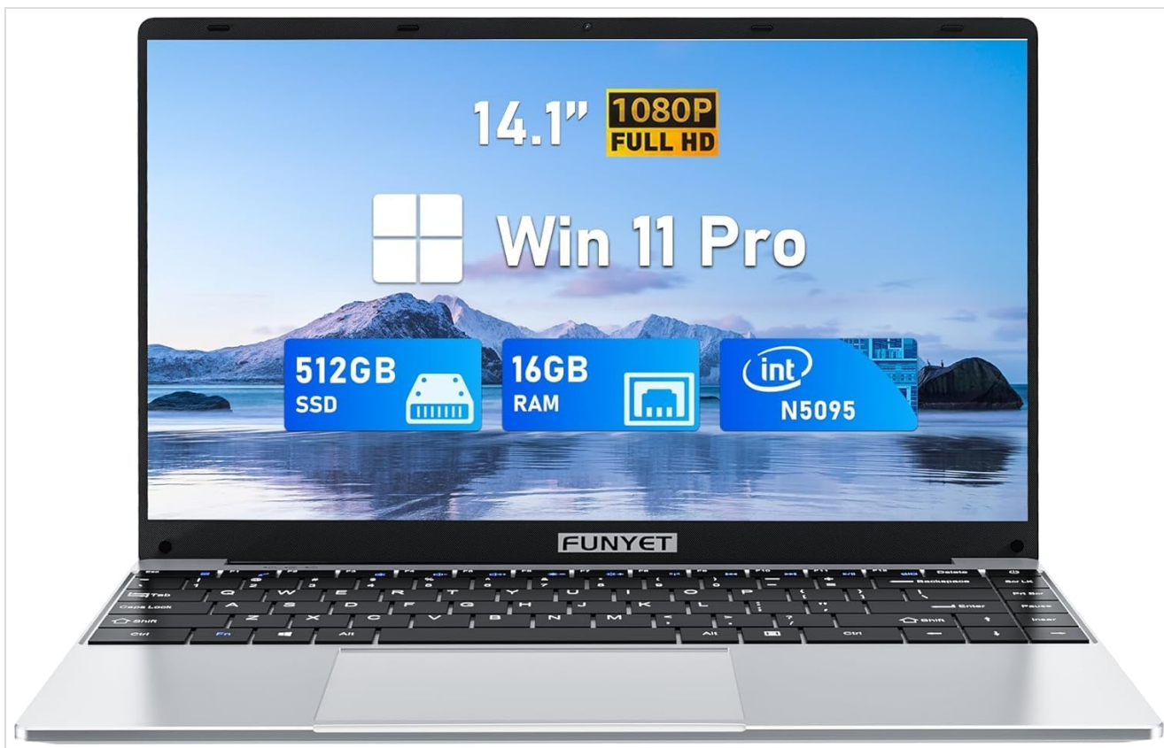
Image: Front view of the FUNYET 14-inch Laptop N5095, highlighting its key specifications on the screen.

This manual provides essential information for setting up, operating, maintaining, and troubleshooting your FUNYET 14-inch Laptop N5095. Please read this guide thoroughly to ensure optimal performance and longevity of your device.