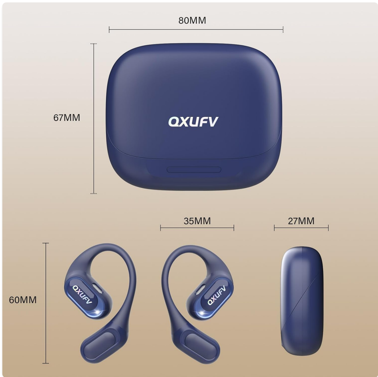
Image: A diagram showing the dimensions of the QXUFV QX68 charging case (80mm x 67mm) and individual earbuds (60mm length, 35mm width, 27mm depth).