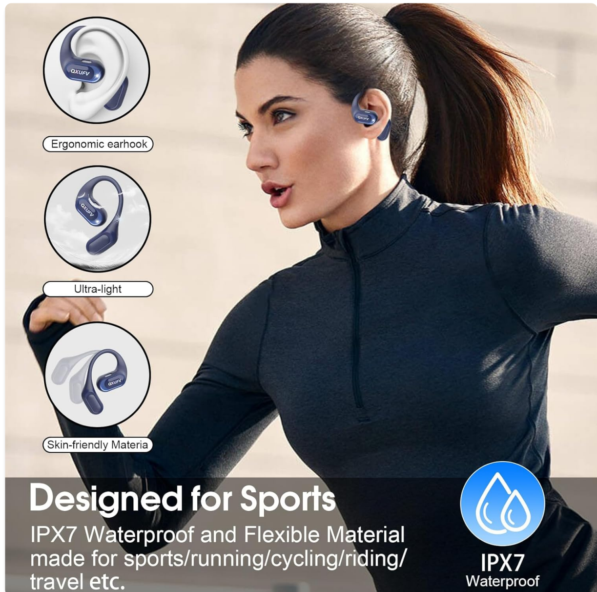
Image: An image highlighting the ergonomic earhook, ultra-light design, skin-friendly material, and IPX7 waterproof rating of the QXUFV QX68 headphones, emphasizing their suitability for sports.

The QX68 headphones are IPX7 waterproof, meaning they can withstand immersion in water up to 1 meter for 30 minutes. They are resistant to sweat and rain, making them suitable for workouts and outdoor activities. However, the charging case is not waterproof. Ensure the earbuds are dry before placing them back into the charging case to prevent damage.