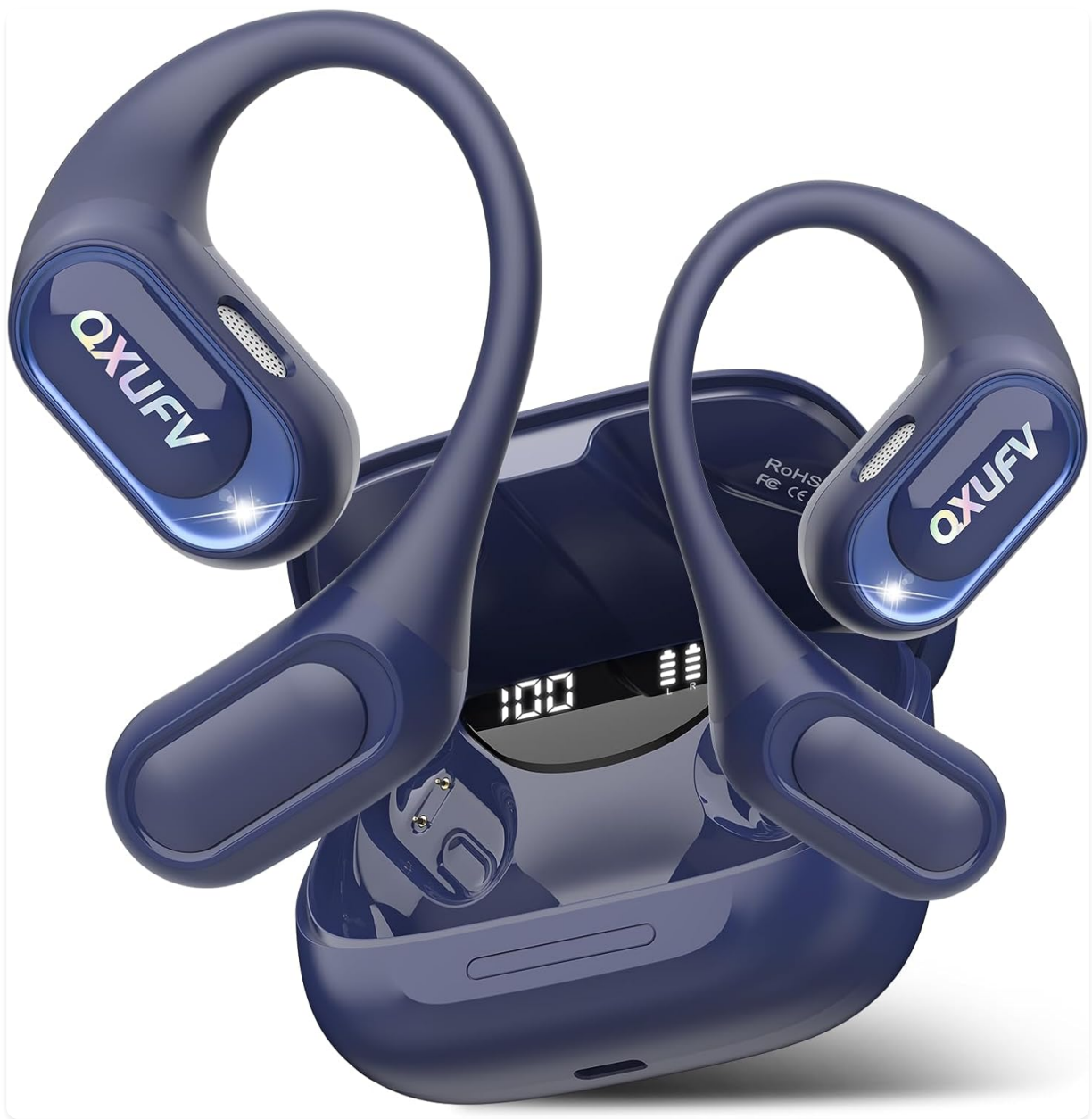
Image: The QXUFV QX68 open ear headphones in blue, resting within their charging case. The case features an LED power display.

The open-ear design ensures your ear canals remain open, allowing you to hear your surroundings while enjoying audio. This enhances safety during outdoor activities.