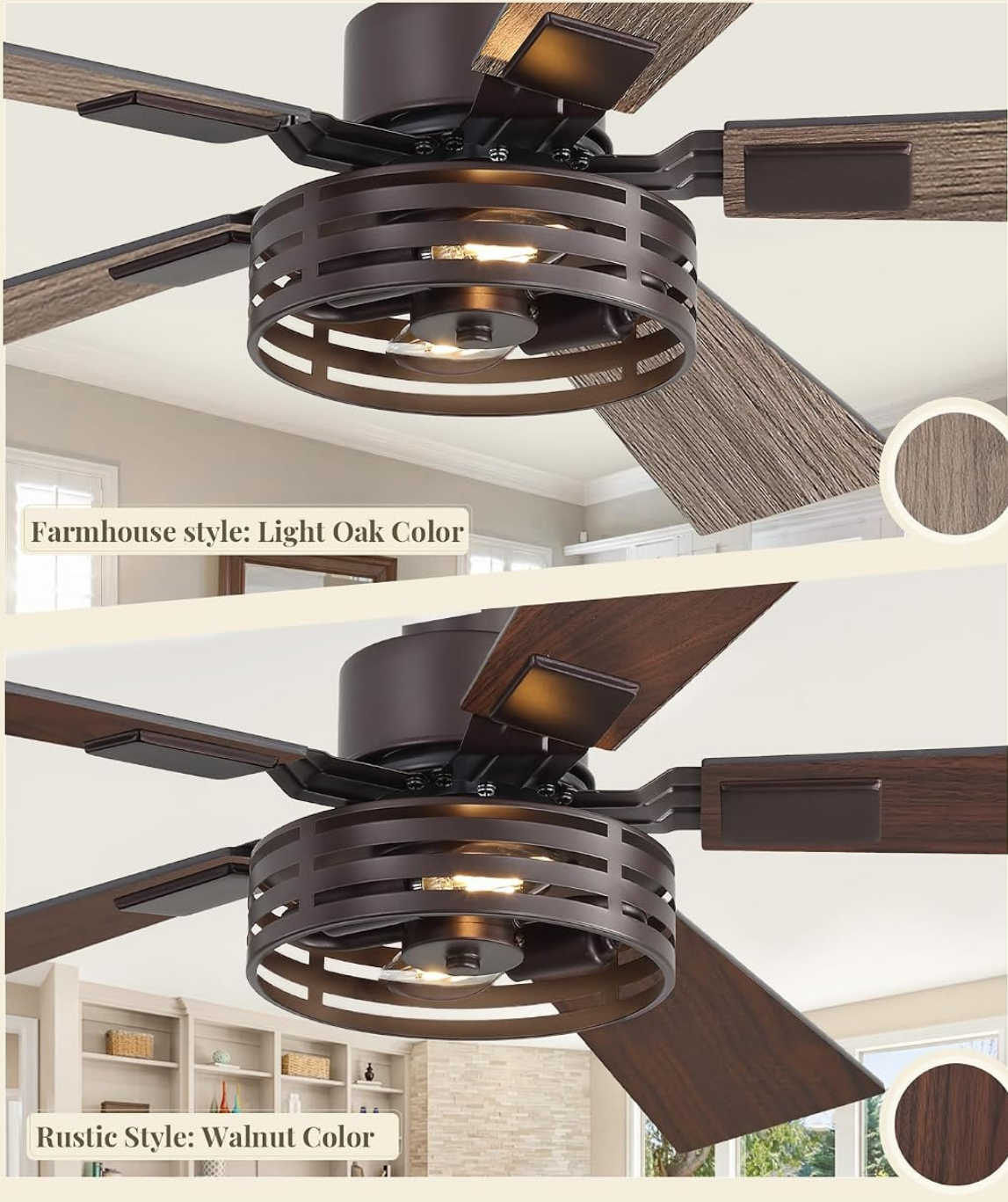
Figure 2: Dual-finish fan blades. This image shows two sides of a fan blade, one in a light oak color (farmhouse style) and the other in a rustic walnut color, offering versatile aesthetic options.