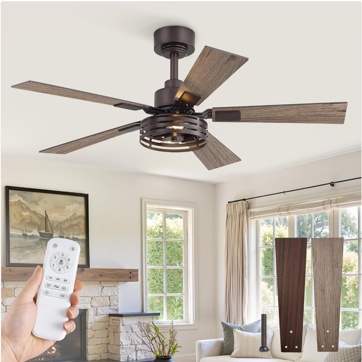
Figure 1: Complete Fanfulous Farmhouse Caged Ceiling Fan with Remote. This image displays the fully assembled fan, highlighting its five dual-finish blades, caged light fixture, and the included remote control.