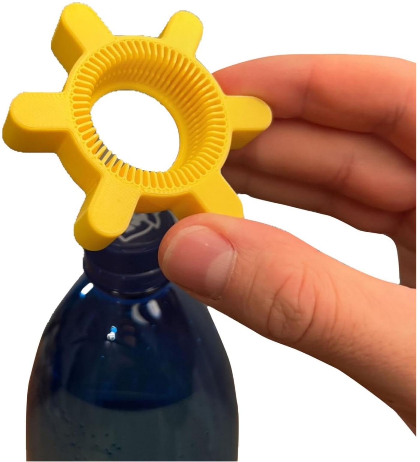
Image: A hand demonstrating how to position the yellow silicone bottle opener over a blue bottle cap, showing the ergonomic grip.