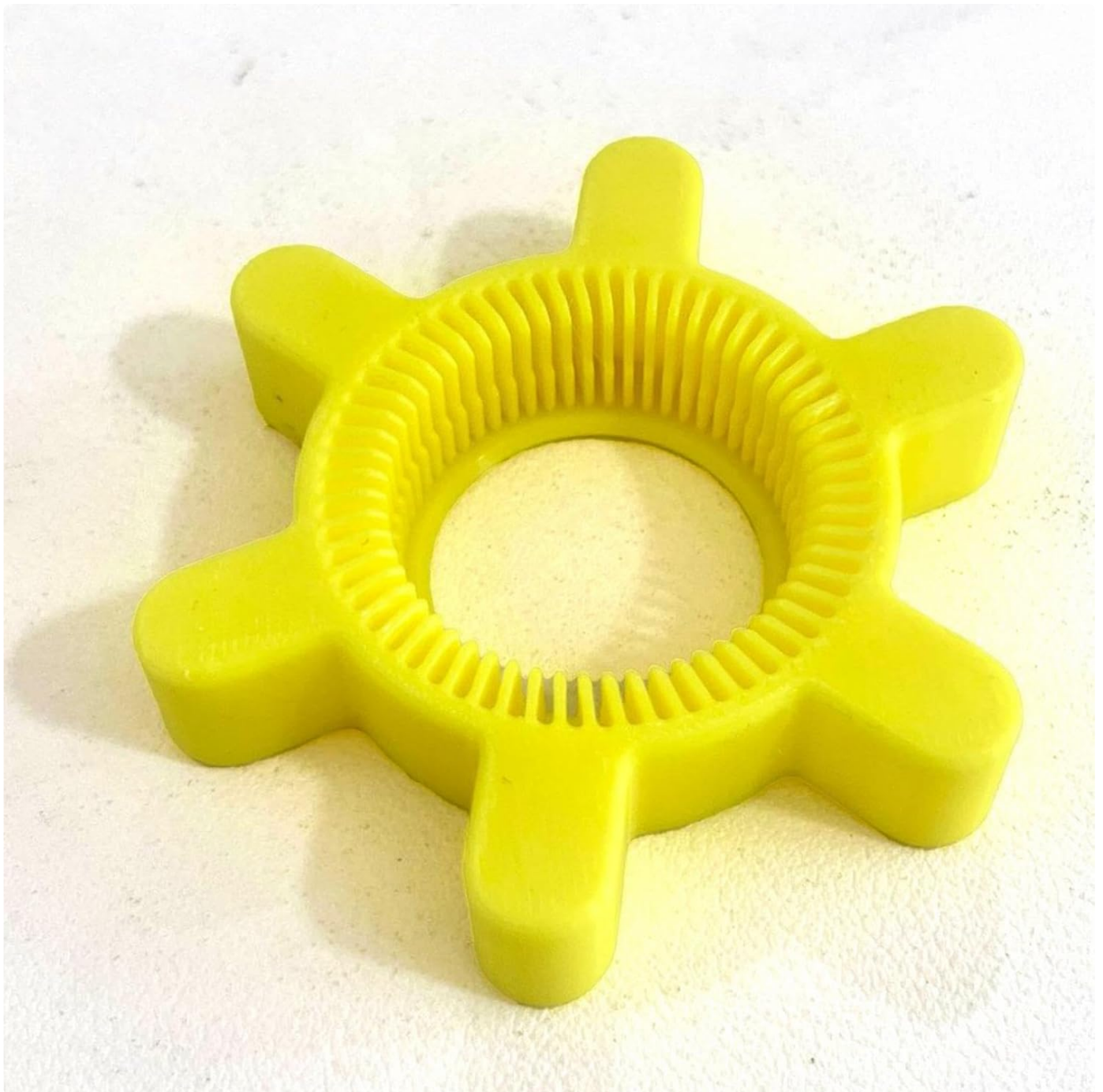
Image: A single yellow silicone bottle opener viewed from the top, highlighting its textured inner ring designed for cap gripping.