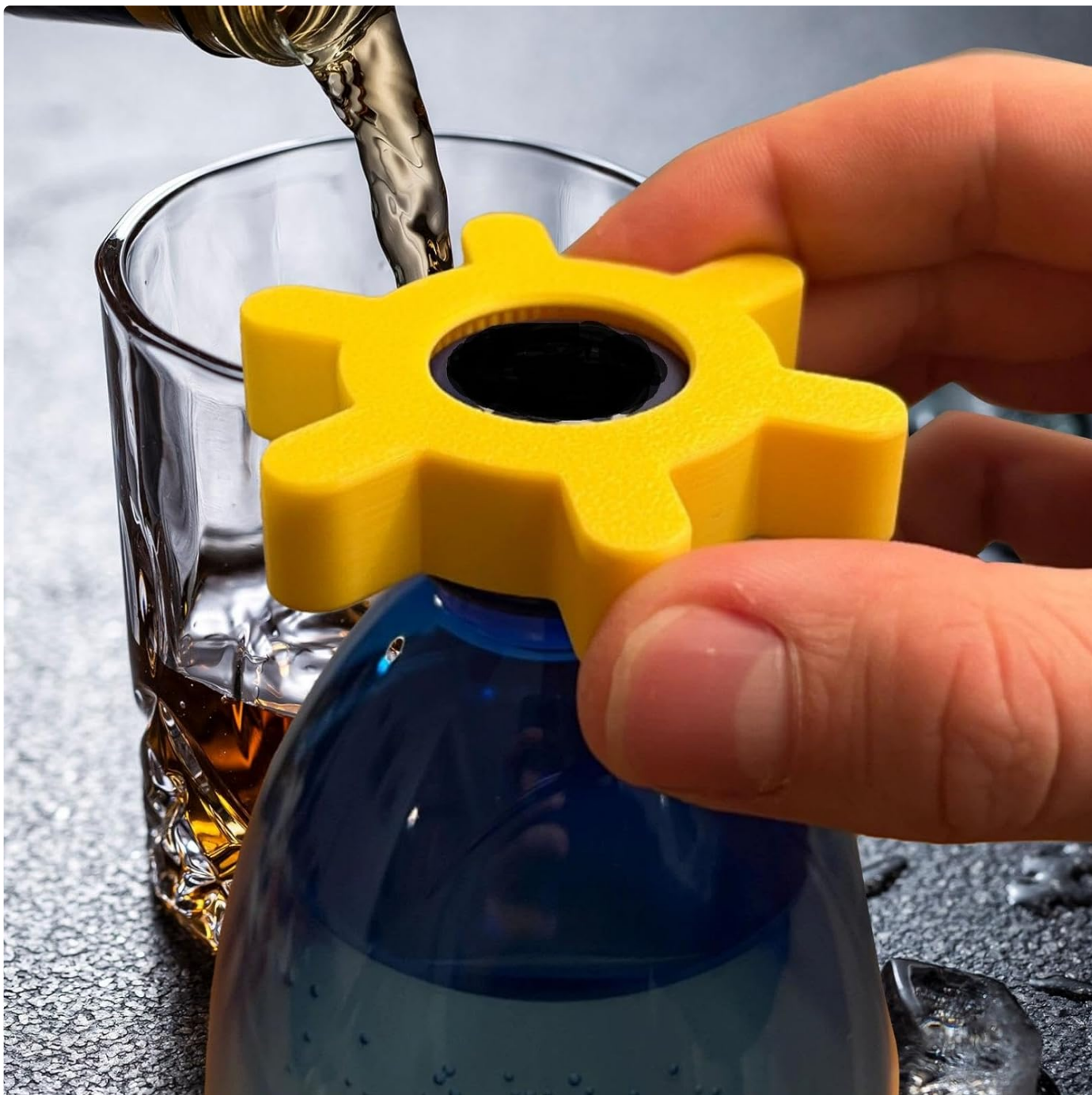
Image: A hand twisting the yellow silicone bottle opener on a blue bottle, illustrating the ease of use for opening or tightening caps, with a beverage glass in the background.