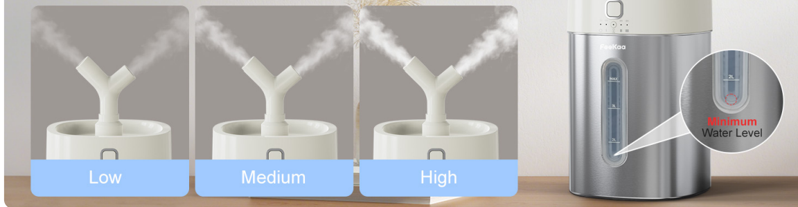
Image: The easy top-fill design of the humidifier, allowing for simple and spill-free refills.

Note: Keep water above the minimum water level to ensure proper operation.