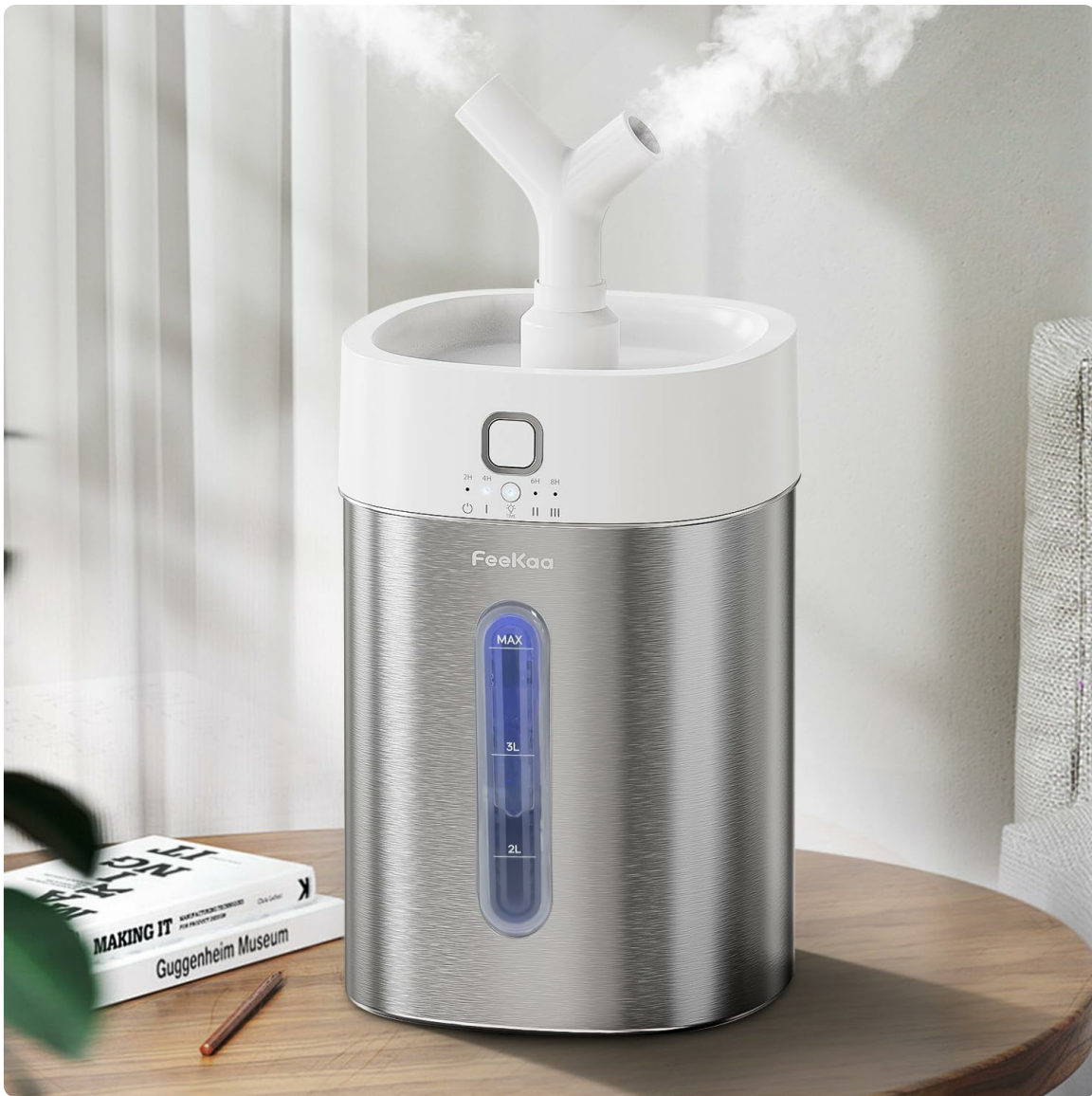
Image: A complete view of the Feekaa Stainless Steel Humidifier, illustrating its assembled form.