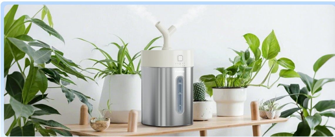
Image: The Feekaa Stainless Steel Humidifier providing comfortable humidity in a home setting.

Thank you for choosing the Feekaa Stainless Steel Humidifier. This cool mist ultrasonic humidifier is designed to improve air quality and comfort in various environments, including bedrooms, nurseries, living rooms, offices, and for plant care. Featuring a 4-liter (1-gallon) capacity, it provides up to 30 hours of continuous operation, covering areas up to 500 sq. ft. Its food-grade stainless steel tank is dishwasher safe and filter-free, ensuring easy cleaning and maintenance. The humidifier operates quietly at just 24dB and includes convenient features such as adjustable mist levels, a 360° rotatable nozzle, a programmable timer, an optional night light, and automatic shut-off for safety.