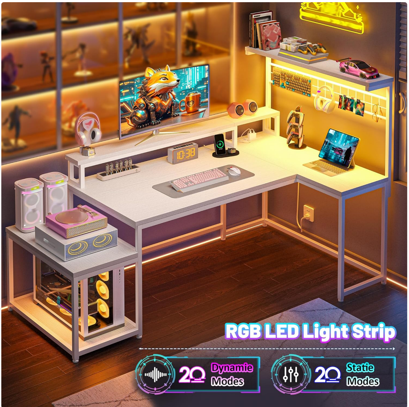
Image: The DurayLoly Gaming Desk with its RGB LED light strip illuminated, showcasing various color and dynamic mode options in a gaming environment.