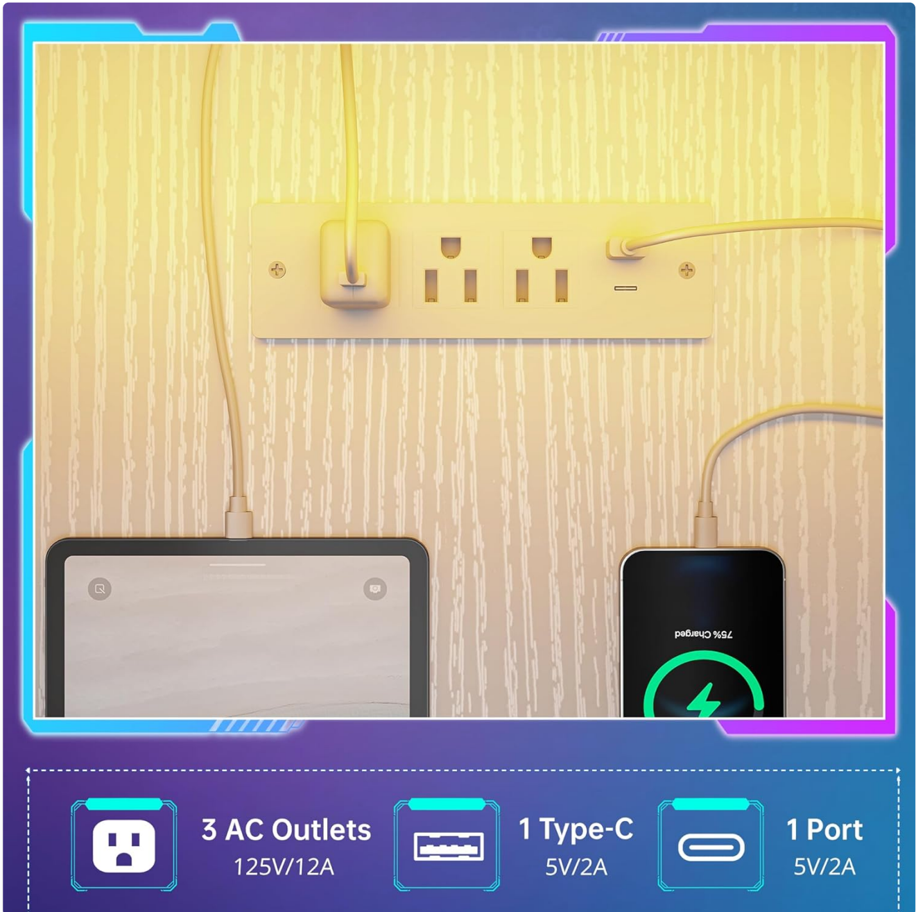
Image: A detailed view of the desk's integrated power strip, featuring three AC outlets and a Type-C USB port, with devices connected for charging.

The desk is equipped with 3 standard AC power outlets (125V/12A) and 1 Type-C port (5V/2A) for convenient charging of your devices. Simply plug your devices into the appropriate ports. Ensure the desk is connected to a grounded power source.