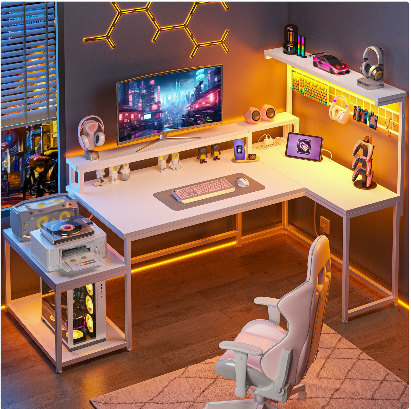
Image: The DurayLoly 56 inch L-Shaped Gaming Desk, showcasing its design and features in a modern room setting.