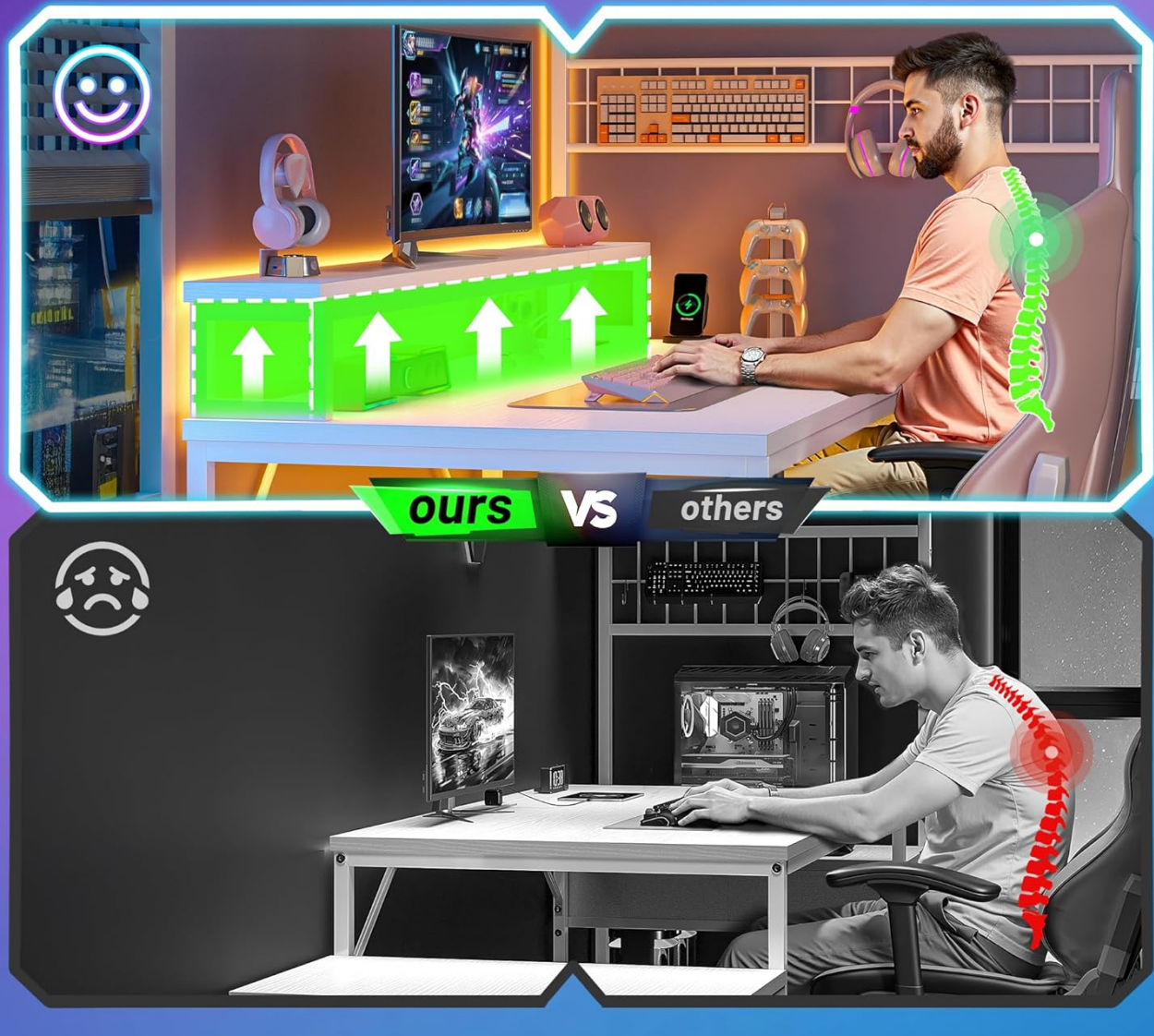
Image: A visual comparison highlighting the ergonomic benefits of the monitor stand, promoting correct sitting posture and reducing strain.

Keep Your Sitting Posture Correct and Spine Hurt Free