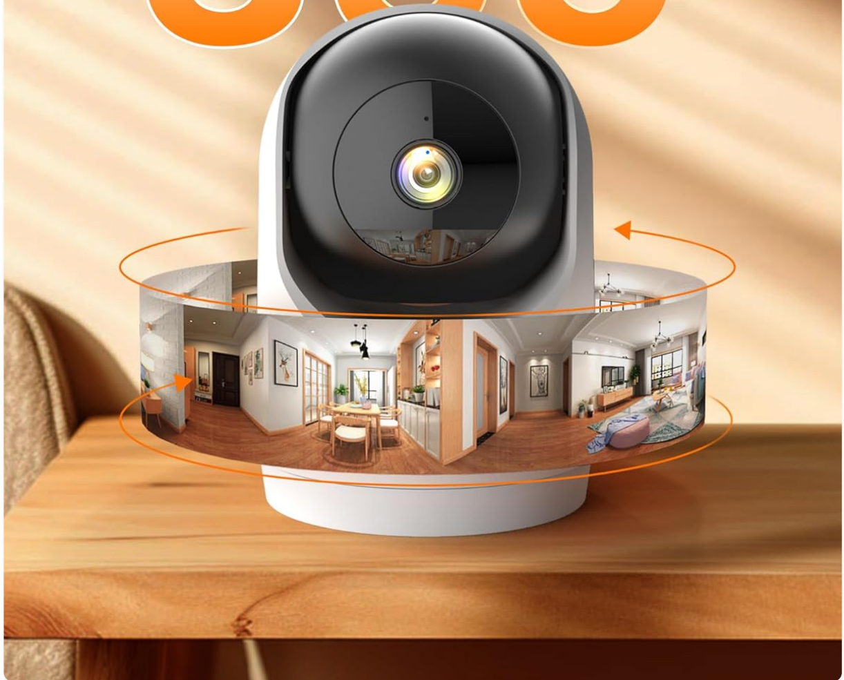
Image: Tenda CP3 Camera with its power adapter, USB cable, and wall-mounting kit.