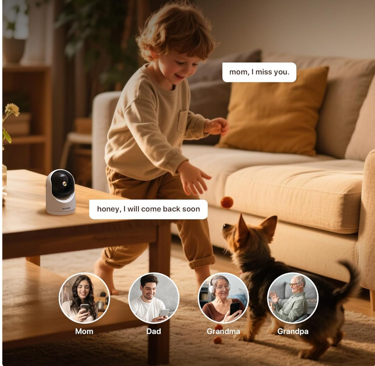
Image: A child and a dog in a living room, with speech bubbles indicating two-way audio communication through the Tenda CP3 Camera.

You or your family can communicate with the baby through the camera