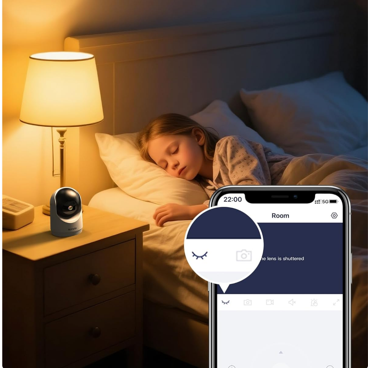
Image: A Tenda CP3 Camera monitoring a sleeping child in a dimly lit room, demonstrating its night vision capabilities.

You can customize the time to turn off the camera