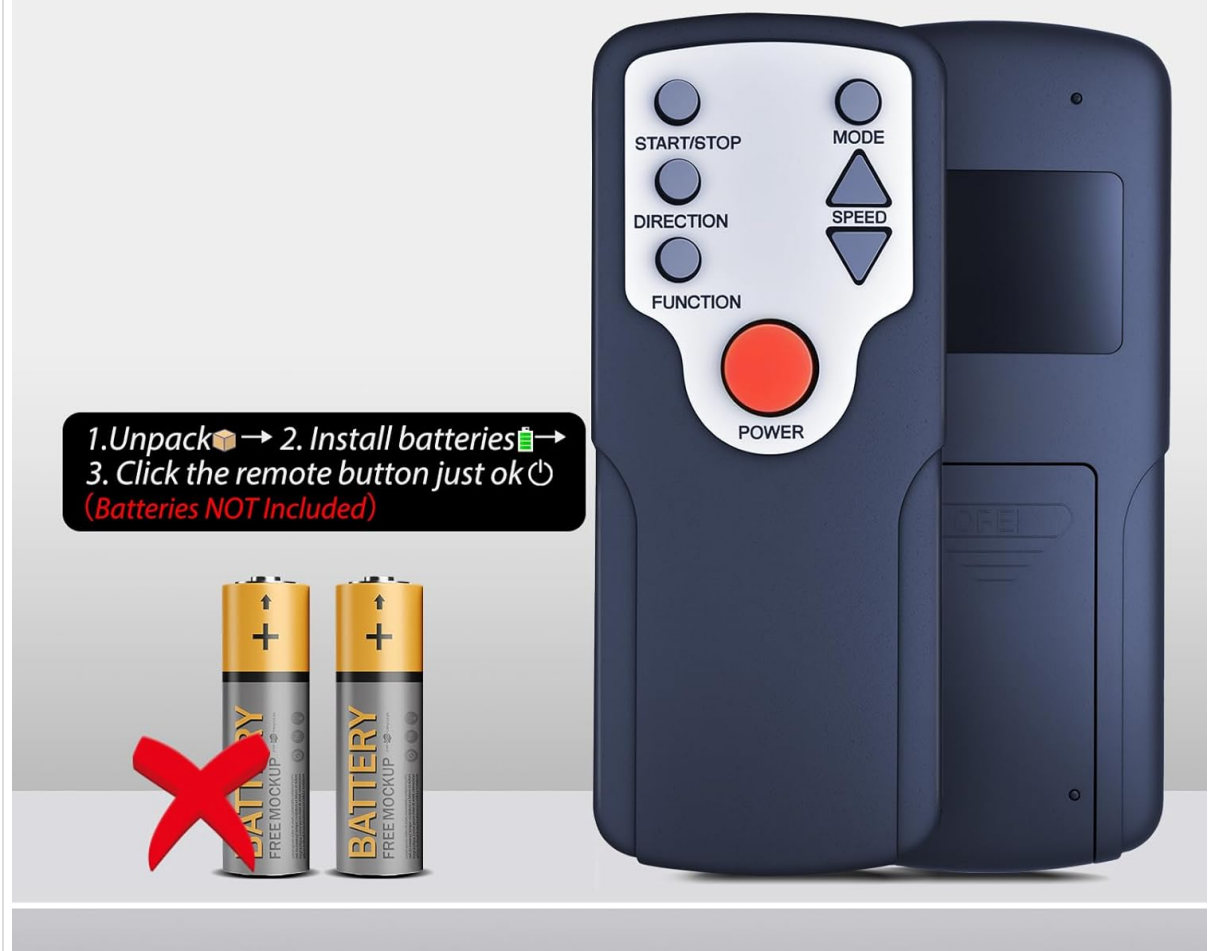
Image 2.1: Illustration demonstrating the correct method for installing two AAA batteries into the remote control's battery compartment.