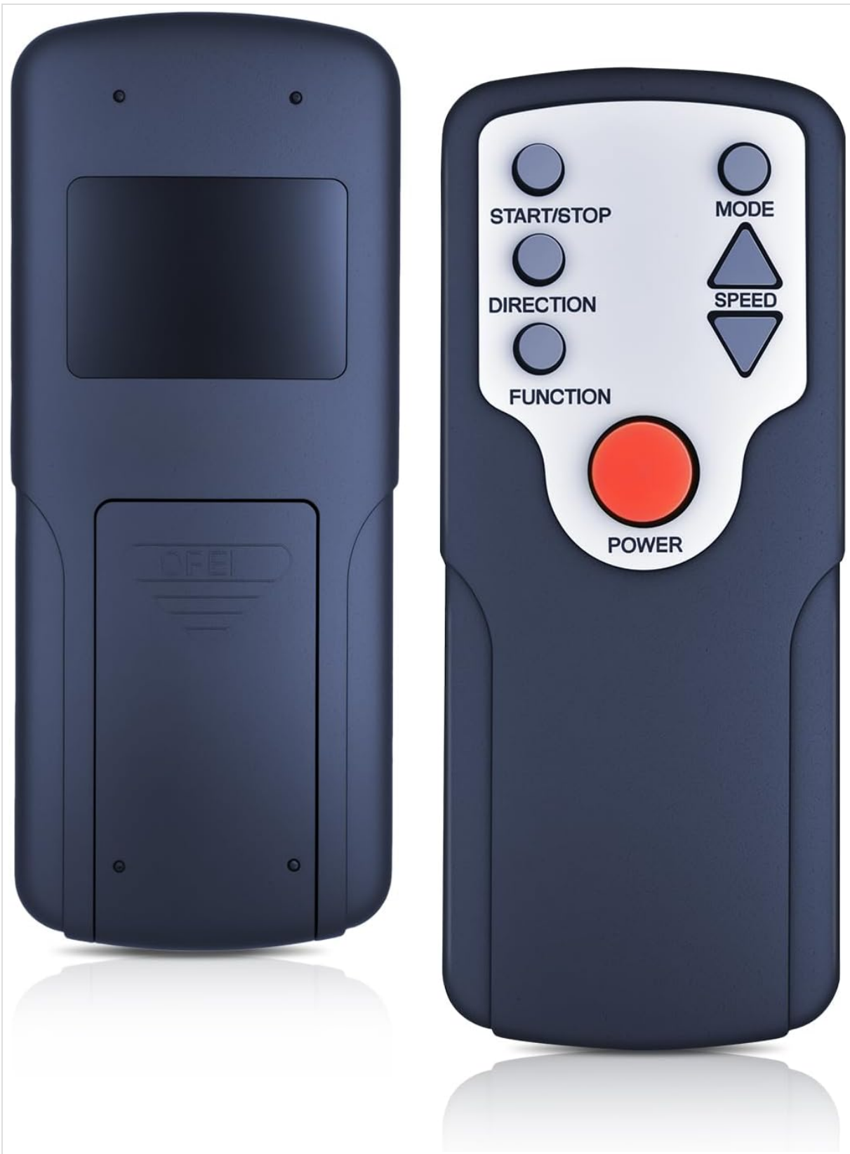
Image 1.1: Front and back view of the WDZP Under Desk Elliptical Machine Remote Control. The front features control buttons, while the back shows the battery compartment.