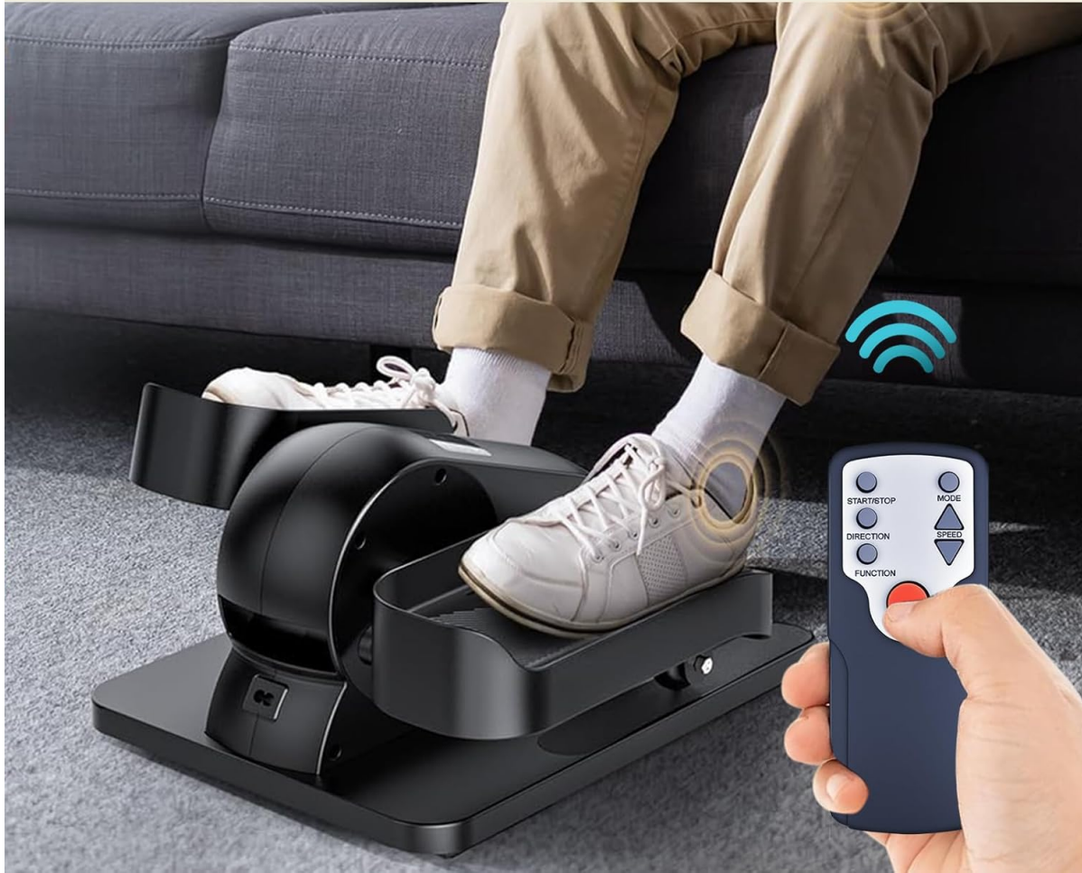
Image 3.1: A user is shown operating an under-desk elliptical machine with the WDZP remote control, demonstrating typical usage and convenience.