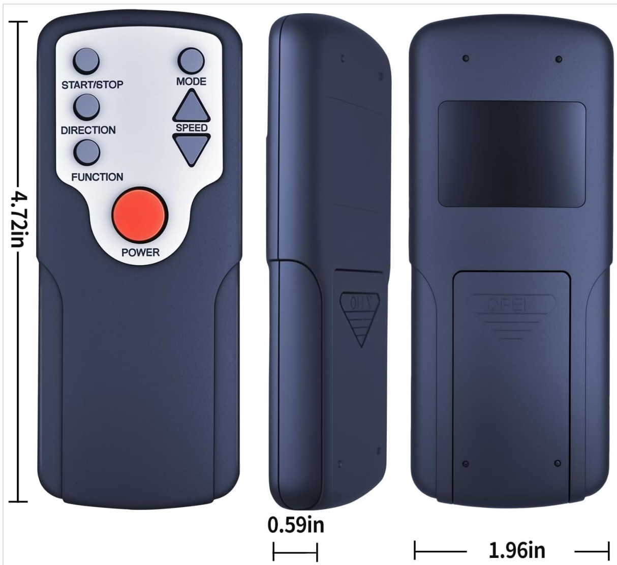
Image 6.1: This image provides the physical dimensions of the remote control: approximately 4.72 inches in length, 0.59 inches in width, and 1.96 inches in depth.