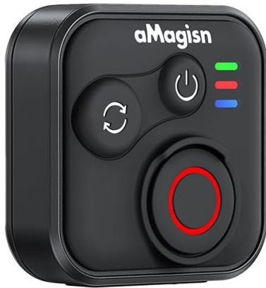
Remote Controller *1