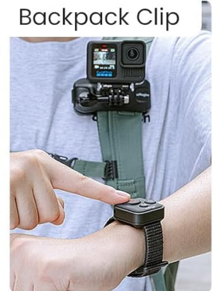
Image: Examples of how the remote control can be mounted horizontally or vertically using wrist straps, and various use cases like cycling, selfie sticks, and backpack clips.