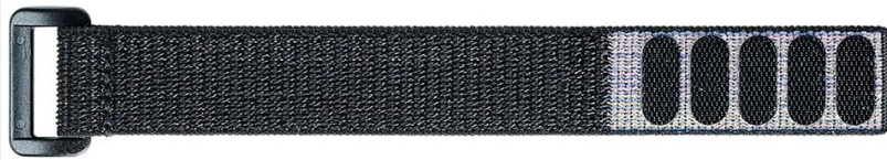
Short Wrist Strap *1