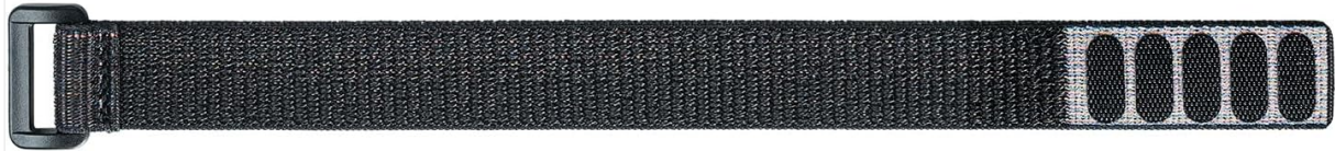
Long Wrist Strap *1

Image: Package contents including the remote, charging cable, and two wrist straps.