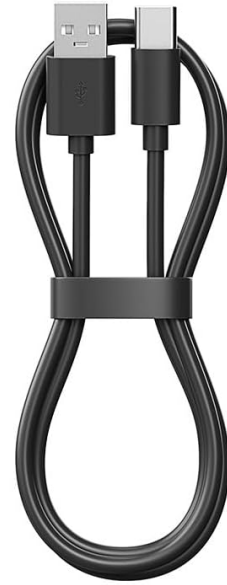
Charging cable *1