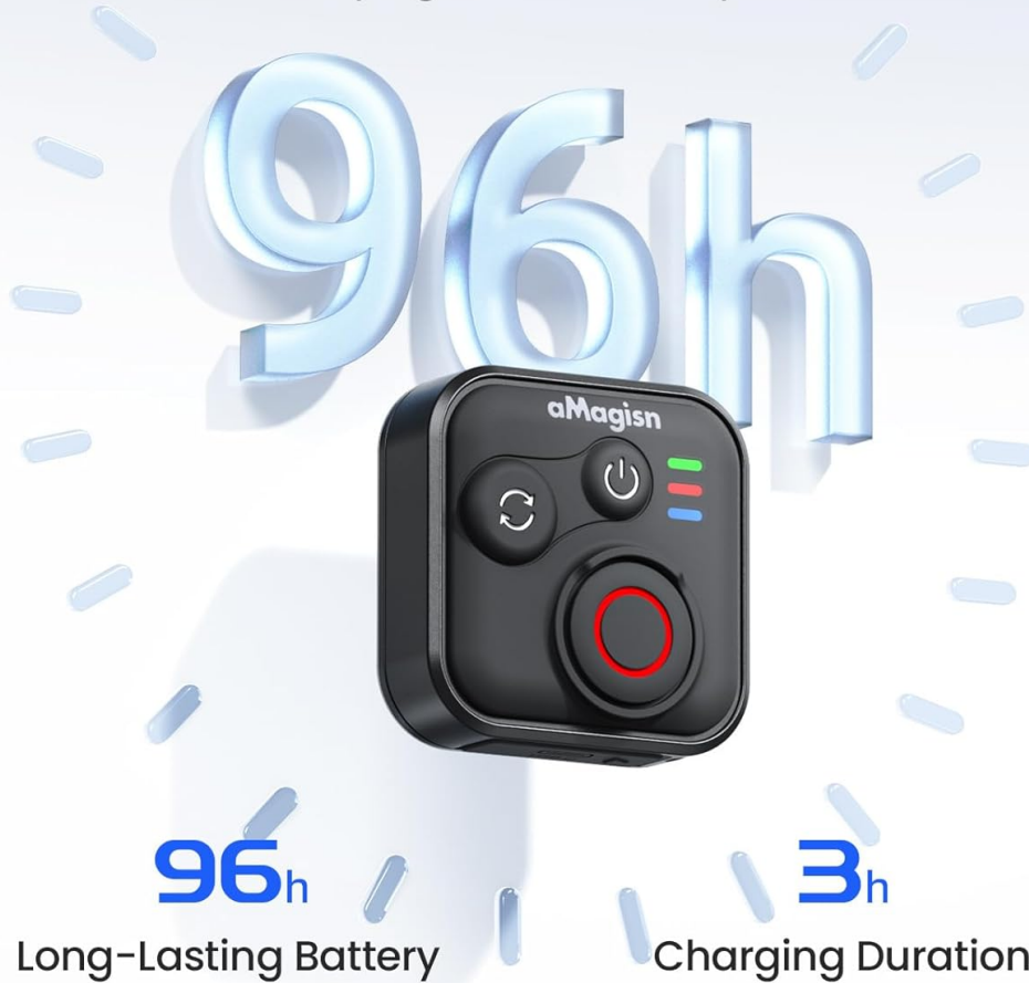
Image: Visual representation of the remote control's impressive 96-hour battery life and 3-hour charging time.

96 hours of continuous operation without worrying about battery life