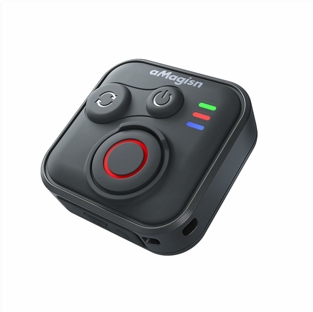
Image: The remote control demonstrating its Bluetooth 5.1 range, compatible with various devices.