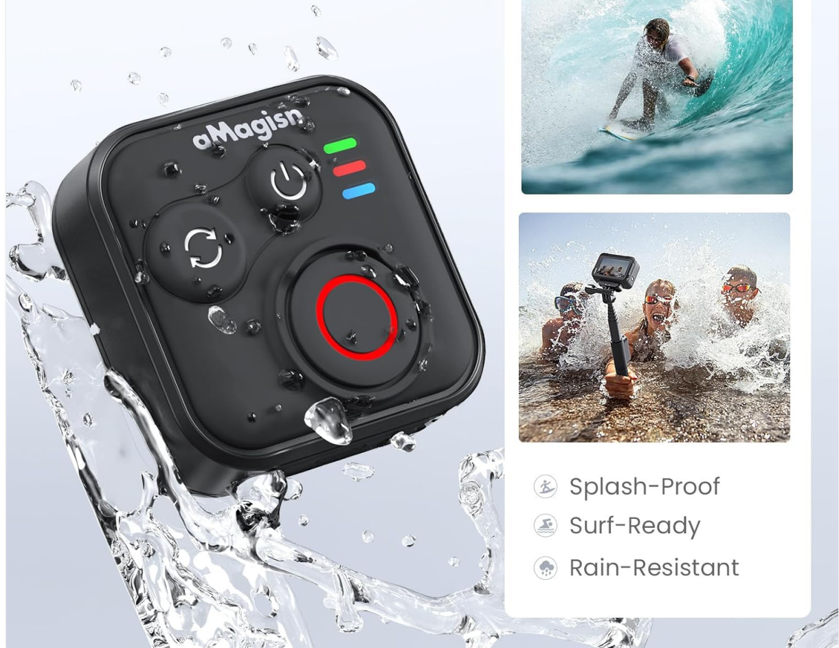
Image: The remote control demonstrating its waterproof capabilities, suitable for use in rain or near water.

Waterproof build & sealed USB tackle rain/surf with ease