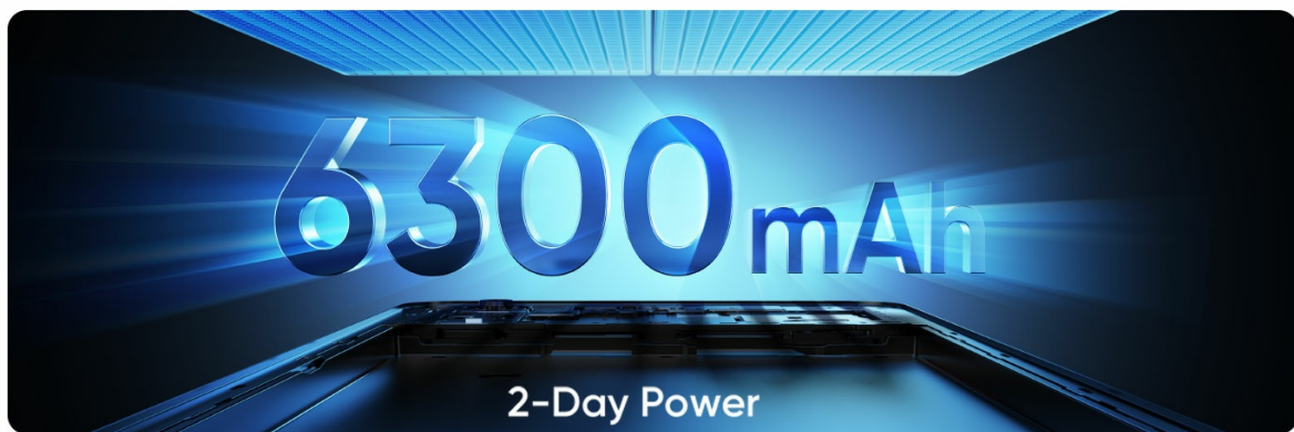
Image: Visual representation of the 6300mAh battery and its estimated usage times for various activities.