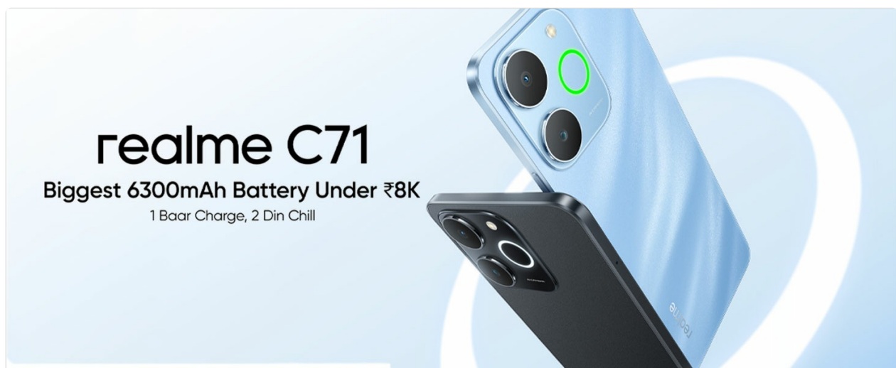
Image: Graphic illustrating the device's smooth performance capabilities.

Powered by the Unisoc T7250 chip and 4GB RAM, the realme C71 provides smooth multitasking and lag-free performance for applications and browsing.