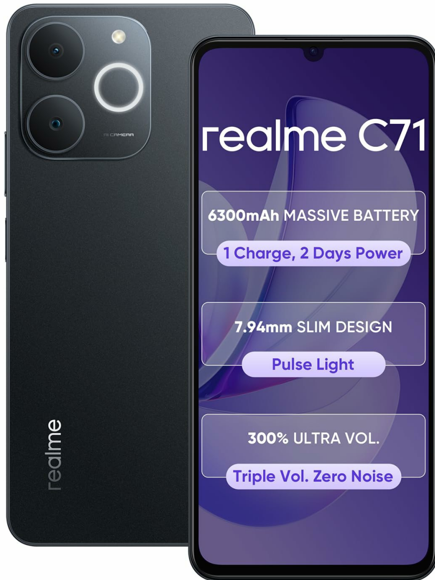
Image: realme C71 4G Smartphone, showcasing its sleek design.