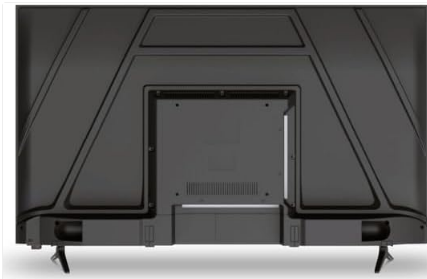
Image 4.2: Rear view of the Schneider 43A1 TV, highlighting connection ports.