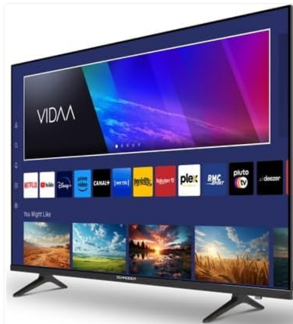
Image 5.1: Angled front view of the Schneider 43A1 TV, displaying the VIDAA Smart TV interface.

The integrated VIDAA Smart TV platform provides access to a variety of applications and streaming services. Connect your TV to the internet via Wi-Fi to enjoy features like Netflix, Prime Video, and YouTube. Bluetooth connectivity allows for wireless connection to compatible audio devices.