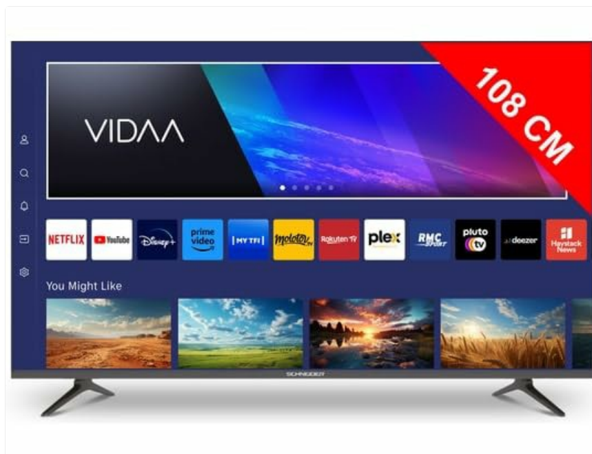
Image 1.1: Front view of the Schneider 43A1 TV with VIDAA interface.

This manual provides essential information for the safe and efficient use of your television. Please read it thoroughly before operating the device and retain it for future reference.